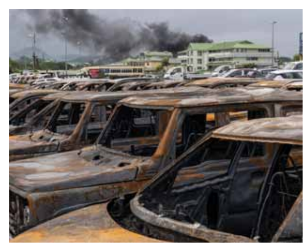
Burnt cars are lined up after unrest in Noumea, New Caledonia, Wednesday. France has imposed a state of emergency in the French Pacific territory of New Caledonia

Caledonians deserve," French Prime Minister Gabriel Attal said