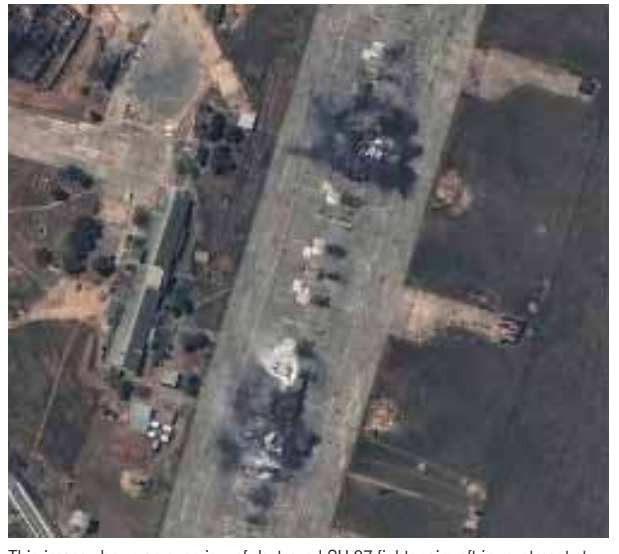
This image shows an overview of destroyed SU 27 fighter aircraft in revetment at Belbek air base in Crimea on Thursday.

Russian President Vladimir Putin said Friday that Moscow's offensive in Ukraine's northeastern Kharkiv region aims to create a buffer zone but has no plans to capture the city. Putin's comments on a trip to China were his first on the offensive launched on May 10, which opened a new front in the war and displaced thousands of Ukrainians within few days. It came hours after a massive Ukrainian drone attack on the Russia-occupied Crimean Peninsula early Friday caused power cutoffs in the city of Sevastopol after an earlier attack damaged aircraft and fuel storage at an airbase. In southern Russia, Russian authorities said the attack on Friday also set a refinery ablaze. Moscow launched attacks in the Kharkiv region in response to Ukrainian shelling of Russia's Belgorod region, Putin told reporters Friday on a visit to Harbin, China.