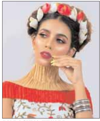
BY RACHNA TIWARI

The Indian fashion industry, with its rich heritage and vibrant textiles, is undergoing a metamorphosis. No longer confined to traditional methods, fashion entrepreneurs are embracing technology to create, market, and sell their designs in