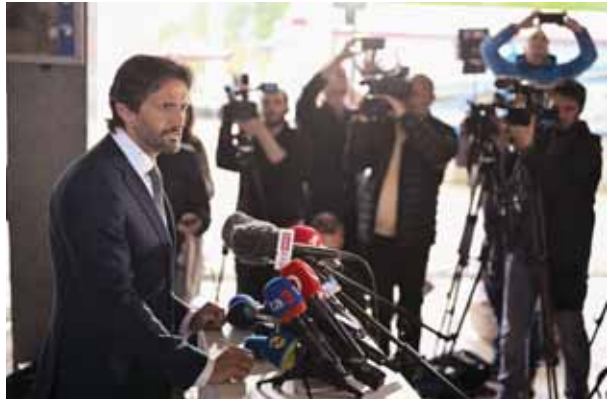
Deputy Prime Minister and Defence Minister of Slovakia Robert Kaliník speaks during a media briefing outside the F. D. Roosevelt University Hospital, where Slovak Prime Minister Robert Fico, who was shot and injured on May 15, is treated, in Banská Bystrica, central Slovakia, Friday.