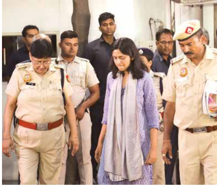
Aam Aadmi Party (AAP) Rajya Sabha MP Swati Maliwal leaves Delhi Chief Minister Arvind Kejriwal's residence at Civil Lines, in New Delhi, on Friday. The Delhi Police on Friday took Maliwal to the CM's residence to recreate the crime scene as it investigates the alleged assault on her there earlier this week, officials said