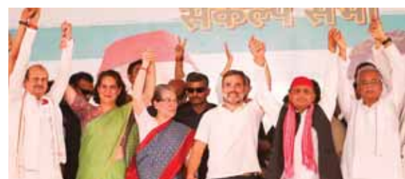
Congress leader and party candidate from Rae Bareilly constituency Rahul Gandhi with party leaders Sonia Gandhi and Priyanka Gandhi, Samajwadi Party (SP) chief and party candidate from Kanpur constituency Akhilesh Yadav, former Chhattisgarh Chief Minister Bhupesh Baghel and others during a public meeting for the Lok Sabha elections, in Rae Bareilly district, on Friday