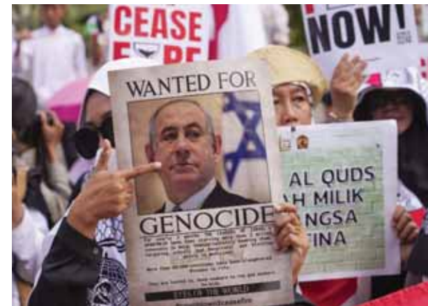
A protester holds a poster of Israeli Prime Minister Benjamin Netanyahu during a rally commemorating the 76th anniversary of the mass expulsion of the Palestinians from what is now Israel in 1948, often called the "Nakba" or Arabic for catastrophe, outside the U.S. Embassy in Jakarta, Indonesia on Friday.

Israel strongly denied charges of genocide on Friday, telling the United Nations' top court it was doing everything it could to protect the civilian population during its military operation in Gaza. The International Court of Justice wrapped up a third round of hearings on emergency measures requested by South Africa, which says Israel's military incursion in the southern city of Rafah threatens the "very survival of Palestinians in Gaza" and has asked the court to order a cease-fire. Tamar Kaplan-Tourgeman, one of Israel's legal team, defended the country's conduct, saying it had allowed in fuel and medication to the beleaguered enclave. "Israel takes extraordinary measures in order to minimize the harm to civilians in Gaza," she told The Hague-based court. A protester shouting "Liars" briefly interrupted Kaplan-