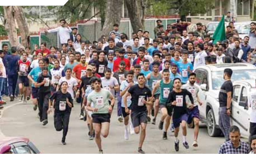
Participants at the 'Run For Vote' marathon for the Lok Sabha election awareness, in Shimla