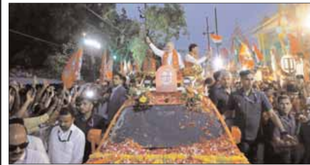
Union Home Minister Amit Shah with party candidate Sanjay Seth during a road show for Lok Sabha elections, at Chutia in Ranchi on Friday.