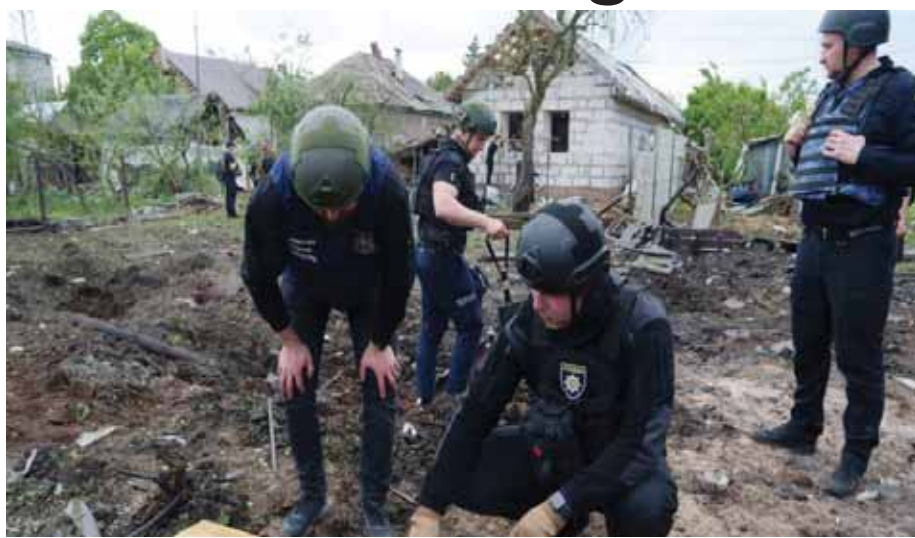
A Ukrainian police officer and war crime prosecutor inspect fragments of a glide bomb in front of damaged house, after a Russian airstrike on a residential neighbourhood in Kharkiv, Ukraine, Saturday.

Russia said it shot down some 60 drones and several missiles over its territory while Ukraine in turn said it destroyed over 30 Russian drones. At least four people were reported killed in an attack on the outskirts of Kharkiv on Sunday as Russia pushed ahead with its renewed offensive in Ukraine's war-ravaged northeast. Russian air defences shot down 57 Ukrainian drones over the southern Krasnodar region overnight, the Russian Defence Ministry said. Local military officials said drone debris hit an oil refinery in the town of Slavyansk-on-Kuban, but there was no fire or damage. News outlet Astra published videos appearing to show an explosion at the refinery as it was hit by a drone. The videos could not be independently verified. Nine long-range ballistic missiles and a drone were destroyed over the Russia-occupied Crimean Peninsula,