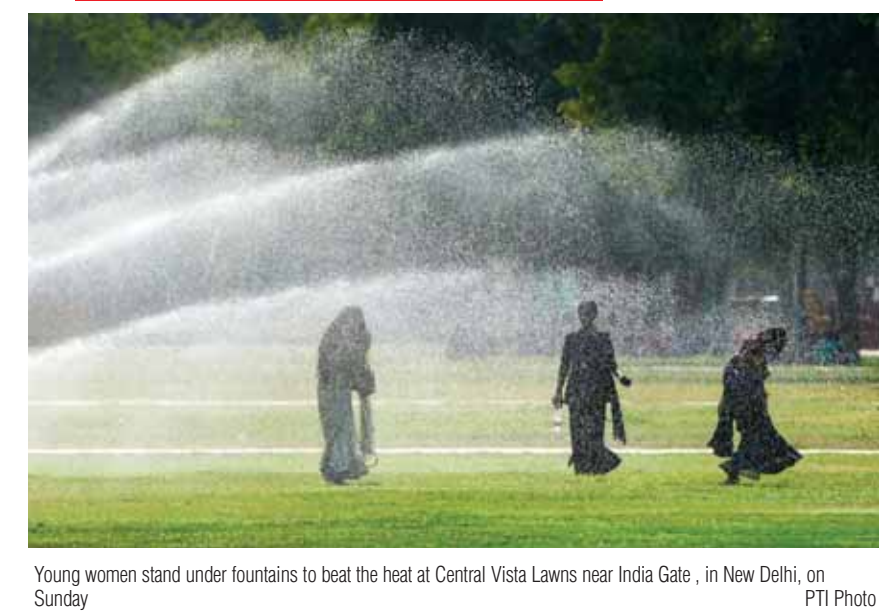
Young women stand under fountains to beat the heat at Central Vista Lawns near India Gate, in New Delhi, on Sunday.