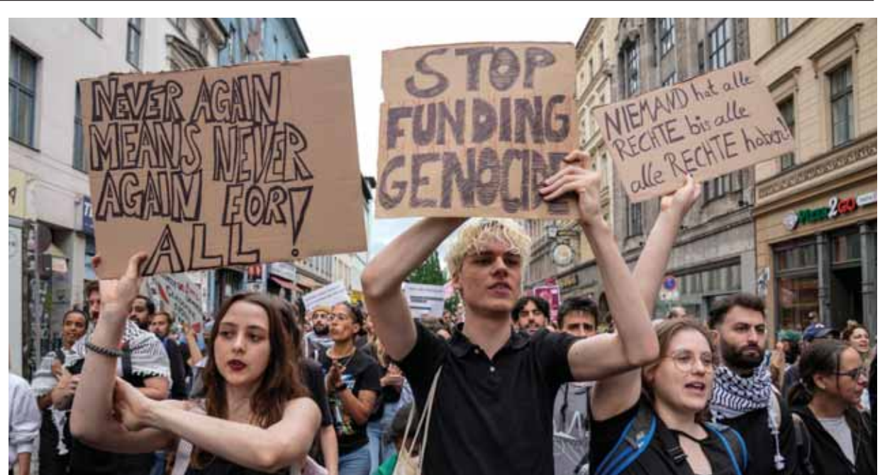
People take part in a pro-Palestinian rally in Berlin, Saturday.

on base transceiver stations to transmit signals, are unable to reach outer islands because they have limited coverage. Starlink's satellites, which remain in low orbit, will help them deliver faster internet with nationwide coverage. Health Minister Budi Gunadi Sadikin said of the more than 10,000 clinics across the country, there are still around 2,700 without internet access. "The internet can open up better access to health services as communication between regions is said to be easier, so that reporting from health service facilities can be done in real time or up to date," he said. During his first in-person visit to Bali, Musk is also scheduled to participate in the 10th World Water Forum, which seeks to address global water and sanitation challenges.