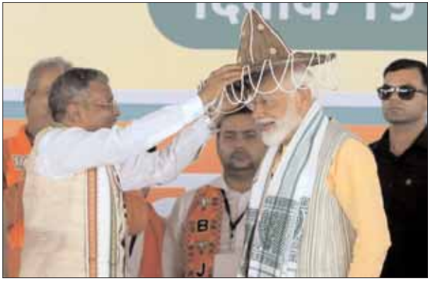
Prime Minister Narendra Modi is being welcomed / greeted during an election rally in favor of BJP candidate from Jharkhand Parliamentary constituency Vidut Baran Mahato for the on-going parliamentary election-2024 at Ghatshila area near Jamshedpur under East Singhbhum district of Jharkhand on Sunday, May 19, 2024.

He continued, "Parties like Congress, JMM, and RJD have looted Jharkhand at every opportunity, and Congress is the mother of corruption."