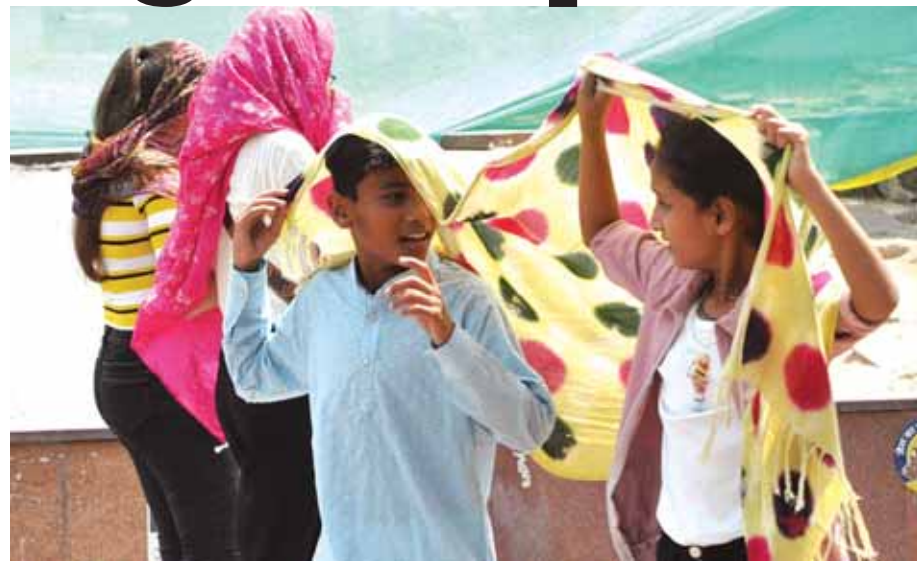
Delhiites use scarves to shield themselves from the hot summer

Most of the candidates have taken to indoor meetings during the morning and afternoon hours. However, the buzz around the elections on May 25 has been negligible during the day. Political parties are worried of low turnout of voters due to extreme heat and summer vacations in the national Capital.