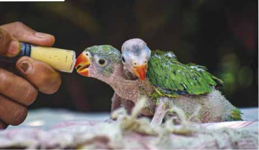
A man feeds a parrot's chick that fell off a tree, in Guwahati