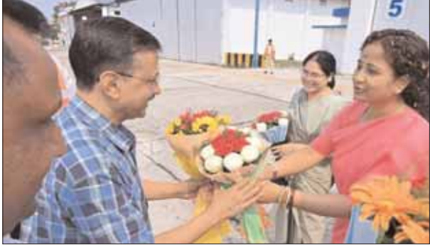
Delhi Chief Minister Arvind Kejriwal being welcomed by JMM leader Kalpana Soren in Jamshedpur Airport on Tuesday.

He praised Kalpana Soren, wife of jailed JMM leader Hemant Soren, comparing her to the iconic freedom fighter Jhansi ki Rani for her defiant stance against Prime Minister Narendra Modi. "With the intention PM