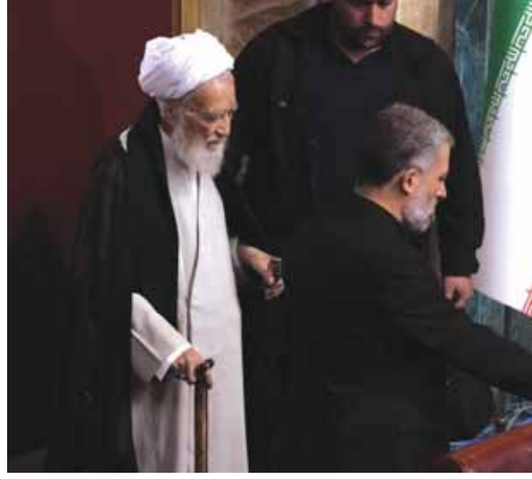
Ayatollah Mohammad Ali Mowahedi Kermani arrives to attend the first session of Assembly of Experts after an election that decided the new assembly, in Tehran, Iran, Tuesday. Under Iranian constitution the 86-member all-cleric assembly has the right to monitor the performance of supreme leader, and choosing or dismissing him. Mowahedi Kermani was picked Tuesday as head of the assembly.