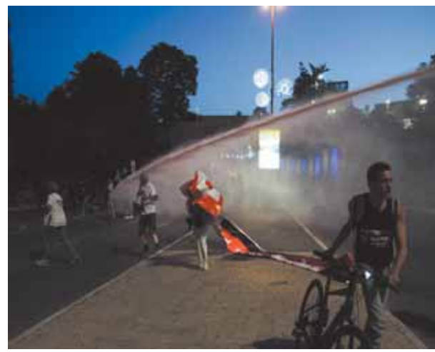
Police use water cannon to disperse demonstrators blocking a road during a protest against Israeli Prime Minister Benjamin Netanyahu's government, and calling for the release of hostages held in the Gaza Strip by the Hamas militant group, outside the Knesset, Israel's parliament in Jerusalem on Monday.

While no one faces imminent arrest, the announcement deepens Israel's global isolation at a time when it is facing