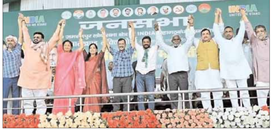
Delhi Chief Minister Arvind Kejriwal, Jharkhand CM Champai Soren, JMM leader Kalpana Soren among others during an election rally in Jamshedpur on Tuesday.

of 14 seats in Jharkhand. He said that 2.5 crore people of Delhi are grateful to Hemant Soren because he had delivered oxygen to Delhi during Corona, which saved the lives of many people. He said that dictatorship is going on in the country. If Hemant Soren is sent to jail, then tomorrow Champai Soren will be put in jail. The time has come to answer this. He said that Narendra Modi hates the tribal society.