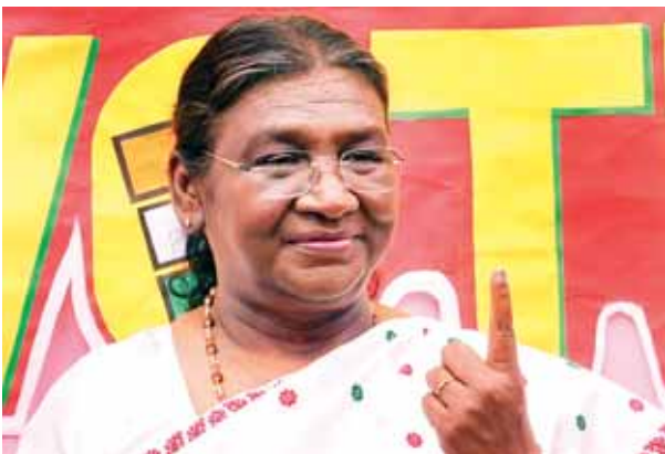
President Droupadi Murmu shows her finger marked with indelible ink after casting vote at Dr Rajendra Prasad Kendriya Vidyalaya, President's Estate, during the sixth phase of Lok Sabha elections, in New Delhi, on Saturday

According to the poll body, this is a tentative figure. The Delhi Chief Electoral Officer said there were no reports of technical snags or delays in the commencement of voting at any polling station. The national Capital saw a