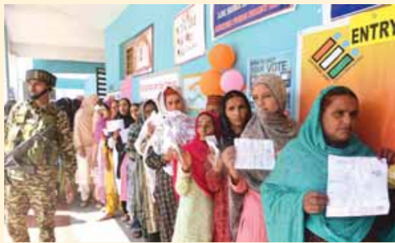
People wait in a queue to cast their votes at a polling booth during the sixth phase of Lok Sabha elections, in South Kashmir, on Saturday

With 'urban apathy' casting its shadow on the sixth phase of polling, the voter turnout stood at 60 per cent as of 8 pm on Saturday in 58 constituencies in six States and two Union Territories amid adverse weather. West Bengal recorded the highest turnout at 78.19 per cent amid sporadic incidents of violence reported from some areas while Jammu and Kashmir recorded voter turnout at 52.28 per cent, highest in the last 35 years. In the 2019 last general elections, the erstwhile Anantnag seat saw a meagre turnout of 8.9 per cent. However, the boundaries of the constituency extended across the Pir Panjal to include Jammu's Rajouri and Poonch. The three parliamentary