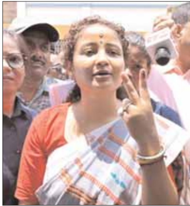
JMM leader Kalpana Soren shows her finger marked with indelible ink after casting her vote during the sixth phase of Lok Sabha election in Ranchi on Saturday.