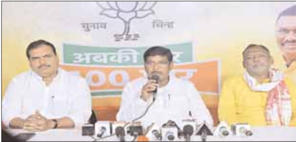
BJP MP Aditya Sahu along with others during a press conference in Ranchi on Saturday.