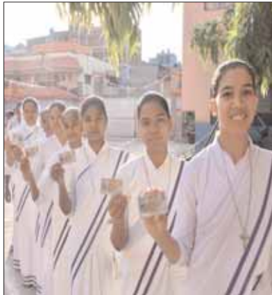
Nurs wait in a queue to cast their votes at a polling station during the sixth phase of Lok Sabha election in Ranchi on Saturday.