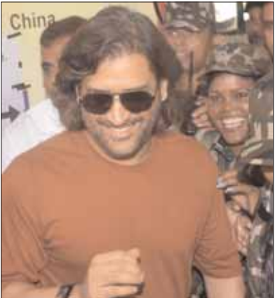
Cricketer Mahendra Singh Dhoni after casting his vote at a polling booth during the sixth phase of Lok Sabha election in Ranchi on Saturday.