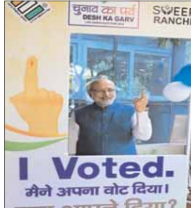
Governor CP Radhakrishnan poses for a picture after casting his vote in Ranchi on Saturday.