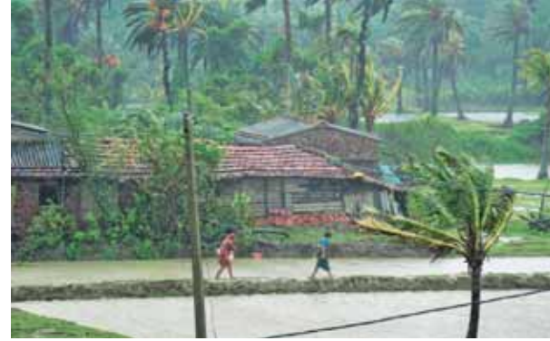
Villagers at a flooded area following the landfall of Cyclone Remal in South 24 Parganas district on Monday

At least two persons were killed and several others injured as severe cyclonic storm Remal hit Bengal coasts on Sunday night, sources at State secretariat Nabanna said, adding the NDRF and SDRF teams were working overtime to restore normalcy in affected areas most of which lie in the vicinity of Sunderbans. Though the speed of the storm reduced to a great degree by Monday morning, incessant rains continued to lash eight districts of South Bengal nearly throwing life out of gear. The first death occurred after a wall collapsed under the impact of the rains at Bibir Bagan near Park Circus and Entally area of Kolkata, police said. Another person died when a tree collapsed under the impact of driving rains and gusting winds at 135 kmph at Mousuni Islands at the mouth of Bay of Bengal off Sunderbans. At least eight other persons were injured at various places in Kolkata and Kakkdwip, sources said. Severe cyclone Remal made landfall between Sagar Islands in Bengal and Khepupara in neighbouring Bangladesh, sources said on Monday. Rivers surrounding most of the riverine islands — like Jharkhali, Geokhali,