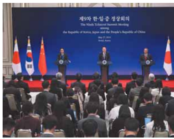
South Korean President Yoon Suk Yeol, center, speaks as Japanese Prime Minister Fumio Kishida, left, and Chinese Premier Li Qiang listen during a joint news conference in Seoul, South Korea Monday.

After meeting with Li, Kishida told reporters that he expressed serious concerns about the