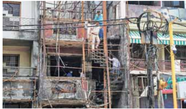
He declared that no culprit will be spared, irrespective of their status and announced stringent new safety regulations for nursing homes over nine metres tall, mandating water sprinklers