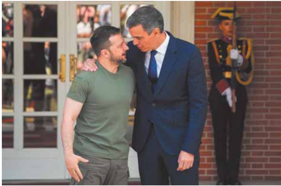
Ukrainian President Volodymyr Zelenskyy, left, is welcomed by Spain's Prime Minister Pedro Sanchez at the Moncloa palace in Madrid on Monday.

Spain's King Felipe VI met Zelenskyy at the capital's Barajas airport. The Ukrainian leader was due to hold talks with Prime Minister Pedro Sánchez about what local media reported as a planned 1.1 billion euros ($1.2 billion) agreement for Spain to supply Ukraine with more weapons. Zelenskyy had been due to visit Spain earlier this month but he postponed all his foreign trips after the Kremlin's forces launched a cross-border offensive in the northeastern Kharkiv region and left Ukrainian troops reeling. That push has further strained Ukraine's already depleted army, which in recent months has been fighting Russia's intense drive deeper into the partially occupied eastern