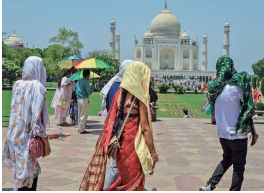
Tourists at the Taj Mahal on a hot summer day in Agra

With temperatures soaring as high as 47 degrees Celsius in some areas of the national Capital, Delhi, and in North West States like Rajasthan, Punjab, Chandigarh, and Haryana, as well as in Central parts of the country, people are grappling with intense heatwaves that have made outdoor activities nearly impossible. This challenging situation is expected to persist for at least the next three days, with the weather department issuing a red alert for heatwaves in several northern Indian cities, including Rajasthan. The Union Health Ministry has already advised employers to take essential heat safety measures at the workplace. "From providing hydration stations to scheduling outdoor tasks during cooler hours, let's ensure our workers stay cool, healthy, and productive," the Ministry said in a post on social media platform X. It also advised employers to train workers to recognise symptoms of heat-related illness. Relief from the blistering weather is anticipated from June 1, thanks to a fresh western disturbance, according to forecasts by the