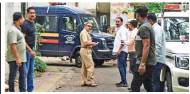
Two doctors of the Sassoon General Hospital being taken into police custody after their arrest for alleged manipulation of blood samples and destruction of evidence in the case of a car accident involving a 17-year-old boy in Pune

47.99 per cent in 1996 and 29.93 per cent voter turnout in 1989. Notably, Baramulla had witnessed 5.48 per cent polling in 1989; 46.65 per cent in 1996; 41.94 per cent in 1998 and 34.6 per cent in 2019. Anantnag witnessed voting at 8.98 per cent in 2019 and around 5 per cent in 1989. According to EC, more young people have asserted their faith and embraced democracy in a big way. Another interesting perspective is the electors in the age group of 18-59 years form the major part of electors in the UT, it underlined. As per data, Baramulla witnessed voter turnout (between age group of 18 and 39) at 56.02 per cent voting, Srinagar at 48.57 per cent; Anantnag-Rajouri at 54.41 per cent; Udhampur 53.57 per cent and Jammu at 47.66 per cent.