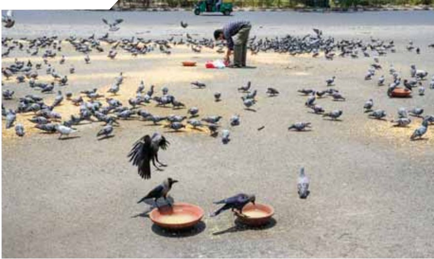
A man feeds pigeons and crows on a hot summer day, in New Delhi

The relevance of Buddha's teachings in the contemporary world is profound. His principles of non-violence and compassion offer a path toward greater harmony in a world often plagued by conflict. The Buddha's teachings also emphasise respect for all forms of life and interdependence, principles crucial for addressing today's environmental challenges. Embracing these values fosters sustainable practices and a deeper connection with nature. Ethical living, as outlined in the Buddha's Eightfold Path, remains pertinent in personal, professional and societal contexts, promoting integrity and cooperation. Practitioners of this philosophy such as the Vietnamese Zen Master Thich Nhat Hanh, alias Thich Nhat Hanh, have advanced the principles of non-violence, compassion and mindfulness to promote global peace. Their "Engaged Buddhism" encourages integrating mindfulness into everyday life and social activism, advocating for peaceful conflict resolution and environmental care. His teachings on deep listening and loving speech, help bridge divides and heal communities. Similarly, the Tibetan spiritual leader, the Dalai Lama promotes interfaith dialogue, compassion and ethical responsibility, inspiring global movements for human rights and sustainability. These leaders illustrate how ancient Buddhist principles can address modern challenges, fostering a culture of peace and understanding worldwide.