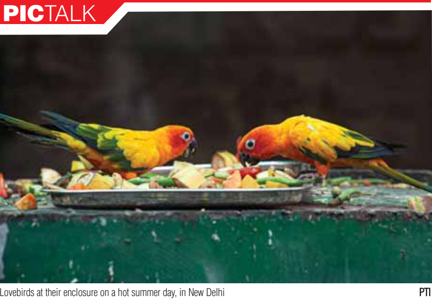
Lovebirds at their enclosure on a hot summer day, in New Delhi

This is despite the fact that Israeli tanks have been seen rolling down central Rafah for the first time since the war began on October 7 last year. In another setback to Israel globally and perhaps as part of a larger signal for it to stop bloodying the Gaza Strip with the murder of innocent people — nobody actually minds if only the Hamas terrorists are annihilated — Spain, Norway and Ireland have acknowledged Palestine's independence. The three countries did not recognise the existence of a State; they just acknowledged its potential. As a result of the change, the Palestinian Authority and the three nations will have closer diplomatic ties. Everyone has declared that they will acknowledge Palestine based on its pre-1967 borders, with East Jerusalem serving as its Capital. Already, 143 of the 193 members of the UN General Assembly have recognised Palestine. The latest acknowledgments are the most compelling proof to date that the concept might be gaining support in the economically and diplomatically powerful western European States. The West Bank, which Israel has occupied, and the Gaza Strip, which is under siege and where Israel is conducting a war that has claimed more than 36,000 lives, make up what is left of ancient Palestine. However, it must be recorded to his credit that Israel Prime Minister Benjamin Netanyahu has said the Rafah incident was a “tragic mishap”.