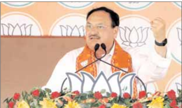
BJP National President, J P Nadda addresses a public meeting in favour of Dumka Lok Sabha candidate Sita Soren in Dumka on Wednesday.

He said that the people of Congress and their alliance were creating hurdles in the matter of Lord Ram. They will not respect Lord Ram in the country. They will not respect Lord Shri Krishna. They will insult our Gods and Goddesses and will go to ask for votes from the public. The public will answer them through votes. The whole country was saying that Lord Ram's temple should be built in Ayodhya, but the people of Congress and their alliance