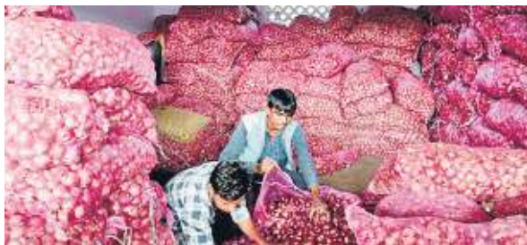
Earlier in the day, the direc-

Explaining the rationale behind the decision, Khare said the "ban on onion exports has been removed from today (Saturday) because the supply situation is comfortable and prices are stable in both mandies as well as retail markets." The modal price at Lasalgaon mandi in Nashik was Rs 15 per kg in April.