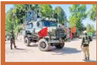
More than 20 persons were detained for questioning as the security forces are gathering clues to neutralise the terrorists who fled into nearby dense forests after carrying out the ambush near Shahsitar in Surankote area on Saturday evening.

A breakthrough eluded the security forces in the Poonch terrorist attack on a convoy of Indian Air Force even as a massive search operation in a vast area of the Jammu and Kashmir district entered the third day on Monday, officials said.