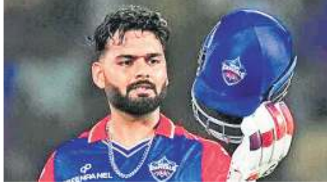
All eyes on Fraser-McGurk and Pant against rampaging Royals

The Capitals have been inconsistent so far, winning five and losing six of their last 11 games. While winning the remaining three games is a must for Pant's men, even that will only take them to 16 points which might not be enough to qualify for the last four stage of the tournament.