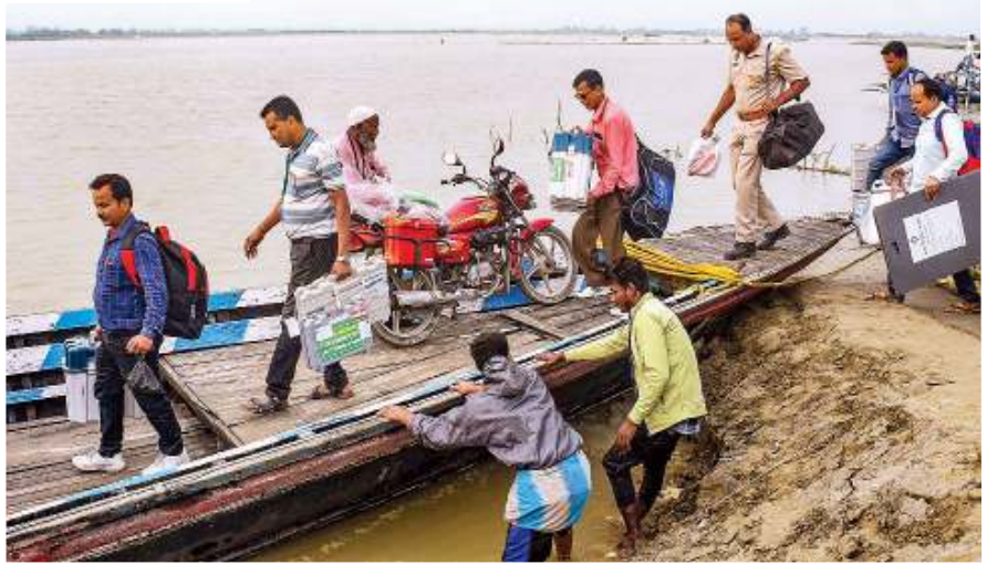
Polling officials travel via a boat to reach their respective polling booths, a day before the voting, in Kamrup.