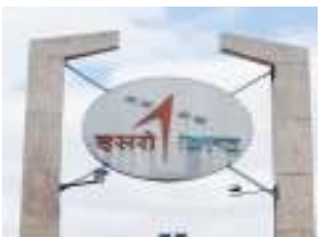
with the support of other launch vehicle centres of ISRO.

ISRO on Monday said it is developing a 2,000 kN (kilonewton) thrust semi-cryogenic engine working on a Liquid Oxygen (LOX) Kerosene propellant combination for enhancing the payload capability of Launch Vehicle Mark-3 (LVM3) and for future launch vehicles.