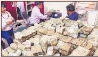
agency from some other premises being searched in the state as part of a money laundering investigation linked

The Enforcement Directorate on Monday claimed to have recovered an estimated Rs 25 crore 'unaccounted' cash and several official documents during searches on the premises of a domestic help of a secretary of Jharkhand minister Alamgir Alam, official sources said. A cache of more than Rs 3 crore cash was separately seized by the central