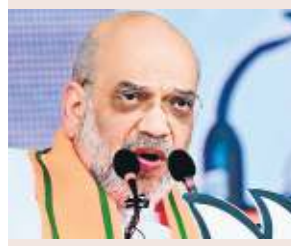
PNS ■ SAMASTIPUR (BIHAR)

According to ISRO, semi-cryogenic engine ignition is achieved using a start fuel ampule which uses a combination of Triethyle Aluminate and Triethyle Boron developed by Vikram Sarabhai Space Centre (VSSC) and used for the first time in ISRO in the 2000 kN semi-cryogenic engine.