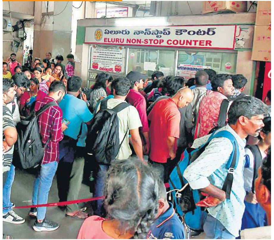
Passenger rush at Pandit Nehru Bus Station (PNBS) in Vijayawada on Saturday as voters head for their hometowns to exercise their franchise on May 13.