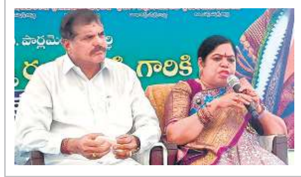
Botsa Jhansi Lakshmi defended her track record of advocating for the preservation of the Visakhapatnam Steel Plant in Parliament. She insisted that the plant's future must remain in the public sector to bolster the region's growth and job opportunities.

During a press conference on Saturday, Botsa Jhansi Lakshmi defended her track record of advocating for the preservation of the Visakhapatnam Steel Plant in Parliament. She insisted that the plant's future must remain in the public sector to bolster the region's growth and job opportunities. Furthermore, she underscored Visakhapatnam's significance