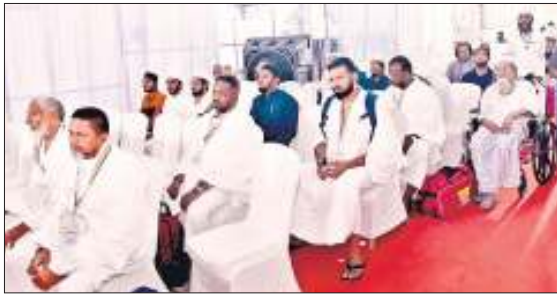
Haj pilgrims at the Haj camp on the premises of Eidgah Jama Masjid near the Gannavaram airport

In all, 692 Haj pilgrims from across the State have left for Jeddah in the last three days. As many as 644 pilgrims left in the first two flights. The last flight from the Gannavaram Airport to Jeddah departed with 48 pilgrims at 7.10 am on Wednesday.