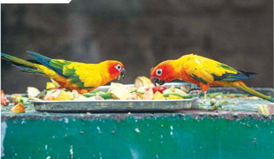
Lovebirds at their enclosure on a hot summer day, in New Delhi