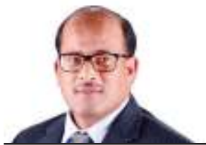
M J WARS

Artificial Intelligence (AI) is the ex-novo computer technology that essentially deals with developing machines capable of imitating human behaviour. The Encyclopedia Britannica defines AI as the "ability of a computer or robot to perform tasks commonly associated with intelligent beings such as perception, critical thinking and decision-making". As far as the human mind is concerned, first, it processes the information, analyses the processed information from various angles and finally arrives at a logical conclusion. On the contrary, AI is a software programme that solely relies on pre-fed computer data to answer a query. In the entire process, the computer system behaves like