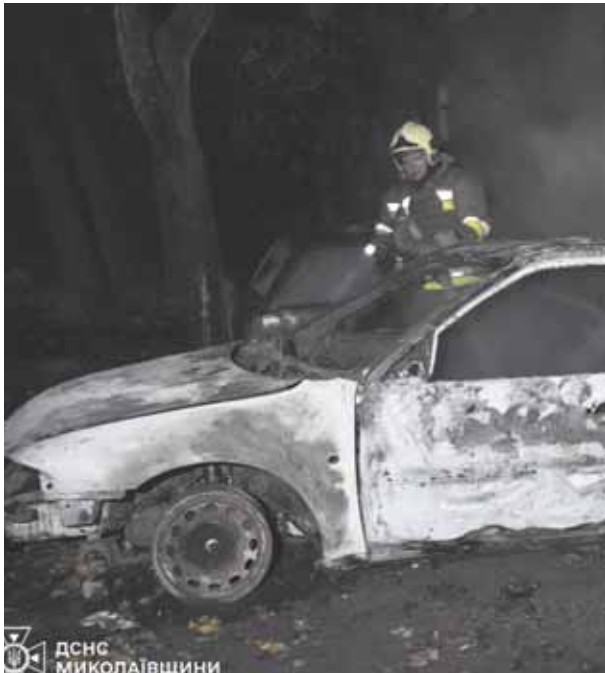
In this image provided by the Ukrainian Emergency Service on Monday, a firefighter works on a site of a Russian attack on residential area in Mykolaiv, Ukraine.

Zelenskyy said, in an apparent effort to unnerve Ukrainians and wear down their willingness to keep up a war that is approaching its 1,000-day milestone. “Every day, every night, Russia commits the same terror,” Zelenskyy said in a post on the Telegram messaging app. “Except that an increasing number of civilian objects are becoming targets.” Both Russia and Ukraine are waiting to see how Washington will change its policy on the war after Donald Trump takes office in January. The US is the biggest provider of military help to Ukraine but Trump has chided the Biden administration for giving Kyiv tens of billions of dollars of aid. The major cities struck Monday by Russia are close to the war’s around 1,000-km (600-mile) front line. Russian drones hammered the southern city of Mykolaiv, killing five people and injuring a 45-year-old woman, local