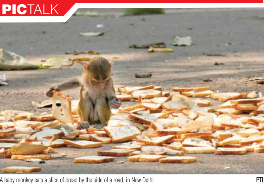
A baby monkey eats a slice of bread by the side of a road, in New Delhi

India Climate Report also points to a significant data gap. While the India Meteorological Department (IMD) has made strides in tracking events like warm nights, it lacks absolute temperature benchmarks, which many other countries use to enhance climate data accuracy. The lack of comprehensive, real-time data on climate-related damages impedes effective planning and resource allocation, especially in vulnerable regions. Several factors have contributed to India’s vulnerability which must be addressed. The lopsided development, scant regard to the climate impact and allowing reckless construction in hills must stop. This pattern of ‘bad development’ worsens the impact of natural disasters, transforming regions with poor infrastructure or unplanned urban sprawl into high-risk areas. As the world approaches the dangerous threshold of 1.5°C of warming above pre-industrial levels, India’s situation signals the urgent need for effective climate policies, mitigation strategies and public awareness. The ‘India Climate Report 2024’ serves as a somber reminder of the escalating costs of climate inaction. A collective and urgent response is needed, one that includes better data collection, sustainable urban planning and policies aimed at reducing greenhouse gas emissions. Only then can India hope to protect its people and environment.