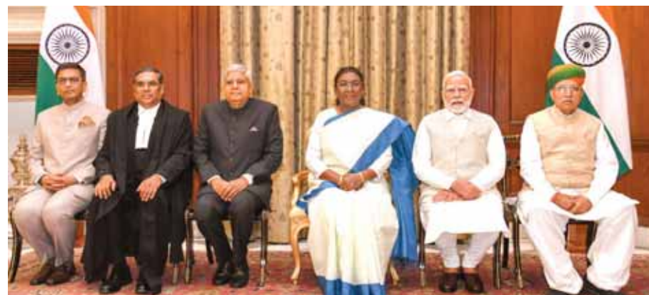
Newly sworn-in Chief Justice of India Sanjiv Khanna with President Droupadi Murmu, Vice President Bhankar, Prime Minister Narendra Modi, Justice (ret.) DY Chandrachud and Law Minister Arjun Ram Meghwal after his swearing-in ceremony at the Rashtrapati Bhavan, in New Delhi

after the attack began, they said, adding that a search was underway for them. The bodies of those killed were brought to the Borobekra police station, officials said. Following the incident, prohibitory orders under Section 163 of the BNSS were imposed in the area, according to a notification. "There is apprehension of widespread disturbance to peace and public tranquillity or a riot or any affray in the area and grave danger to human lives and properties because of unlawful activities of some anti-social elements," said the notification, prohibiting assembly of five or more persons. Borobekra sub-division has witnessed multiple incidents of violence since June. It is one of the worst-affected areas of the district. Last week, a 31-year-old woman was killed during an attack on the Zairon Hmar village by armed militants. At least six houses were reduced to ashes in the attack, according to the police. More than 200 people have been killed and thousands rendered homeless in ethnic violence between Imphal Valley-based Meiteis and adjoining hills-based Kuki-Zo groups since May last year. Ethnically diverse Jiribam, which was largely untouched by the clashes in Imphal Valley and the adjoining hills, witnessed violence after the mutilated body of a farmer was found in a field in June this year. Thousands had to leave their homes and take shelter in relief camps due to incidents of arson. A CRPF jawan was also killed in an ambush by militants during patrolling in mid-July.