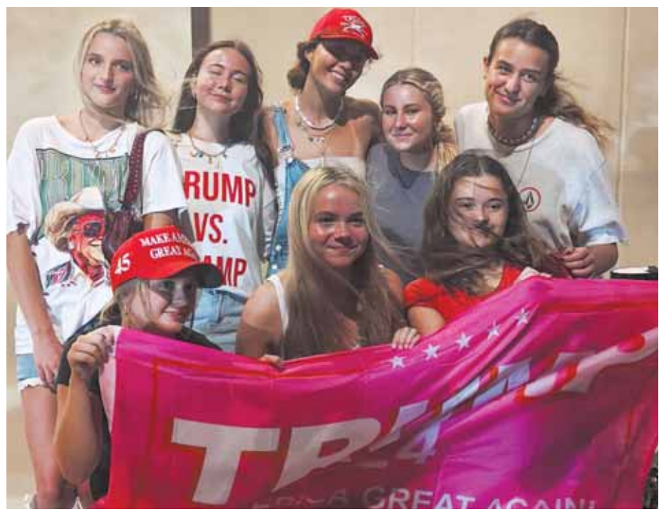
Supporters of Republican presidential nominee former President Donald Trump hold banners as they take part in Trump's Election Night Watch Party, at Palm Beach (Florida).

Representatives. Shri Thanedar was re-elected for the second consecutive term from the 13th Congressional District of Michigan. He won it for the first time in 2023. Raja Krishnamoorthi won the seventh Congressional District of Illinois for the fifth consecutive term. While the battles for control of the White House and Congress remain close, I am honoured that the people of Illinois' 8th District have extended my contract to represent them in Congress," Krishnamoorthi said. "My parents came to this country with little more than a dream for their family's future and the faith that they could achieve it here in America," Krishnamoorthi concluded. "Despite some hard times, we did." "My mission in Congress is to fight for all the other families that are pursuing their