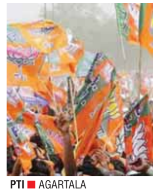
AGARTALA