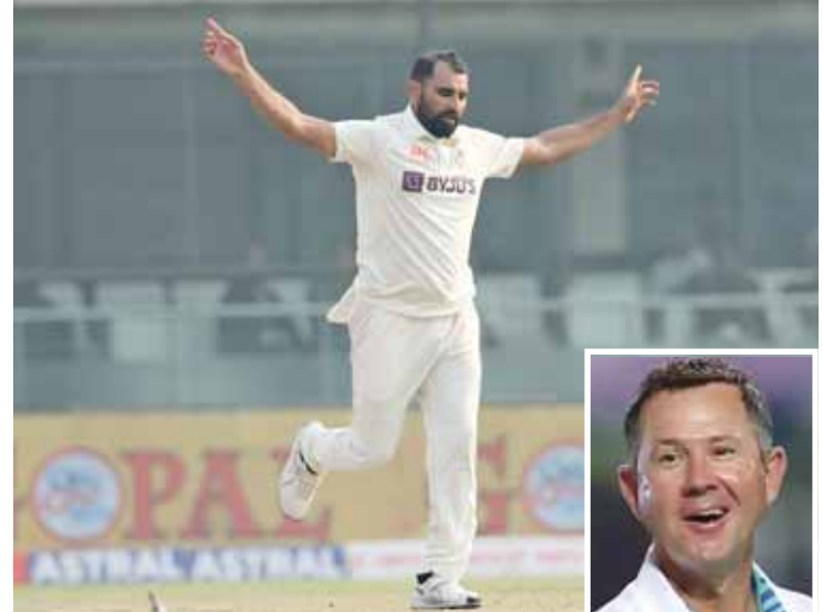
run-scorers over the five Tests. "Leading run scorer, I'm going to go Steve Smith or Rishabh Pant," Ponting said.

PTI ■ DUBAI Former captain Ricky Ponting reckons Australia will clinch the Border-Gavaskar Trophy 3-1 against India as the visitors will find taking 20 wickets in a Test as their "biggest challenge" in absence of Mohammed Shami. Australia are keen on ending their barren run in the Border-Gavaskar with India winning each of the four series since 2014-15, including the historic triumphs Down Under in 2018-19 and 2020-21. However, with India suffering the historic low of a first-ever whitewash by 0-3 against New Zealand, Ponting believes the hosts have a better chance of defeating India now. "Probably more so now (than before)," Ponting said about Australia's chances on the ICC Review Show. Shami has been out of action since last November due to injuries and Ponting believes his absence leaves a big hole in India's bowling attack comprising Jasprit Bumrah,