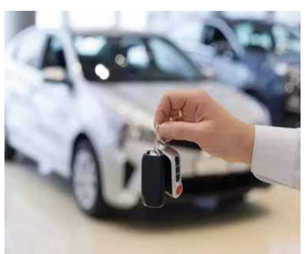
FADA said, Passenger vehicle sales grew 32.38 per cent to 4,83,159 units in 2024, from 3,64,991 units retailed in October 2023, it stated.

The total vehicle retail sales in India witnessed a 32 per cent Y-O-Y rise to 28,32,944 units with all segments including two-wheelers and passenger vehicles registering strong growth, Federation of Automobile Dealers' Association (FADA) said on Wednesday. The total vehicle retail sales in October 2023 stood at 21,43,929 units, as per FADA. The strong growth in October this year was largely driven by the rural market, especially boosting two-wheeler and passenger vehicles sales, supported by increased Minimum Support Price (MSP) for Rabi crops,