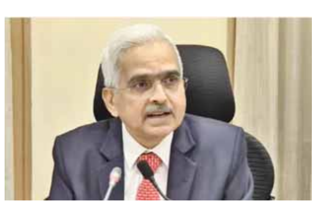
7.2 per cent real GDP growth for FY25, even as some expect it to be lower than 7 per cent. Das said the RBI tracks over 70 high-speed indicators to arrive at its estimates and described both the positive factors pushing the number and the negatives pulling it down. The industrial production or IIP data, and moderation in

Reserve Bank Governor Shaktikanta Das on Wednesday said the incoming data on economic growth is "mixed", but the positive factors outweigh the negative ones. Speaking at Business Standard's annual BFSI event here, Das stressed that the underlying economic activity by and large remains strong. "Data which is coming in is mixed but the positives outweigh the negatives and by and large underlying activities remain strong," Das said. It can be noted that many analysts have been voicing concerns about growth, especially after official data showed growth slowing to a 15-quarter low of 6.7 per cent in the first quarter of FY25. The RBI, however, has been holding onto its estimate of