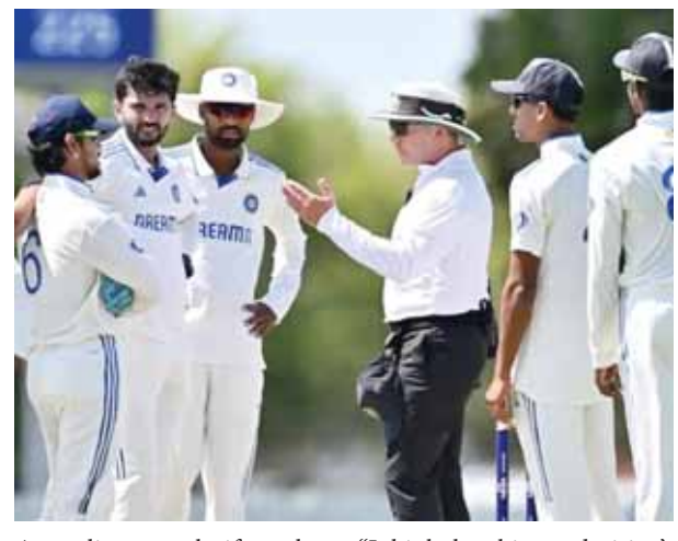
Australia to clarify what transpired on the final day of the match at Mackay. Warner, whose years-long leadership ban has just been lifted by CA, has said the board "squashed" the matter "as quickly as possible" since the Indian senior men's team is bound for a five-Test series Down Under.

PTI ■ SYDNEY India A players expressed dissatisfaction over the condition of the replaced ball provided during the final day's play against Australia A in their first unofficial Test, a report has claimed, even as David Warner and Ed Cowan have called on Cricket Australia to clarify what transpired. On the final day of the four-day game in Mackay last week, the umpires provided the Indian players with a different ball to use at the start of play. The Indian players, particularly Ishan Kishan, were unhappy with the decision with the wicketkeeper-batter terming it "a very stupid decision." A report in Sydney Morning Herald said on Wednesday that the argument from the Indian camp was not about the replacement of the ball but the condition of the ball which was provided as replacement.