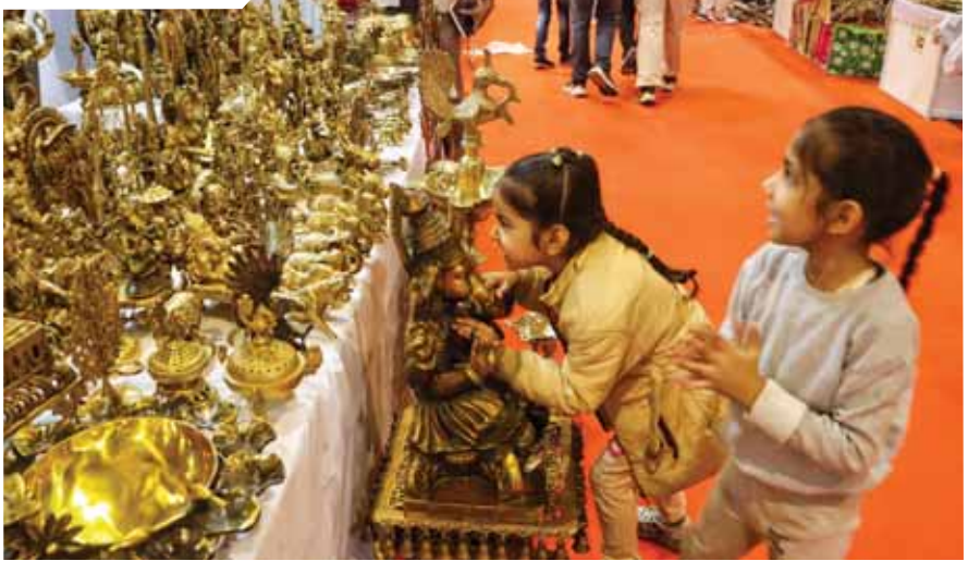
Children at a stall during the India International Trade Fair (ITF) 2024, in New Delhi