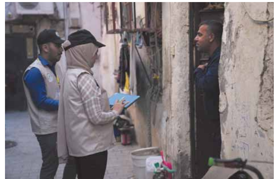
Workers prepare to collect information from the public as Iraq began its first nationwide population census in decades, in Baghdad on Wednesday.

Iraq began its first nationwide population census in decades on Wednesday, a step aimed at modernising data collection and planning in a country long impacted by conflict and political divisions. The act of counting the population is also contentious. The census is expected to have profound implications for Iraq's resource distribution, budget allocations and development planning. Minority groups fear that a documented decline in their numbers will bring decreased political influence and fewer economic benefits in the country's sectarian power-sharing system. The count in territories such as Kirkuk, Diyala and Mosul — where control is disputed between the central government in Baghdad and the semi-autonomous Kurdish regional government in the north — has drawn intense scrutiny. Ali Arian Saleh, the executive director of the census at the Ministry of Planning, said agreements on how to conduct the count in the disputed areas were reached in meetings involving Iraq's prime minister, president and senior officials from the Kurdish region. "Researchers from all major ethnic groups — Kurds, Arabs, Turkmen, and Christians — will conduct the census in these areas to ensure fairness," he said. The last national census in Iraq was held in 1987. Another one held in 1997 excluded the Kurdish region. The new census "charts a developmental map for the future