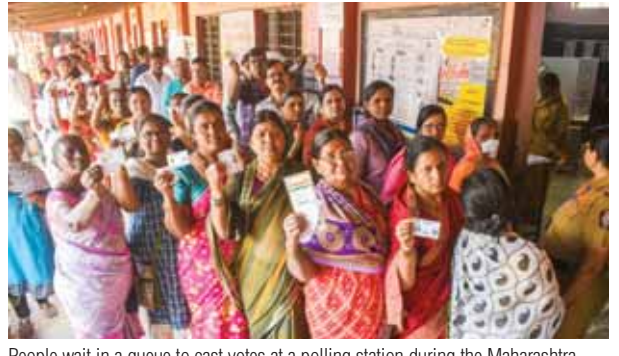
People wait in a queue to cast votes at a polling station during the Maharashtra Assembly elections, in Solapur district

Barring stray incidents of violence, clashes among the rival party workers and a few natural deaths, polling in the Assembly elections passed off peacefully in Maharashtra, as 58.22 per cent of the total 9.7 crore voters exercised their franchise till 5 pm across the state. Like always, the voter turnout was low in urban areas, particularly in cities like Mumbai, Pune and Thane. At 5 pm, Mumbai city recorded a dismal 49.07 per cent of polling, while 51.76 per cent voters turned out for polling in Mumbai suburbs. Thane recorded 49.76 per cent polling, while in Pune, 54.09 per cent voters exercised their rights. However, in Nagpur, 56.05 per cent of electors cast their votes. The Election Commission of India (ECI) said that it would update the voter turnout figures at 11.45 pm. The counting of votes will take place on November 23. In all, 4136 candidates are contesting for the 288 Assembly seats. "Despite a range of measures by the Commission for ease of voting, and motivational campaigns, urban voters in the state continued their dismal record of low participation in cities like Mumbai, Pune and Thane. Simultaneous polling for all 288 Assembly constituencies in Maharashtra in a single phase," an ECI spokesperson said.