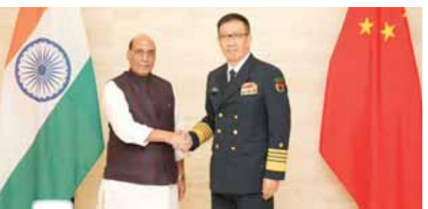
Defence Minister Rajnath Singh during a bilateral meeting with Chinese Defence Minister Dong Jun, in Vientiane, Laos

419, with AQICN Air real time measurement reporting over a 569 at Delhi Institute of Tool Engineering. In the morning, the air quality remained in the "severe" category, with an average AQI of 427 at 10 am, making it the most polluted city in India, according to CPCB data. All but one of the 38 monitoring stations in the national capital were in the red zone. The Lodhi Road station was not in the red zone, recording an AQI in the "very poor" category. Shallow fog was reported on Wednesday, with the lowest visibility of 500 metres recorded at Safdarjung, followed by 600 metres at Palam. PM2.5 levels ranged between 287.2 to 422.2 µg/m 3 , significantly above the national limit of 60 µg/m 3 . PM10 levels were also alarmingly high, peaking at 578.6 µg/m 3 . Meanwhile, the minimum temperature touched a season low of 11.2°C, a degree below normal. It was 12.3°C a day earlier. Continued on page 2