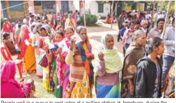
People wait in a queue to cast votes at a polling station during the final phase of Jharkhand Assembly elections, in Ranchi district

Polling was peaceful as nearly 68 per cent voter turnout was recorded till 5 pm in 38 constituencies in Jharkhand where voting for the second and final phase of the Assembly elections ended. The ruling Jharkhand Mukti Morcha-led INDIA Bloc is seeking to retain power riding on its welfare schemes, while the Bharatiya Janata Party-headed National Democratic Alliance (NDA) is trying to wrest it. The first phase of elections was held on November 13, and the counting of votes will take place on November 23. A total of 1.23 crore voters,