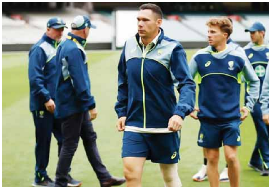
according to a report in the 'Sydney Morning Herald'. Head coach Andrew McDonald has also insisted that sending any player for the match in 'Canberra hasn't crossed their minds'. "No, that hasn't crossed our minds. We feel that with the long summer ahead, the prep we've got in place — albeit we've extended that by a day in Adelaide — we'll be well prepared, as we were leading into the first Test," McDonald said.

Australian selectors have decided against sending any out-of-form national team batters to play for the Prime Minister's XI against India in Canberra, following the hammering in the Perth Test. Hosts Australia were handed a 295-run bashing by India in the series opener of the Border-Gavaskar Trophy earlier this week and following the disappointing performance, the pressure is intensifying on the top order ahead of the second Test against India in Adelaide on December 6. The likes of Marnus Labuschagne (2, 3) and Steve Smith (0, 17) struggled against India and many, including former captain Maichael Clarke, feel the duo, along with reserve batter Josh Inglis, could benefit from the two-day pink-ball warm-up game. However, the Australian think tank has denied thinking on those lines. "This was partly because time at home was considered important for the players, and also because the Australian camp do not want to give the Indian brains trust another look at any of their Test batters before the five-match series resumes,"