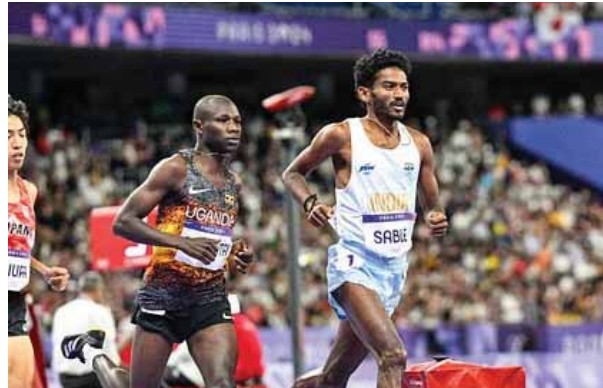
matters most in athletics is endurance," he said. He also requested Sable and other athletes to come to

more power while running," Kemboi told PTI Videos in an exclusive interview on the sidelines of Ekamra Sports Literature festival here. The legendary athlete is optimistic about Sable's future but emphasised that the Indian should focus on strategic training. "Just go for high-altitude training... Because we have the best altitude for training in the regions of Kenya and Ethiopia for his body system to adapt to endurance. Because speed is just something easy to achieve, what