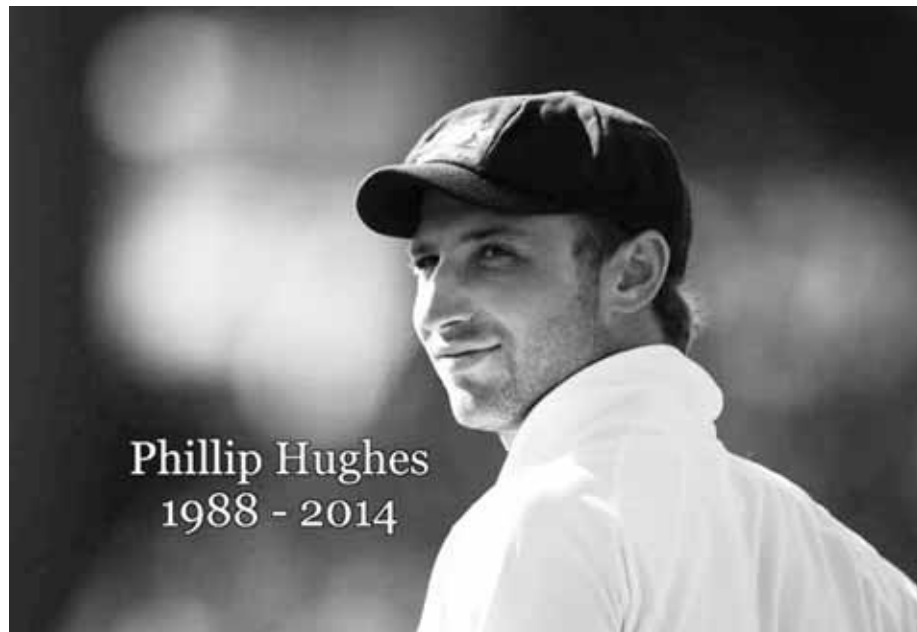
Phillip Hughes 1988 - 2014

The family further said, "He always aimed to make those