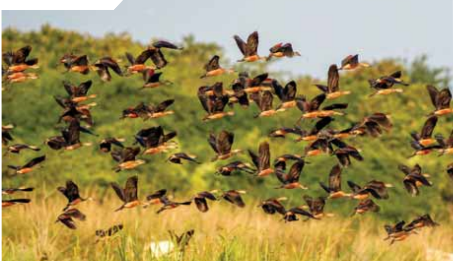
A flock of whistling ducks fly at the Pobitora Wildlife Sanctuary, in Morigaon