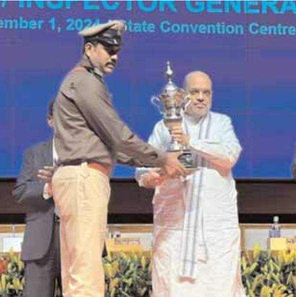
Nimiaghat Police Station, Giridih was honoured by the Union Home Minister Amit Shah during a programme in Bhubaneswar.

In a program organized at Convention Center, Lok Seva Bhavan, Bhubaneswar, Odisha, Union Home Minister Amit Shah gave one of the three best police stations of the Country, Nimiaghat Police Station located in Giridih district of Jharkhand, one of the best police stations in the Country. This award was given for meeting the standards like police's behavior with the general public, cleanliness of the police station, facilities for complainants, fitness facilities for police personnel, ramp facilities for the disabled, CCTV and fire safety arrangements etc. This award is given every year by the Home Ministry, Government of India to the best police stations of the Country on the basis of the above standards. On this basis, Nimiaghat Police Station under Giridih district