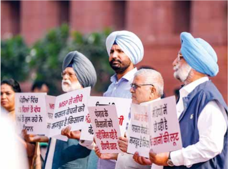
Congress MPs protest during the ongoing Winter session of Parliament.

Stadium was issued the certificate on November 13. But the Jaipur and Raipur stadia did not apply for NOCs, it said. "Despite repeated reminders through letters and emails, the Rajasthan Cricket Association (RCA) has not applied for NOC for the extraction of groundwater by Sawai Mansingh Cricket Stadium," the report said. It said the CGWA of the western region requested the district collector (DC) or district magistrate (DM) of Jaipur to take action against the stadium but "despite repeated reminders" no action was taken and on November 11, the authority directed the DC to seal the stadium's borewells and submit an action taken report by November 16.