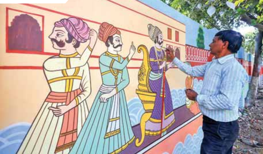
Artist paints a wall as beautification drive ahead of the Rising Rajasthan event, in Jaipur