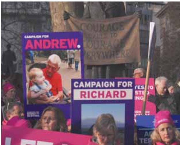
Pro legal assisted dying supporters demonstrate in front of Parliament in London on Friday as British lawmakers started a historic debate on a proposed to help terminally ill adults end their lives in England and Wales.

The debate is set to be impassioned, touching on issues of ethics, grief, the law, religion, crime and money. Many lawmakers plan to recount personal experiences while others