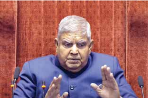
The Chairperson's statement in the House led to protests with slogans being raised against Prime Minister Narendra Modi and Adani.

"...These issues have been raised repeatedly during the week with the result that we have already lost three working days. The days that should have been committed by us for public cause," Dhankhar said. The chairman said the loss of time, opportunity and question hour has given enormous setbacks to the people at large. "Now, I find honourable members and I call upon you for deep reflection. Rule 267 is being weaponised as a mechanism of disruption and disruption from our normal working. There are very senior members," he said. The statement led to further protests, with some opposition members raising slogans against Prime Minister Narendra Modi and the Adani Group. Expressing deep anguish, Dhankhar said, "Our actions are not people-centric. They are to absolute public distaste, we are getting into irrelevance, people are ridiculing us, we