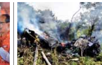
Pune: Wreckage of a helicopter after it crashed at Bavdhan area in Pune district, Wednesday, Oct. 2, 2024. Two persons are feared killed