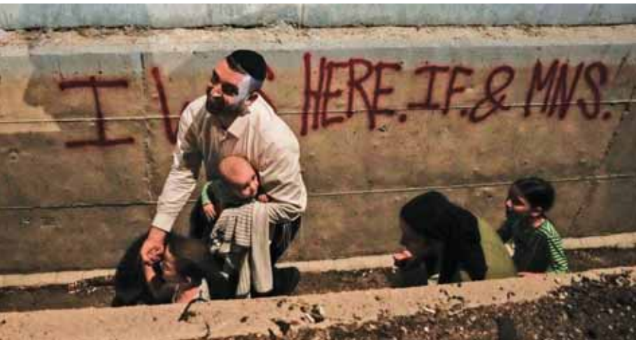
People take cover on the side of the road as a siren sounds a warning of incoming missiles fired from Iran on a freeway in Shoreshe, between Jerusalem and Tel Aviv in Israel

AGENCIES/PTI ■ JERUSALEM/ DEIR AL-BALAH (GAZA STRIP)