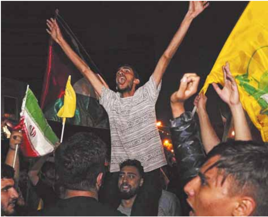
Demonstrators celebrate Iran’s missile strike against Israel during a gathering in front of the British Embassy in Tehran, Iran, Tuesday.

He also made phone calls to French President Emmanuel Macron and German Chancellor Olaf Scholz to discuss the serious risk of regional escalation and the “urgent need for de-escalation, with all parties needing to show restraint”. “I utterly condemn this attempt by the Iranian regime to harm innocent Israelis, to escalate this incredibly dangerous situation and push the region ever closer to the brink,” said Starmer in a televised address from 10 Downing Street in London on Tuesday night. “We stand with Israel, and we recognise her right to self-defence in the face of this aggression,” he said. He called on Iran to “stop these attacks”, saying it had “menaced the Middle East