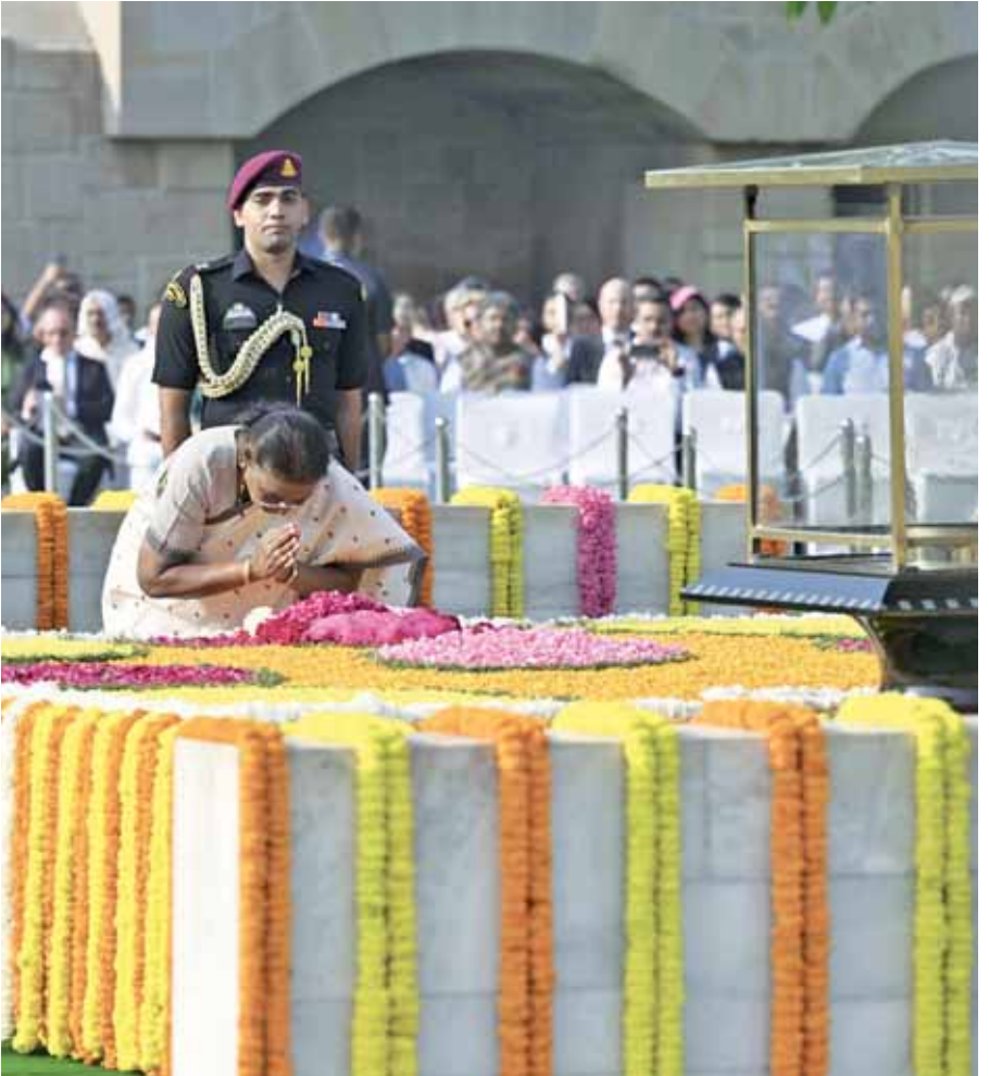
President Droupadi Murmu pays homage to Mahatma Gandhi on his birth anniversary, at Rajghat in New Delhi, Wednesday