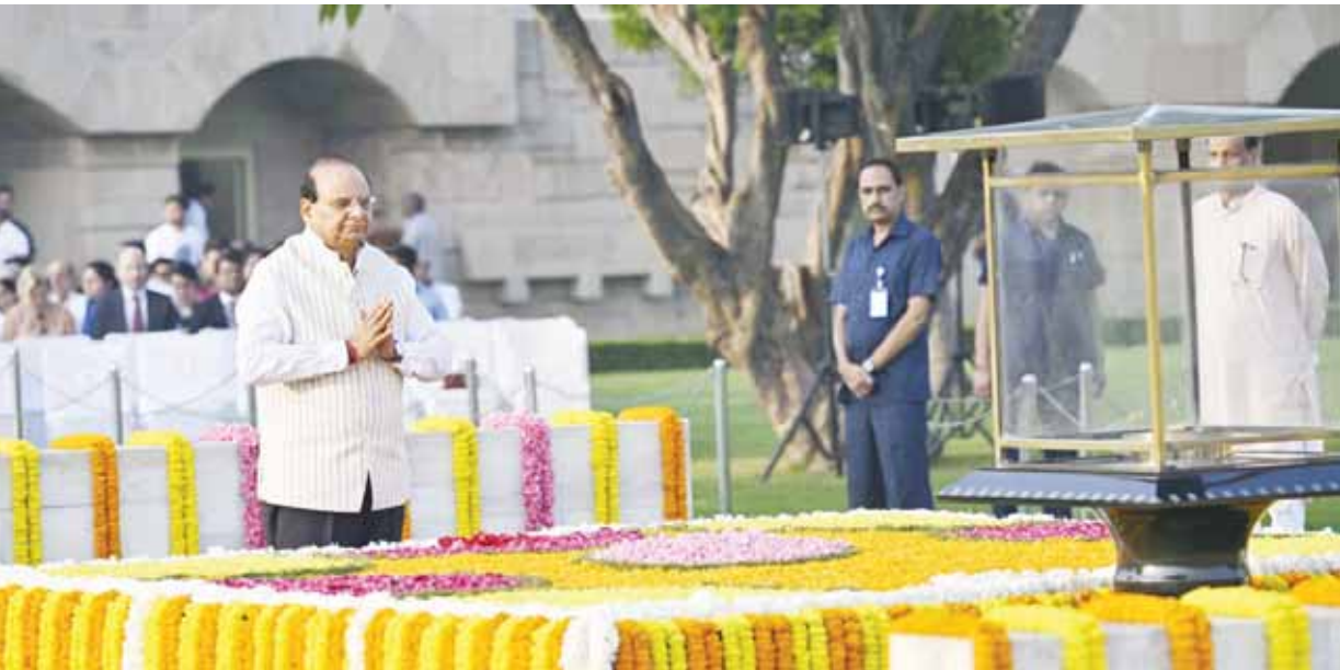
Delhi Lt Governor VK Saxena pays homage to Mahatma Gandhi on his birth anniversary at Rajghat