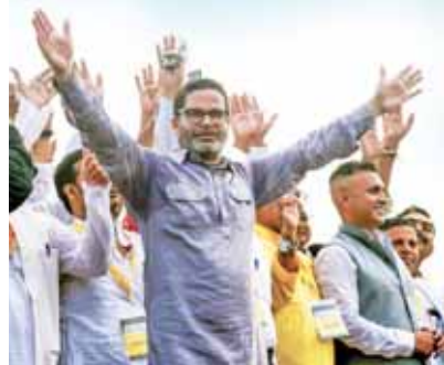
Jan Suraj founder Prashant Kishor during the formal launch of his new political party as Jan Suraj Party at Veterinary College grounds, in Patna