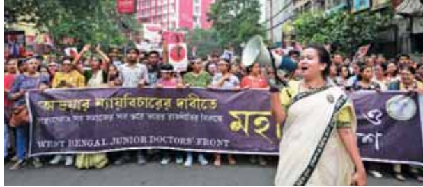
Members of Bengal Junior Doctors' Front and others take part in a mega rally on 'Mahalaya' to demand justice for the alleged sexual assault and murder of a trainee doctor at RG Kar Medical College and Hospital, in Kolkata, Wednesday