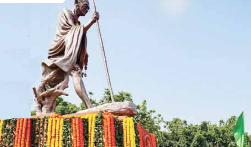
Mahatma Gandhi's statue, decorated with flower on his birth anniversary, in New Delhi