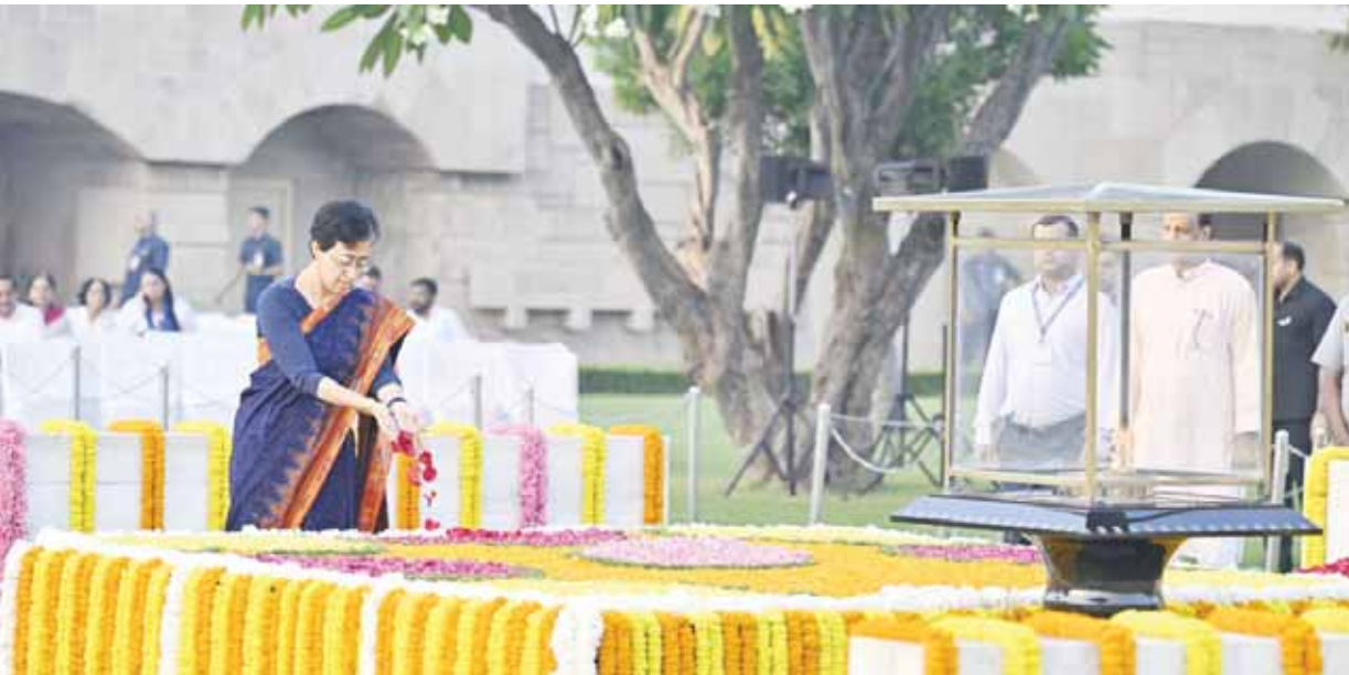
Delhi Chief Minister Atishi pays homage to Mahatma Gandhi on his birth anniversary at Rajghat