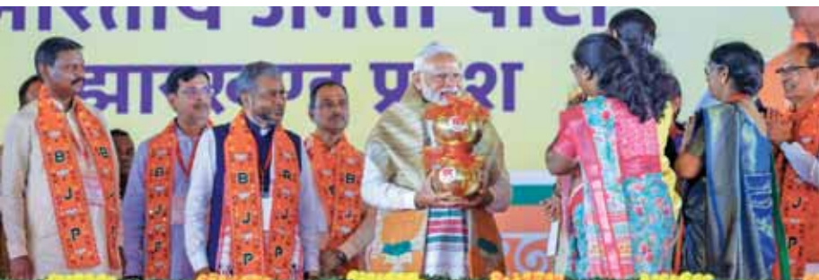
Prime Minister Narendra Modi with Jharkhand BJP President Babular Marandi and others during the party's Parivartan Mahasabha, in Hazaribagh, Jharkhand, Wednesday