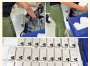
Combo photo shows 26 iPhone 16 Pro Max mobile phones seized by customs officials at IGI airport from a lady passenger travelling from Hongkong to Delhi, in New Delhi