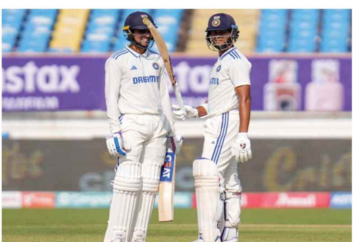
runs in eight Tests at just over 35. Kohli, 53 runs shy of 9000 Test runs, has not made even a fifty in six innings this year, and while Rohit often perishes in his attempt to grab the momentum, his colleague offers a much more curious case. The 35-year-old Kohli has not been able to convert the two starts he got this year, ending up with 46 (vs SA) and 47 (vs Bangladesh), stirring the uncomfortable memories of that great slump between 2019 and 2023. The master batter will also have to keep an eye on New Zealand left-arm spinners -

deliveries from pacers, but a trace of the old failing still remains. In Chennai, Bangladesh pacer Hasan Mahmud troubled him with nip-backers before eventually grabbing his wicket. Similarly, Jaiswal has a penchant to go for expansive shots against pace bowlers to get dismissed, evidenced by his three dismissals recently against Bangladesh quicks. In all, the left-hander has fallen to pacers 12 times in 20 innings, and he would want a better record before facing a clutch of top-class Australian pacers. While these concerns are not deeply rooted, they serve as cautionary points against a New Zealand attack that has capable hands in pacers Matt Henry, William O'Rourke and the experienced Tim Southee, if he gets to play here after a sharp decline in his form. There is another angle to the emergence of Jaiswal and Gill as the pillars of the Indian line-up, as Kohli and Rohit have not precisely set the field ablaze. Rohit, who has played 15 innings this year, has made two hundreds but managed only one fifty in the remaining 13, totaling 497