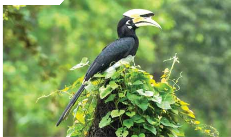
An oriental pied hornbill at Ponitora Wild Life Sanctuary, in Morigaon