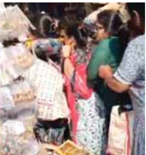
gestion. There was no immediate reaction on the incident from the Municipal Corporation of Delhi, which is responsible for removing encroachments from public property. Meanwhile, a market association in Sadar Bazar said it is planning to write a letter to the Delhi Police for proper management.