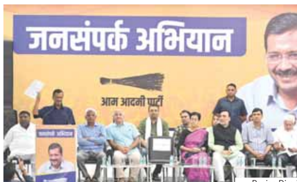
Delhi, I've written a letter addressing their questions. AAP workers will distribute this letter door-to-door until October 29, ensuring that everyone receives the answers they seek." "Everyone knows that I have never engaged in corruption. So why was I arrested? Because the work we are doing for Delhi, the facilities we are providing to you,

Ahead of Delhi elections, slated to be held early next year, AAP Convenor Arvind Kejriwal on Wednesday launched 'Jan Sampark Abhiyan' and penned a letter to the public in which he claimed that his arrest in the alleged excise policy linked money laundering scam is politically motivated and it is the BJP's larger plan to derail state's progress. "The letter is a part of a statewide public outreach campaign, which will continue until October 29, and aimed at AAP volunteers visiting households across the city, distributing the letter to ensure that all citizens receive answers to their concerns. Addressing party workers at the launch, Kejriwal said, "People have been asking why I was arrested and what led to it. I've been answering these questions in person, but to reach every