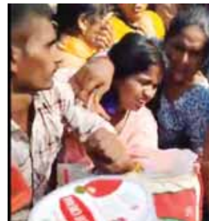
seasons, faces high footfall. We are planning to manage the crowd and soon meetings will be done with the district magistrate, market association and officials of the MCD for the crowd planning," said a senior officer. Another police officer said efforts are being taken to restrict the entry of heavy load vehicles in the area that causes jam and lead to con-

A stampede-like situation erupted in the busy Sadar Bazar recently in Delhi due to a heavy footfall of shoppers ahead of Diwali festivities, showed a purported video of the incident that surfaced on social media on Wednesday. In the video, a large group was seen jostling for space in the busy market as people tried to find a way through the dense crowd while balancing bags on their heads. Street vendors also obstructed the road leaving to a narrow path for people. It is unclear when the video was originally recorded. Police said they have deployed teams in the market to avoid any untoward incident and maintain law and order. "Sadar Bazar, during festival