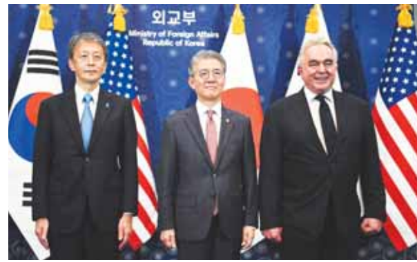
South Korea's First Vice Foreign Minister Kim Hong-kyun, center, poses for photos with United States Deputy Secretary of State Kurt Campbell (right) and Japan's Vice Foreign Minister Masataka Okano during their trilateral meeting at the Foreign Ministry in Seoul on Wednesday.