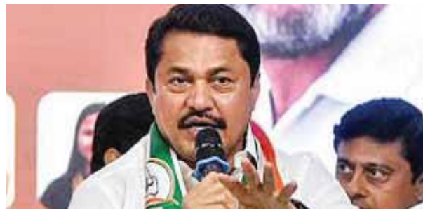
but it has also brought drugs from the neighbouring state, destroying the youth in our state," Patole said. "Important land parcels in Mumbai have been handed

card, when he should be talking about a 'rate card,' Patole said. Patole charged that Modi and Shah "diverted" large projects that were intended for Maharashtra, to Gujarat, while Shinde, deputy chief ministers Devendra Fadnis and Ajit Pawar remained silent. "As industries moved to other states, Maharashtra has seen a surge in unemployment, the state government has not only let businesses move to Gujarat