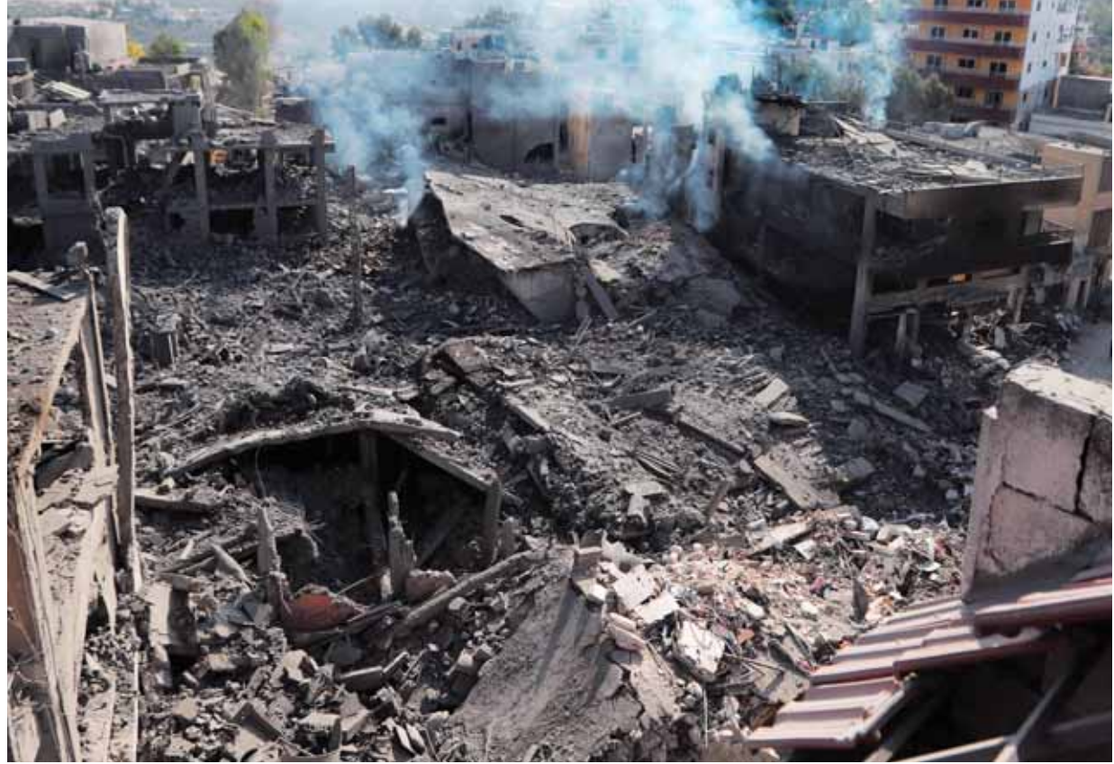
Smoke rise from destroyed buildings that were hit by Israeli airstrikes in Qana village, south Lebanon on Wednesday.

Israeli jets struck the southern suburbs of Beirut early Wednesday for the first time in six days, Lebanese state media reported. The casualty count was not yet clear. The attack comes just one day after caretaker Prime Minister Najib Mikati said the United States government gave him some assurances of Israel easing its strikes in the Lebanese capital. Israel says it is striking Hezbollah assets in the suburbs, where the militant group has a strong presence, but it is also a busy residential and commercial area. The Israeli military said the Wednesday strike hit a weapons warehouse under a residential building. The Israeli military posted an evacuation warning on the X platform saying it is targeting a building in the Haret Hreik neighborhood. An Associated Press photographer who witnessed the strikes said there were three in the area. The first strike was documented less than an hour after the notice. Hezbollah began firing rockets into Israel on Oct. 8 in solidarity with the Palestinian militant group Hamas, following their surprise attack on southern Israel. A year of low-level fighting escalated