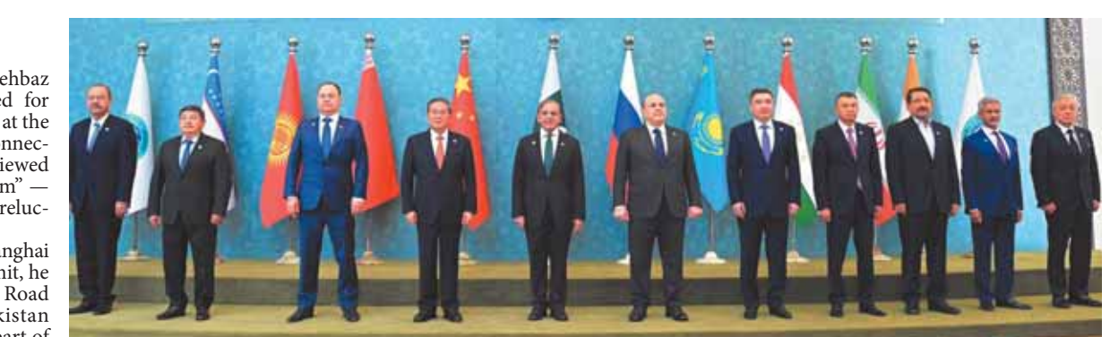
Pakistan's Prime Minister Shehbaz Sharif (centre), China's Premier Li Qiang, Belarus Prime Minister Roman Golovchenko, Russian Prime Minister Mikhail Mishustin, Kazakhstan's Prime Minister Olzhas Bektenov, Tajikistan's Prime Minister Kokhir Rasulzoda, and other leaders pose for group photo at the opening session of Shanghai Cooperation Organization (SCO) meeting in Islamabad, on Wednesday.

Pakistan Prime Minister Shehbaz Sharif on Wednesday rooted for Beijing's Belt and Road Initiative at the SCO summit here, saying such connectivity projects should not be viewed through a "narrow political prism" — an apparent reference to India's reluctance to endorse it. In his opening remarks at the Shanghai Cooperation Organisation summit, he said efforts like China's Belt and Road Initiative and the China-Pakistan Economic Corridor, which is a part of the larger project, should be expanded. India has shown little enthusiasm for the China's "unilateral" initiative. And it has repeatedly criticised the China-Pakistan corridor for violating its territorial integrity as it involves building infrastructure in Pakistan-occupied Kashmir. Indirectly challenging India's position, Sharif said, "Let us not look at such projects through the narrow political prism, and invest in our collective connectivity capacities which are crucial to advancing the shared vision of an economically integrated region." In his speech later, External Affairs Minister S Jaishankar said trade and connectivity initiatives must recognise territorial integrity and sovereignty and it is essential to have an "honest conversation" on lack of trust, a remark seen as an indirect reference to China. The SCO comprises China, India, Russia, Pakistan, Iran, Kazakhstan, Kyrgyzstan, Tajikistan, Uzbekistan and Belarus. Sixteen more countries are affiliated as observers or "dialogue partners".