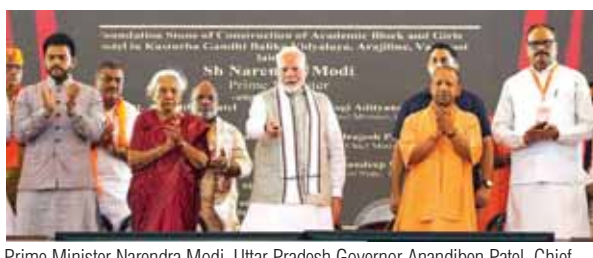
Prime Minister Narendra Modi, Uttar Pradesh Governor Anandiben Patel, Chief Minister Yogi Adityanath and others during the inauguration of various projects at the newly-constructed stadium at Sriga, in Varanasi, Sunday