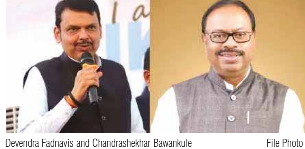
Devendra Fadnis and Chandrashekar Bawankule

The ruling Bharatiya Janata Party (BJP) on Sunday retained 71 of its sitting MLAs, as it released its first list of 99 candidates for the Maharashtra Assembly polls that contained the names of its bigwigs like Deputy Chief Minister Devendra Fadnis, state unit President Chandrashekar Bawankule and as many as 13 women candidates. With the Opposition Maha Vikas Aghadi (MVA) still to formalise its tie-up among its constituents and its own MahaYuti allies - the Shiv Sena (Eknath Shinde) and Nationalist Congress Party (Ajit Pawar) having not released their lists of candidates yet, the BJP became the first major political party in Maharashtra to get off the blocks for the November 20 Assembly polls. The BJP, which heads the grand ruling alliance MahaYuti, is likely to contest anywhere from 155 to 160 seats out of the total 288 seats in the 2024 Assembly polls, as against 164 seats it had contested in the 2019 Maharashtra Assembly polls. The BJP released its first list of