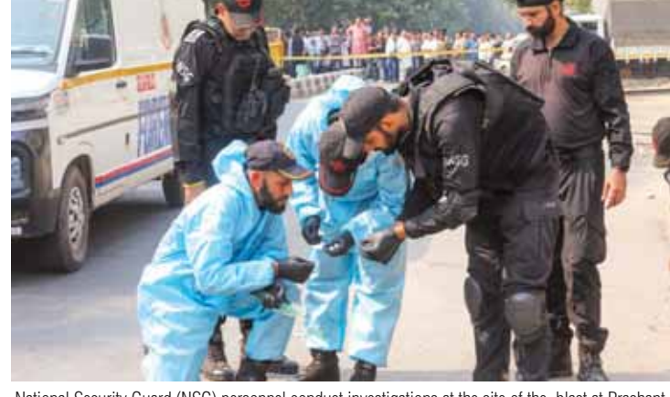
National Security Guard (NSG) personnel conduct investigations at the site of the blast at Prashant Vihar, near the CRPF school in Rohini area of New Delhi on Sunday