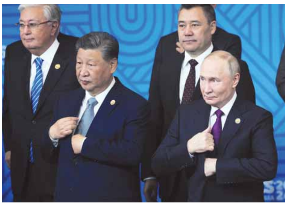
Chinese President Xi Jinping (left) and Russian President Vladimir Putin attend a family photo ceremony prior to Outreach/BRICS Plus format session at the BRICS Summit in Kazan, Russia on Thursday.

bloc, Putin accused the West of trying to stem the growing power of the Global South with "illegal unilateral sanctions, blatant protectionism, manipulation of currency and stock markets, and relentless foreign influence ostensibly promoting democracy, human rights, and the climate change agenda." "Such perverse methods and approaches -- to put it bluntly -- lead to the emergence of new conflicts and the aggravation of old disagreements," Putin said. "One example of this is Ukraine, which is being used to create critical threats to Russia's security, while ignoring our vital interests, our just concerns, and the infringement of the rights of Russian-speaking people." Russia has specifically pushed for the creation of a new payment system that would offer an alternative to the global bank messaging network SWIFT and allow Moscow to dodge Western sanctions and trade with partners. In a joint declaration Wednesday, participants voiced concern about "the disruptive effect of unlawful unilateral coercive measures, including illegal sanctions" and reiterated their commitment to enhancing financial cooperation within BRICS. They noted the benefits of "faster, low-cost, more effi-