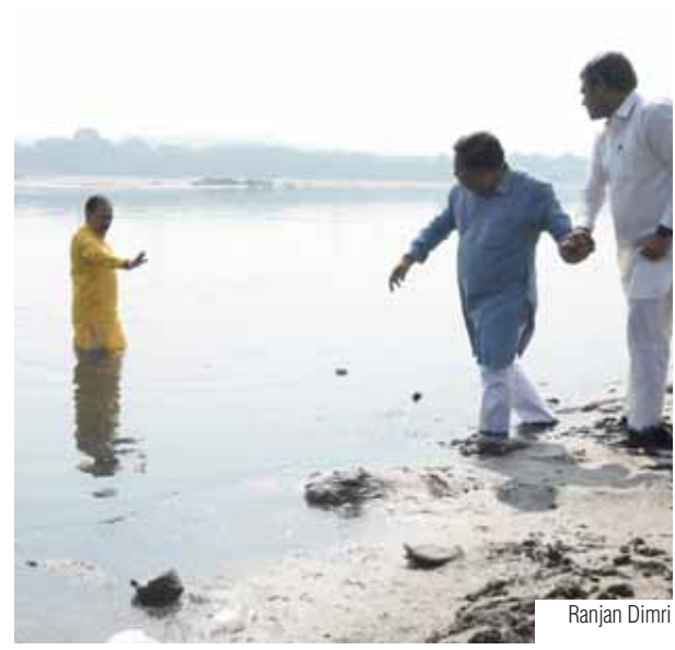
facilities for Chhath Puja, BJP leaders insult people from

The Bharatiya Janata Party (BJP) on Thursday set up a stage at the Yamuna's Chhath Ghat with two chairs for Delhi Chief Minister Atishi and her predecessor Arvind Kejriwal to remind them of the AAP's promise to clean the river. Delhi BJP president Virendra Sachdeva took a dip in the Yamuna and "sought forgiveness" for the "corruption" of the Delhi government, which he alleged looted funds meant for cleaning the river, a party statement said. Meanwhile, the Aam Aadmi Party has sharply criticised the BJP's politics around Chhath Ghat in Delhi. AAP leader and Rajya Sabha MP Sanjay Singh stated that while Arvind Kejriwal supports Purvanchal