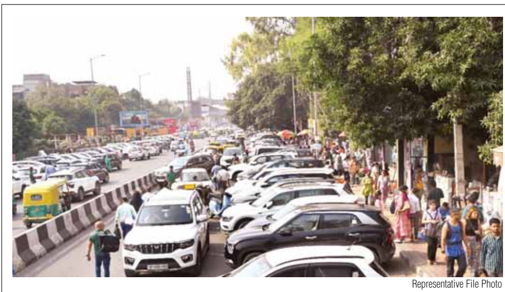
Representative File Photo

In the reasons for congestion, cited by the traffic police department in their report to the MoHUA, encroachment on the roadside was listed as the top cause of traffic jams in the Northern range of Delhi. This area includes Kingsway Camp to Hakikat Nagar, H-Point in Azadpur to Rana Pratap Bagh, Mukarba Chowk to Jahangirpuri Metro Station, Azadpur Chowk flyover, Mukarba Chowk flyover, Sanjay Gandhi Nagar to Metro Station Samaypur Badli, Swami Suroopnand Marg from Ramdev Chowk to Y-Point Narela and Bawana Chowk to Kanjhawala T-Point. "In the Central range, the encroachment by local vendors and hawkers in roads those including from New Delhi Railway Station to Ajmeri Gate Chowk, Netaji Subhash Marg