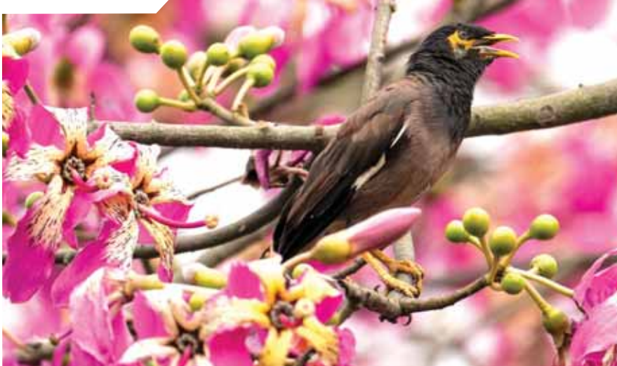
A myna bird perches on a branch of a floss silk tree, in New Delhi