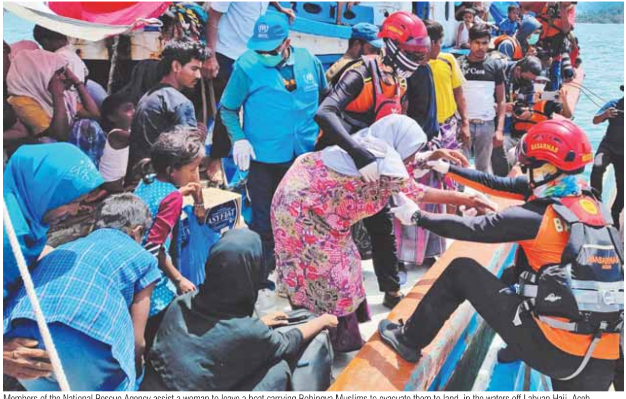
Members of the National Rescue Agency assist a woman to leave a boat carrying Rohingya Muslims to evacuate them to land, in the waters off Labuan Haji, Aceh province, Indonesia on Thursday.

requested the premier and president to take action against him and effective steps to prevent such divisive and harmful incidents, particularly those occurring under state sponsorship, from happening in the future. "Dr Zakir Naik's public addresses have caused significant distress within the Christian community as he openly questioned the authenticity of our faith, discredited our sacred texts, and made statements that undermine the beliefs of Christian pastors and scholars," the letter says. Naik's remarks not only have caused religious offence but also undermined the national pride of all regardless of their faith, it adds. "Naik's comments have further intensified the sense of marginalisation felt by the Christian community, despite the government's repeated assurances of upholding religious harmony and mutual respect for all." The letter further says Naik spoke in open forums against Christians' faith where Pastors and Christian scholars were denied the opportunity to adequately respond or correct the misinformation spread by his ill-informed and biased views. It says that Naik has disrespected the founding father Mohammad Ali Jinnah's vision in public gatherings in Pakistan as a state guest, which is unfortunate.