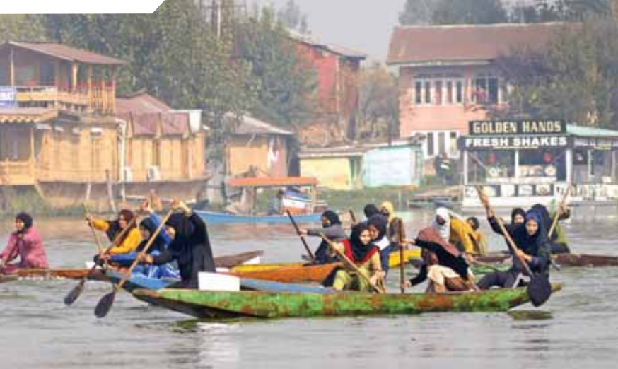
Women compete in a boat race at the Dal Lake, in Srinagar