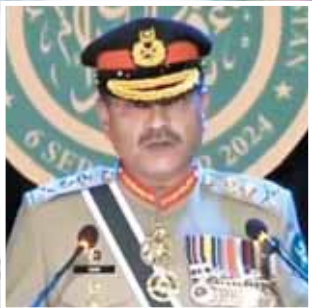
Pakistan Army Chief General Asim Munir admits Pak army's role in Kargil war, says several Pak soldiers died in the 1999 Kargil War against India