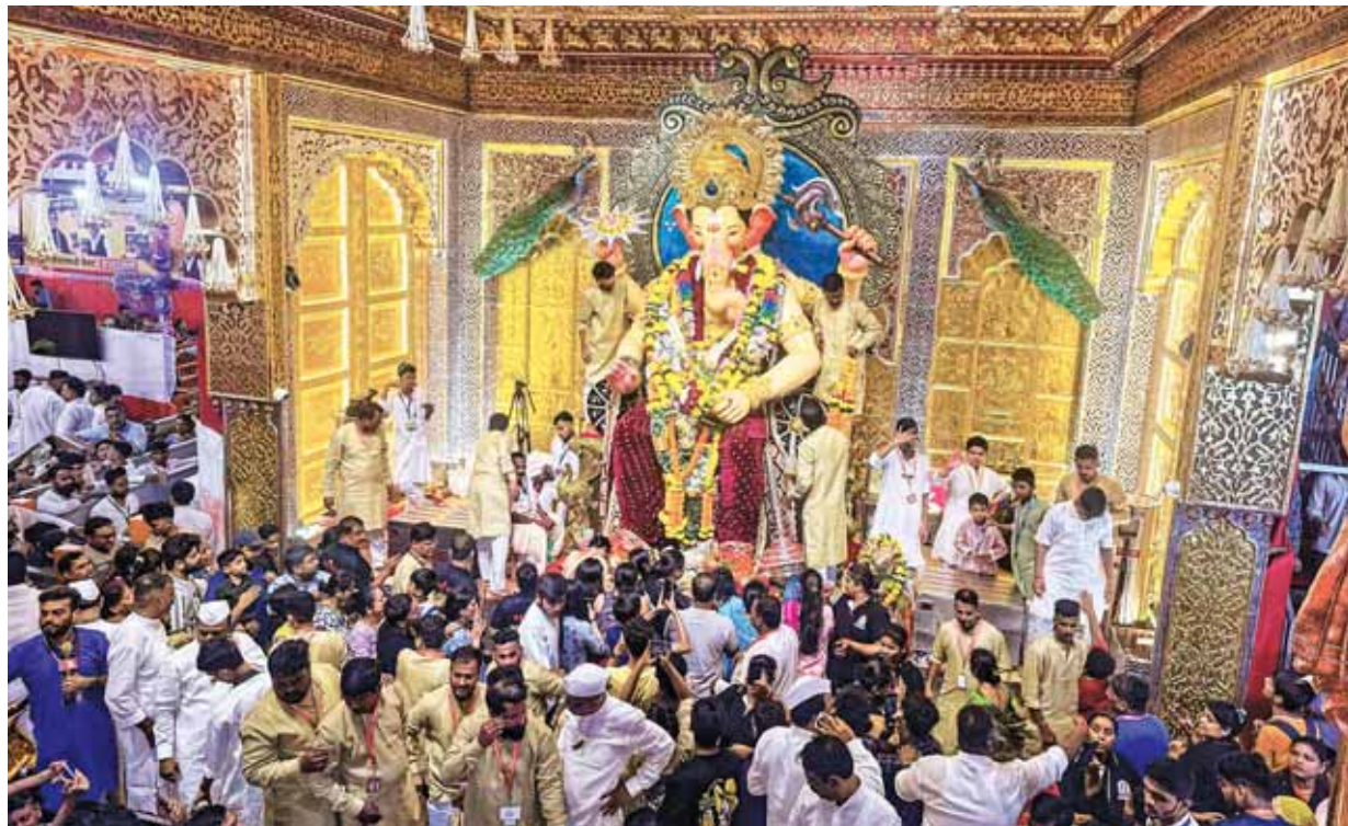
Mumbai: Devotees offer prayers to Lord Ganesh at the Lalbaugcha Raja on Ganesh Chaturthi festival, in Mumbai, Saturday