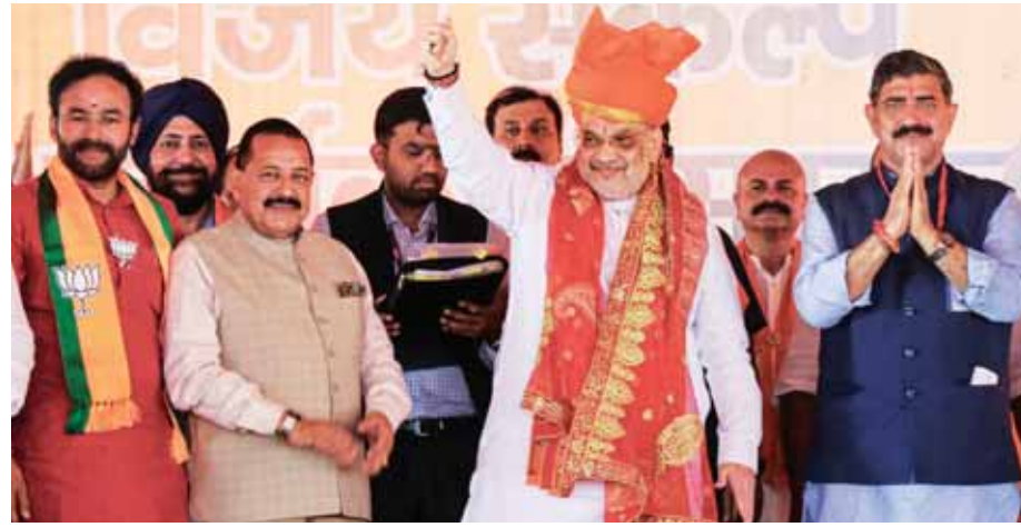
Union Home Minister Amit Shah during a party worker meet ahead of Jammu and Kashmir Assembly elections, in Jammu, Saturday, Sept. 7, 2024. MoS Jitendra Singh was also seen