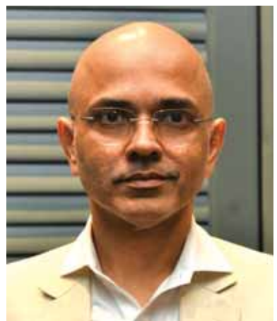
PRADEEP SHETTY President, Federation of Hotel and Restaurant Associations of India (FHRAI)

How do you view the current and future employment trends in the hospitality sector? Despite challenges posed by the COVID-19 pandemic, the hospitality sector is expected to rebound strongly. The India Food Services Report-2024 projects that by 2025, the sector will employ approximately ten million people. The industry's resilience, coupled with advancements in accommodation and government initiatives to promote tourism, supports its significant role in job creation.