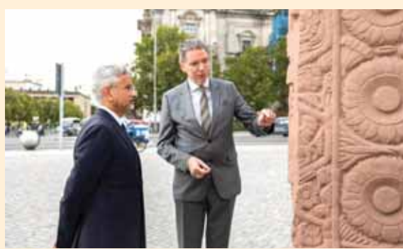
External Affairs Minister S. Jaishankar visits the replica of the East Gate of the Sanchi Stupa outside the Humboldt Forum, in Berlin