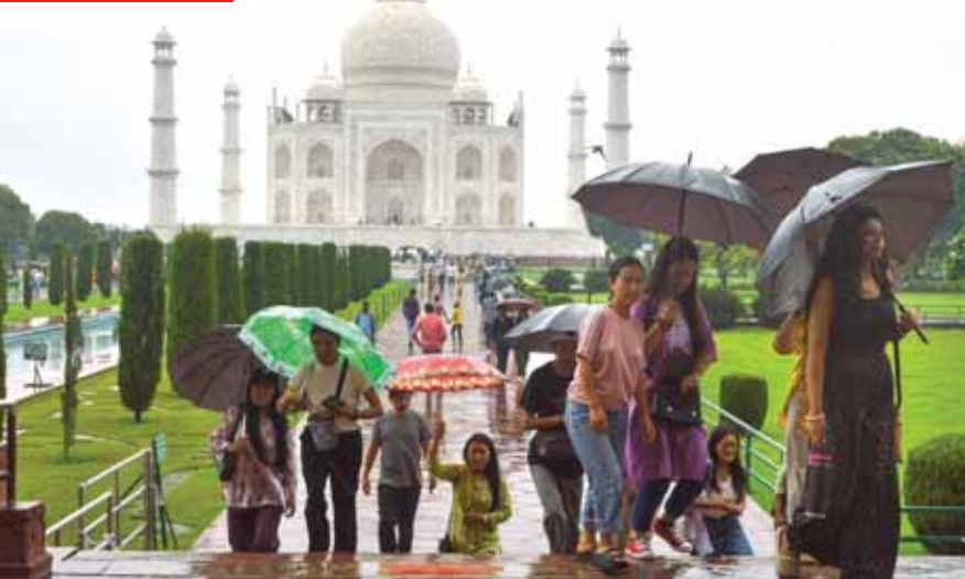
Visitors at the Taj Mahal during rain, in Agra.