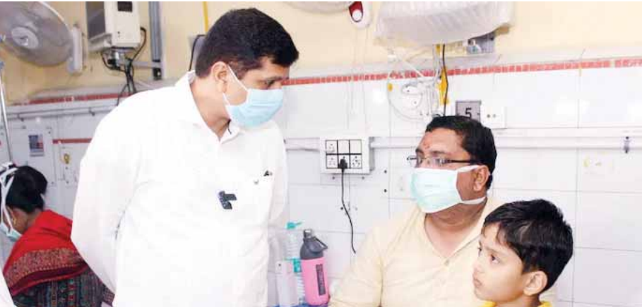
STAFF REPORTER ■ NEW DELHI

Delhi Health Minister Saurabh Bharadwaj on Thursday instructed officials to arrange better chairs, tables and water dispensers in the doctor's room built in the hospital for resident doctors. During the meeting with resident doctors of Maulana Azad Medical College, who are undergoing training at Lok Nayak Jaiprakash (LNJP) hospital, Bharadwaj inspected the classrooms in the hospital where written training is given to the doctors. He told the hospital administration officials present on the spot that better chairs and tables should be arranged for the doctors and all the necessary equipment for written training and practical training should be made available to all the resident doctors as soon as possible. "So that all of them can get the best possible training and our country and Delhi can get better doctors who can treat the public in the best possible way," he said. Talking to the senior AAP leader, resident doctors raised the issue of CCTV cameras missing from some places while some cameras are lying defunct, which need to be