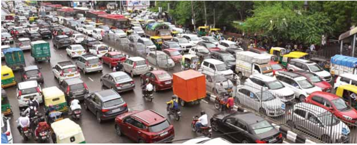
Khanpur metro work led to traffic jam from Panchsheel to the Sheikh Sarai road amid monsoons in New Delhi on Thursday

Some of the Resident Welfare Associations (RWAs) had to issue caution to the locals to be alert while moving out from the colonies. With the traffic situation becoming a regular menace, the Sainik Farms Welfare Association in south Delhi took to its social media groups to issue alerts and updates particularly the disruption due to metro work and rains in the area that has