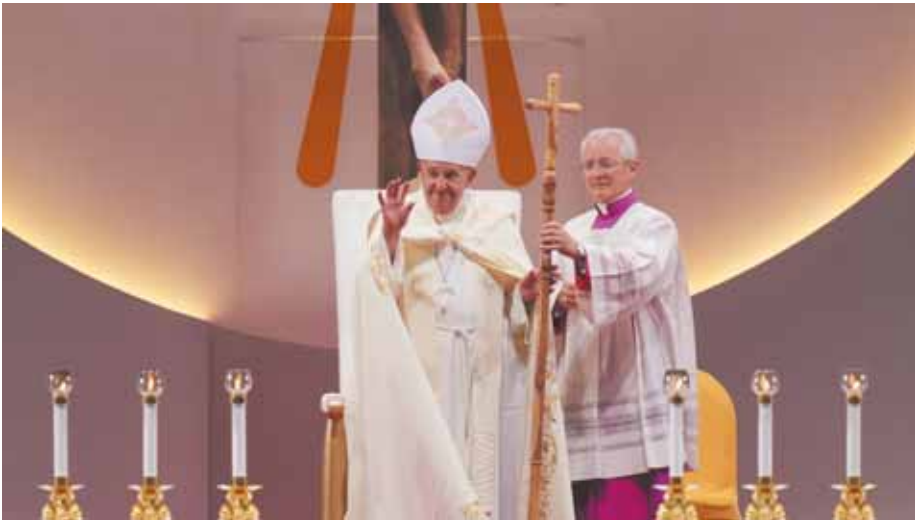
Pope Francis gestures to attendees after presiding over a holy mass at the SportsHub National Stadium in Singapore on Thursday

great deal to society and should be guaranteed a fair wage,” Francis said. Singapore has no minimum wage policy for locals or foreigners. Singapore is the last stop of Francis’ 11-day tour that is the longest and farthest of his papacy after earlier stops in Indonesia, Papua New Guinea and East Timor. The economic disparities were obvious upon arrival Wednesday as Francis landed in Singapore’s high-tech airport aboard the lone aircraft belonging to Aero Dili, the national carrier of East Timor, where around 42% of its people live below the poverty line.