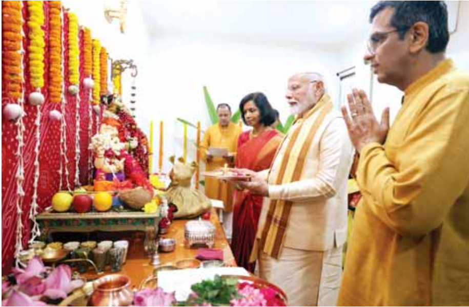
Prime Minister Narendra Modi attends 'Ganapati Poojan' at the residence of Chief Justice of India DY Chandrachud, in New Delhi