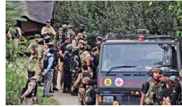
Security personnel during an encounter with militants at Chak Tapper Kreeeri Pattan area, in Baramulla district, Jammu and Kashmir, Saturday

Ahead of the maiden visit of Prime Minister Narendra Modi to address an election rally in the land-locked Doda district on Saturday, two soldiers of the Indian army sacrificed their lives while two others received injuries during a counter-terrorism operation in the Chatroo area of Kishtwar on Friday. In another overnight operation launched in the Kreeeri area of North Kashmir's Baramulla district, three terrorists were gunned down by the joint team of security forces on Saturday. The security forces were able to neutralise a group of hiding terrorists after identifying their exact locations inside the building with the help of drone cameras. With this, the number of terrorists eliminated in the last three anti terrorist operations have gone up to seven. Chinar Corps of the Indian army in a post on X confirmed, "Three terrorists have been neutralised by the security forces in the ongoing Operation. Weapons and warlike stores have been recovered. The Chinarcops has dealt some crippling blows to the terror network in North Kashmir over the past few days with significant recoveries and elimination of terrorists, inspiring confidence and assurance for upcoming events scheduled in the region." Before the day ended, another