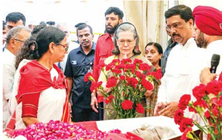
Jairam Ramesh, Rajeev Shukla and others. NCP (SP) president Sharad Pawar, Samajwadi Party president Akhilesh Yadav, Congress leaders Mani Shankar Aiyar, Sachin Pilot, Ramesh Chennithala, DMK leaders Udhayanidhi Stalin, TR Baalu, Dayanidhi Maran, RJD MP Manoj Jha, Aam Aadmi Party (AAP) leaders Manish

Rich tributes were on Saturday paid to veteran Marxist leader and CPI (M) general secretary Sitaram Yechury at the party headquarters AKG Bhavan here, where his mortal remains were brought with chants of 'Lal Salaam' from his residence this morning. Wrapped in the red flag of the CPI (M), Yechury's mortal remains were kept at the party office, where party leaders, including polit bureau members Prakash Karat, Brinda Karat, Pinarayi Vijayan and M A Baby, and others paid their tributes to the leader. Congress Parliamentary Party chairperson Sonia Gandhi also reached the AKG Bhavan along with the other party leaders to pay her last respects to Yechury. She was accompanied by party leaders