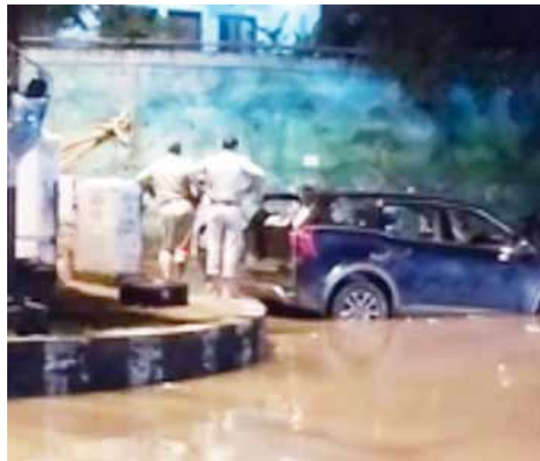
Gate, Munirka, Rajouri Garden, Shadipur depot, Behara Enclave, Mangol Puri B block, Mukarba Chowk, ISBT Kashmeri Gate, Safdarjung road (Ring Road), Hanuman Mandir marg near Nigam Bodh ghat, Rani Jhansi Marg, Laxmi Nagar, Vikas Marg, Anand Vihar ISBT, Seelampur Chowk, Kalindi Kunj, Nand Nagri,