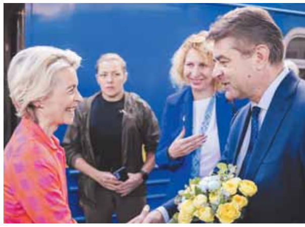
President of the European Commission, Ursula von der Leyen, left, is greeted as she arrives at the railway station in Kyiv, Ukraine, Friday.

third war winter that the nation will face. Von der Leyen said Russia knew full well that bombing energy stations was hitting Ukraine where it really hurts. Morale to keep on fighting can be significantly sapped if millions shiver in the brutal winter for months on end. "We may see huge implications," said Fatih Birol, the head of the International Energy Agency. "People will look to move around, to go to the places where they can have shelter and heating." That makes international help all the more necessary, said von der Leyen. "As Ukraine's friends and partners, we must do all we can to keep the lights on. And as winter is approaching, well, we must keep the brave people of Ukraine warm, while we also are keeping the economy run-