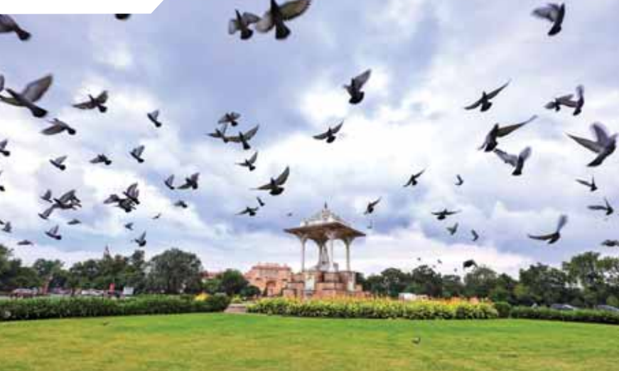
Dark clouds hover over Statue Circle, in Jaipur