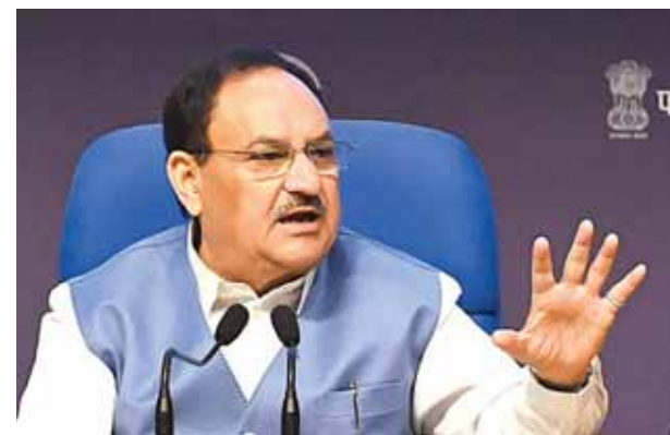
Union Minister JP Nadda addresses a press conference on 100 days and achievements of MoHFW, in New Delhi, Friday