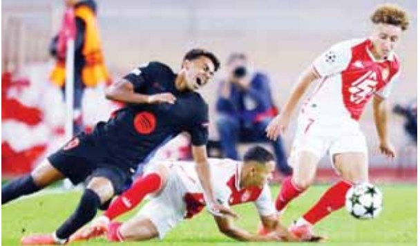
It was his fourth goal of the season but the first of the European Championship-winning Spain forward's career in the Champions League. According to UEFA, Yamal became the second-youngest

AP ■ MONACO Barcelona's perfect start to the season ended with a 2-1 loss at Monaco in the revamped Champions League on Thursday, a defeat which happened after defender Eric Garcia was sent off after 11 minutes. Garcia pulled back Takumi Minamoto when the Japan forward intercepted a panicky pass out from Barcelona goalkeeper Marc-André ter Stegen. Barca won its first five league games in the Spanish league under new coach Hansi Flick but saw Monaco take the lead