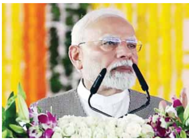
Gandhi's purported visit to the US, the Prime Minister said: "Today, the

the controversy over his visit to Chief Justice of India's residence for a Ganapati Puja, by charging that the "Congress hates Ganapati Puja". "The Congress is no longer the Congress with which Mahatma Gandhi was associated. Today, the soul of patriotism has died a death in the Congress. Today, the Congress is harbouring the ghost of hatred. Look at the language used by the people of Congress. The Congress people go to foreign lands and propagate anti-national and divisive views. They also insult the country's culture and faith," Modi said. "Indirectly alluding to Rahul