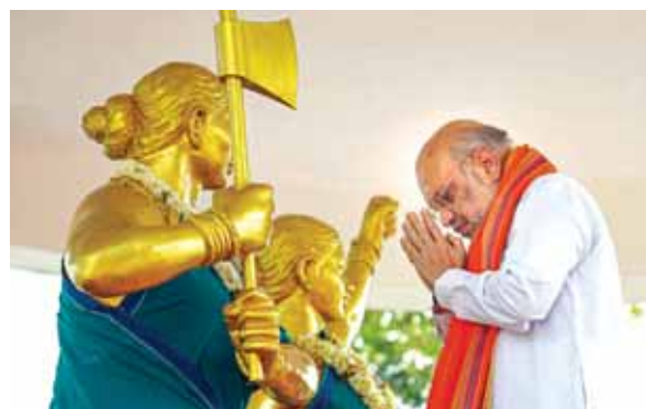
Home Minister Amit Shah pays tribute to the statues of Santal rebellion leaders Sidhu-Kanhu Murmu before flagging off the BJP's 'Pariwarta Yatra', in Sahibganj district, Friday

Union Home Minister Amit Shah on Friday appealed to Naxals to give up violence, lay down arms and surrender, saying an all-out operation will otherwise be carried out against them. Addressing 55 victims of Naxal violence of Chhattisgarh virtually from here, Shah also asserted that Maoists will take their last breath by March 31, 2026, and will be eliminated by then. He said Prime Minister Narendra Modi has decided that Naxal violence and ideology will be wiped out from the country. "I appeal to Naxals to give up violence, lay down arms and surrender as the militants in the northeast have done. If you do not listen, then an all-out operation will be carried out soon to end the menace," Shah said, adding that Naxalism is a threat to both humanity and the internal security of the country. Shah said security forces have achieved significant success in their operations against Maoists as the problem is now confined to just a few districts of Chhattisgarh. "The Central Government is committed to completely eliminate Naxalism by March 2026. Due to the policies of the Modi Government, Left Wing Extremism has now been restricted to a few districts in