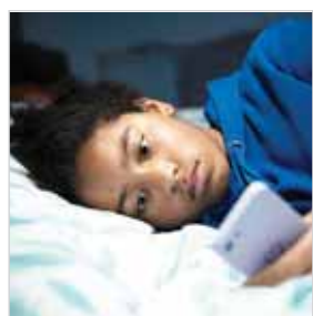
It's a loophole too easy to exploit, and without a robust verification system, raising the age limit can't be a solution.

Australia's recent proposal to introduce a minimum age for children to use social media has sparked a global debate about how best to protect young people from its negative effects. With the government suggesting an age limit between 14 and 16, the intention is clear: shield children from the social harms linked to excessive screen time, mental health issues, and unrealistic social comparisons. But is an outright ban the answer? Can we expect this move to be effective, or are we merely sweeping the problem under the carpet?