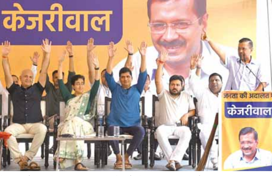
AAP National Convener Arvind Kejriwal addresses as Delhi CM Atishi party leader Manish Sisodia and others at Janta Ki Adalat at Jantar Mantar in New Delhi, Sunday