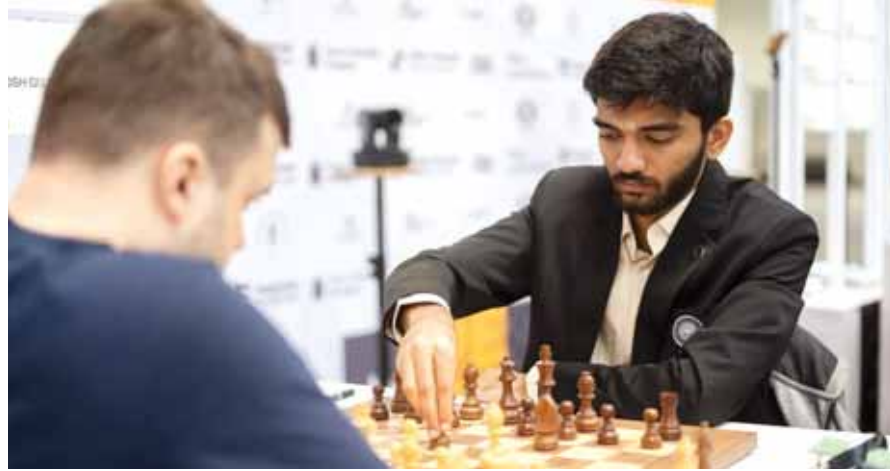
Gukesh D of India, during the final round of the 45th Chess Olympiad in Budapest, Hungary, Sunday

day of the event. The Indian team for the open category included Gukesh, Erigaisi, Praggnanandhaa R, Vidit Gujrathi, Pentala Harikrishna and Srinath Narayanan (Captain). The team who had a unbeaten streak in the tournament with incredible performances against Fabiano Caruana of United States (2.5-1.5) on Saturday day before the final round of the event which gave confirmation of gold medal. India despite having 19 points on the tally (table topper) only China is right after the India in points tally with 17 points which gave the medal confirmation, if somehow