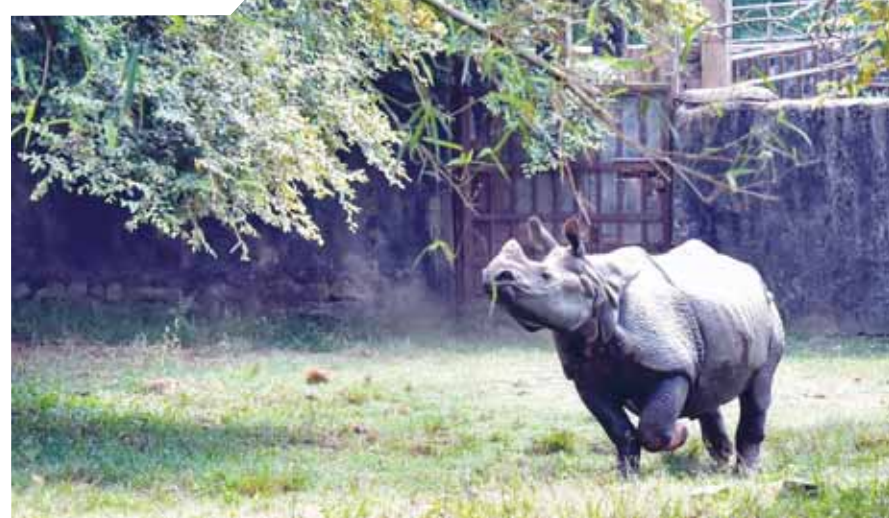
A one-horn Rhino at the Assam State Zoo on the World Rhino Day, in Guwahati