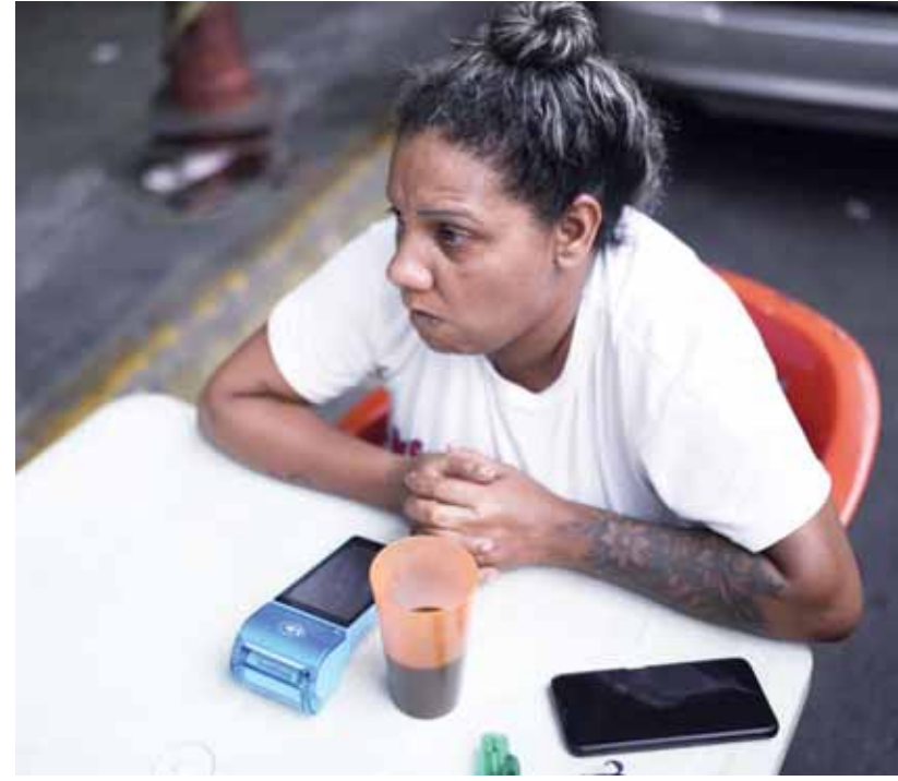
A street food vendor waiting for patrons in Caracas, Venezuela

it is an international restaurant, El Gaucho, originally from Argentina, which is closed, too." Like people in other Latin American countries — and long before their nation came undone in 2013 — Venezuelans have used the US Dollar as a safe haven asset and see the exchange rate as a measure of the economy's health. Maduro's government began using cash reserves in 2021 to artificially lower the exchange rate, making people at one point