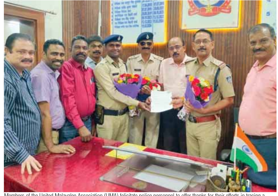
Members of the United Malayalee Association (UMA) felicitate police personnel for their efforts in tracing a mentally unstable boy who went missing from Kerala, found in Misrod locality, in Bhopal on Tuesday.