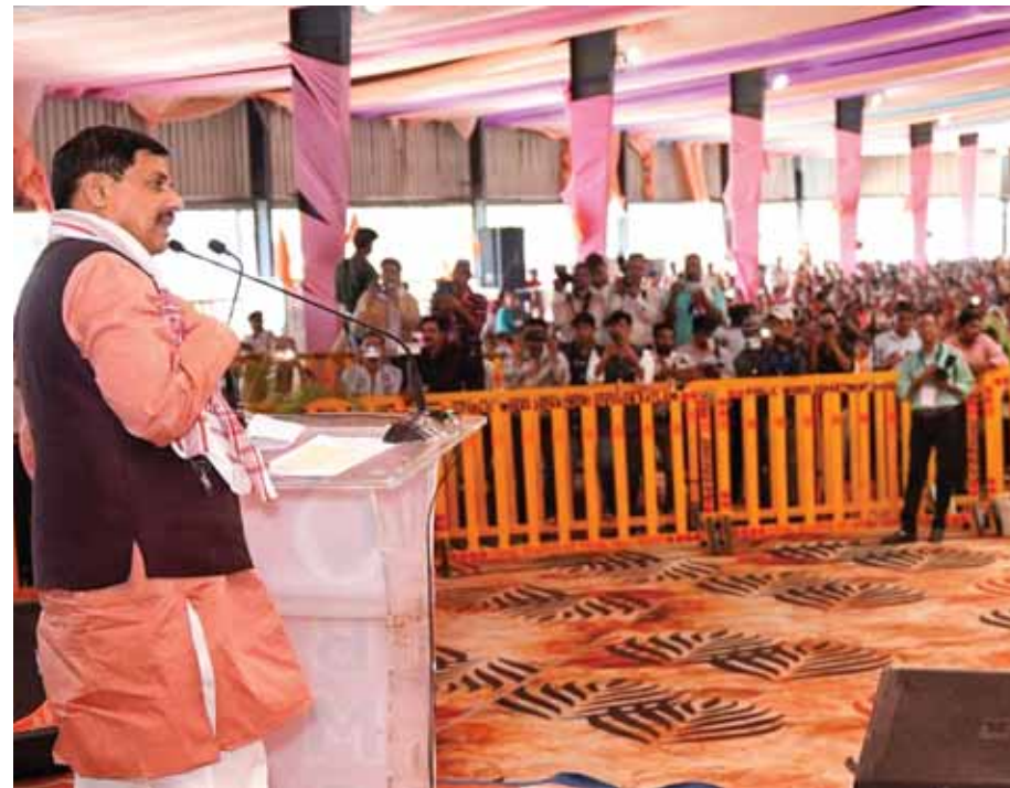
Madhya Pradesh Chief Minister Mohan Yadav addresses the seventh session of the All India Vanvasi Rural Labor Federation in Ratlam, Madhya Pradesh on Tuesday.