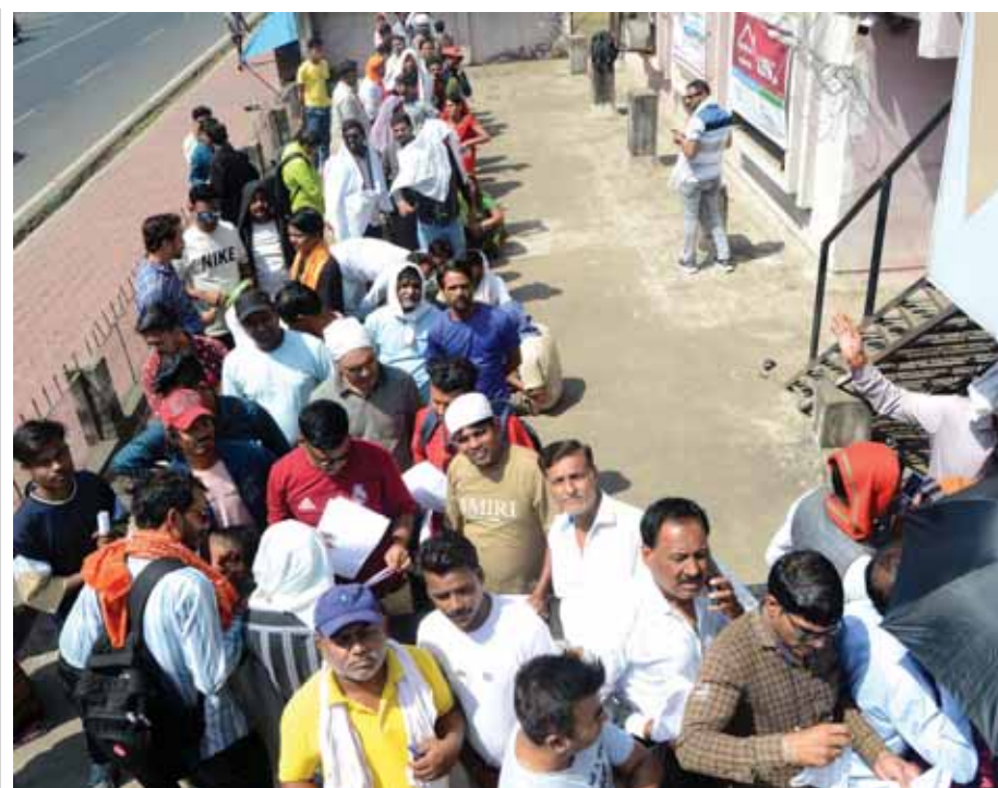
Hindu devotees wait in a long queue to seek the registration forms ahead of the annual Amarnath Yatra, outside the Jammu and Kashmir Bank in Bhopal on Tuesday.

Expected Outcomes of the Mission Include Gross value addition from horticulture to surpass that of field crops, Increase area under horticulture to match national averages, Raise agricultural mechanization by 1.5 times, Increase capital investment by 75% in agriculture, Make the state stubble-burning free, Bring 10% of total sown area under organic/natural/GAP agriculture, Expand micro-irrigation to 20% of cultivated land, Cover 50% of farmland under crop insurance, Use hybrid and improved seeds on 50% of the area, Provide subsidized solar pumps to make farmers 'Urja Daatas' (energy providers), Establish new processing zones and expand marketing networks, Make the state self-reliant in fish seed production, Increase value realization for fish produce by 1.5 times through cold chain.