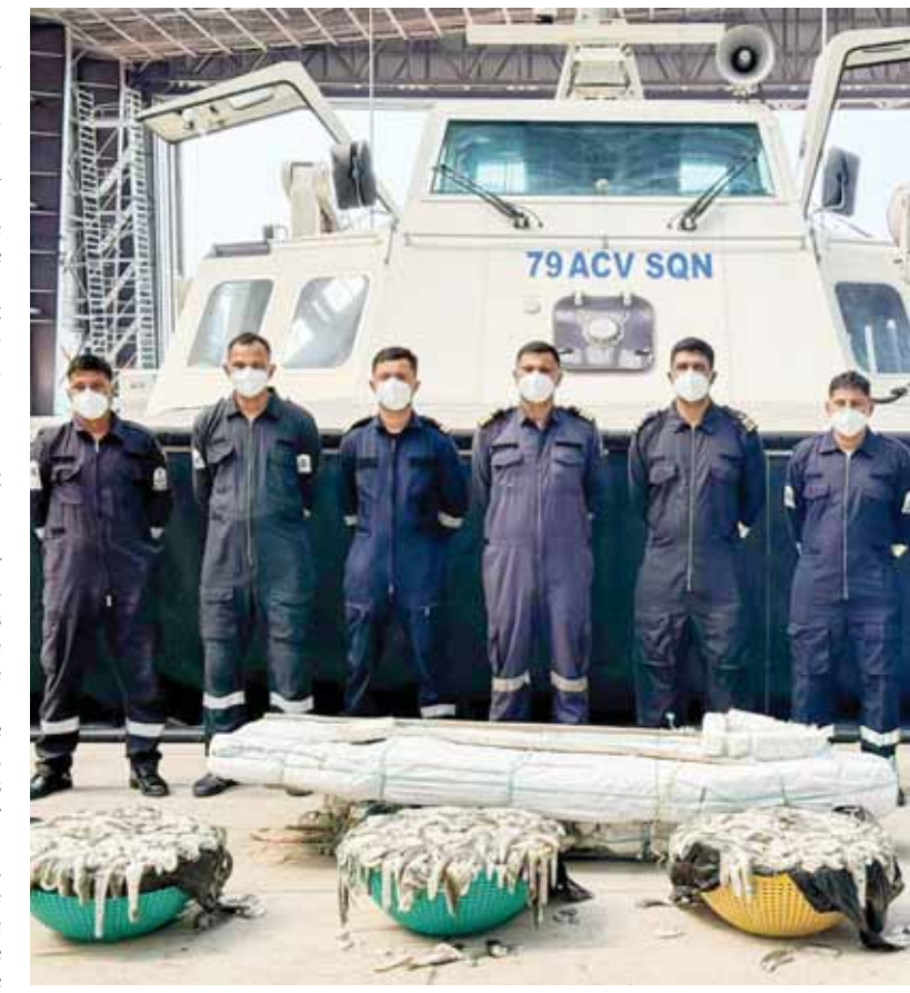
145 kg of illegal sea cucumbers seized by Indian Coast Guard during an anti-poaching operation

The coast guard and ATS had carried out a joint operation near the International Maritime Boundary Line in the Arabian Sea off Gujarat on the intervening night of April 12 and 13, the statement said.