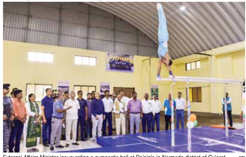
External Affairs Minister inaugurating a gymnastic hall at Rajpipla in Narmada district of Gujarat

"When I became a minister six years ago and visited Narmada district for the first time, people demanded a passport centre.