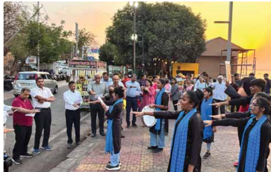
National Hydroelectric Development Corporation (NHDC) officials with artists in a street play take a pledge to fight against corruption at the birth anniversary celebration of BR Ambedkar at Boat Club in Bhopal on Tuesday.