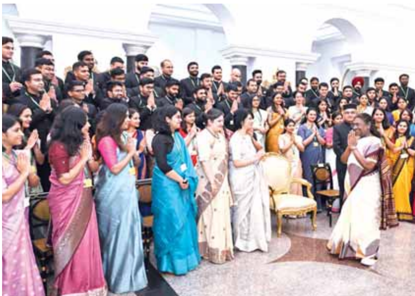
President Droupadi Murmu during an interaction with a group of IAS officers from the 2023 batch at the Rashtrapati Bhavan Cultural Centre in New Delhi

Their area of service and authority are so vast that they can make the lives of many fellow citizens better in their first