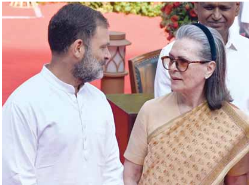
Congress leader Rahul Gandhi and his mother Sonia Gandhi