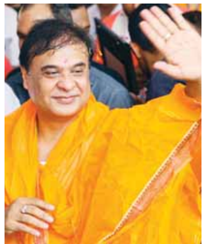
Assam Chief Minister Himanta Biswa Sarma attends Sri Sri Vishnu Hajanta at Barnadi in Nalbari district on Tuesday

"We don't need any conflict. The brotherhood should be maintained for the progress of Assam. That's why we should