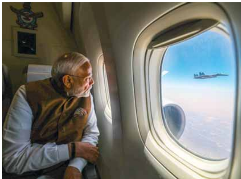
Prime Minister Narendra Modi looks at the fighter jets of Royal Saudi Air Force escorting his aircraft as it arrives in Jeddah

He said he is also eager to connect with the "vibrant" Indian community in Saudi Arabia that continues to serve as the living bridge between the two nations and makes an immense contribution to