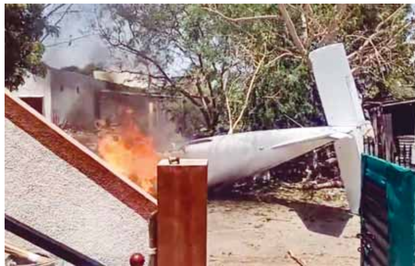
Flame and smoke rise up after a private company plane crashed in Amreli, Gujarat on Tuesday

He said a Delhi-based aviation academy provides pilot training from the