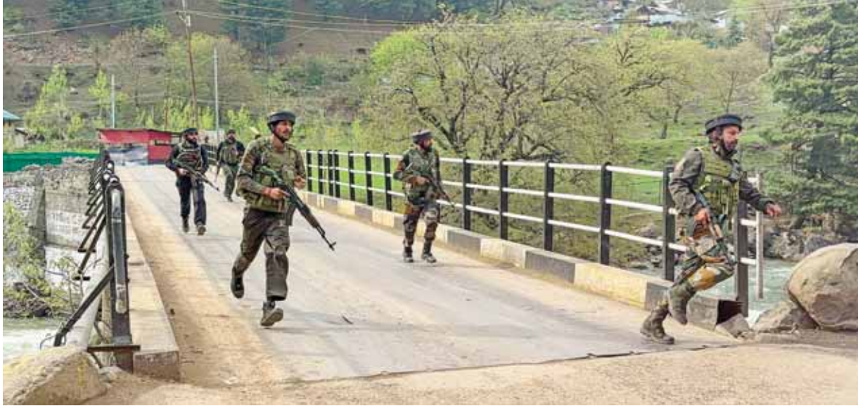
Security personnel rushing to the spot after terrorists attacked a group of tourists at Pahalgam, in Anantnag district of Jammu and Kashmir on Tuesday, April 22 (left); Injured being shifted to a hospital in Anantnag district (right)

According to eyewitness reports, the 'gruesome' attack took place around 1430hrs when a large number of tourists, after taking horse rides and absorbing themselves in the pristine beauty of Kashmir valley, were relaxing and breaking bread with their loved ones in the pic-