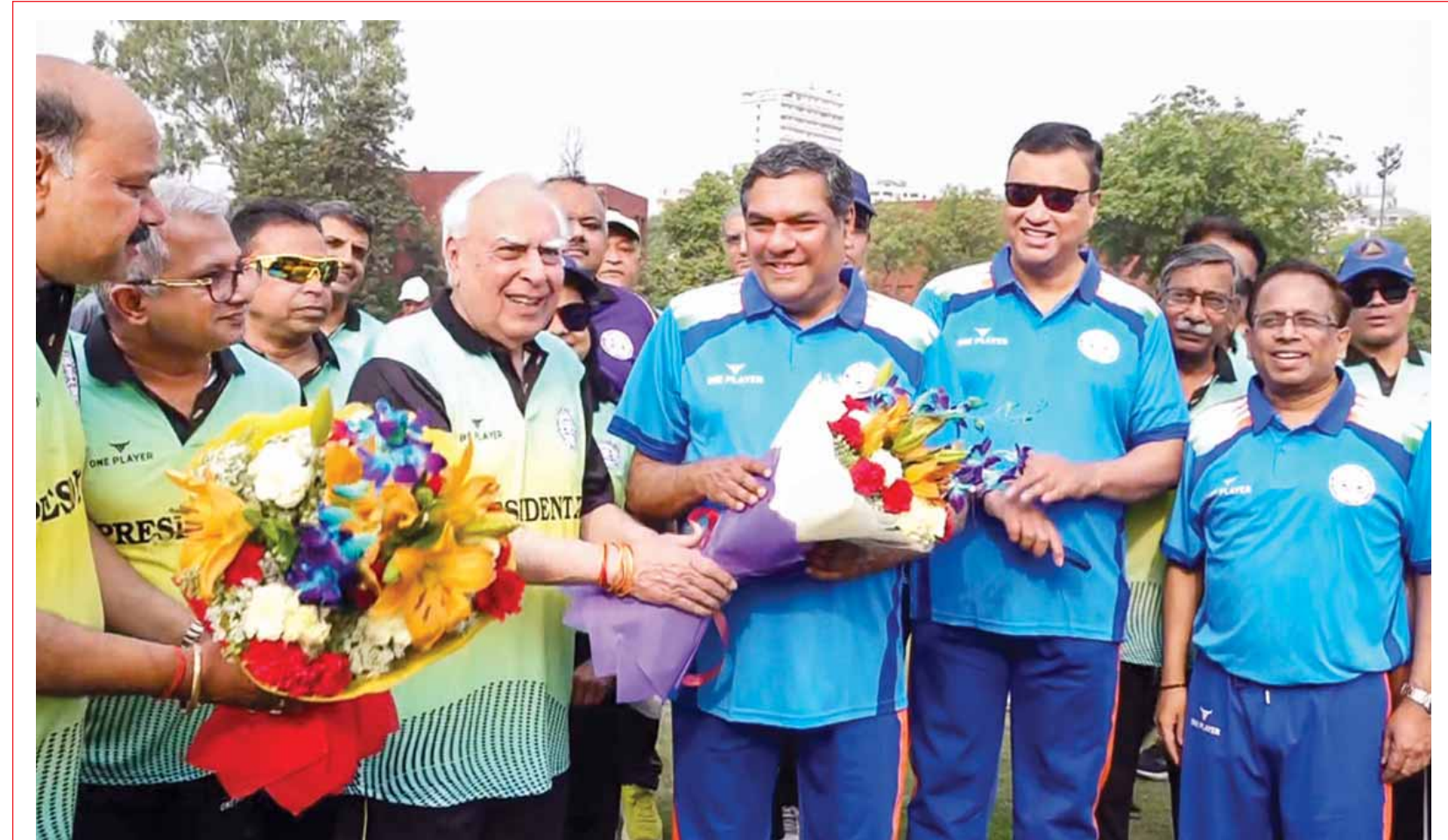
Chief Justice of India Sanjiv Khanna being greeted by Supreme Court Bar Association President Kapil Sibal before the start of a friendly cricket match between CJI XI and SCBA-XI at Modern School Cricket Ground in New Delhi on Sunday