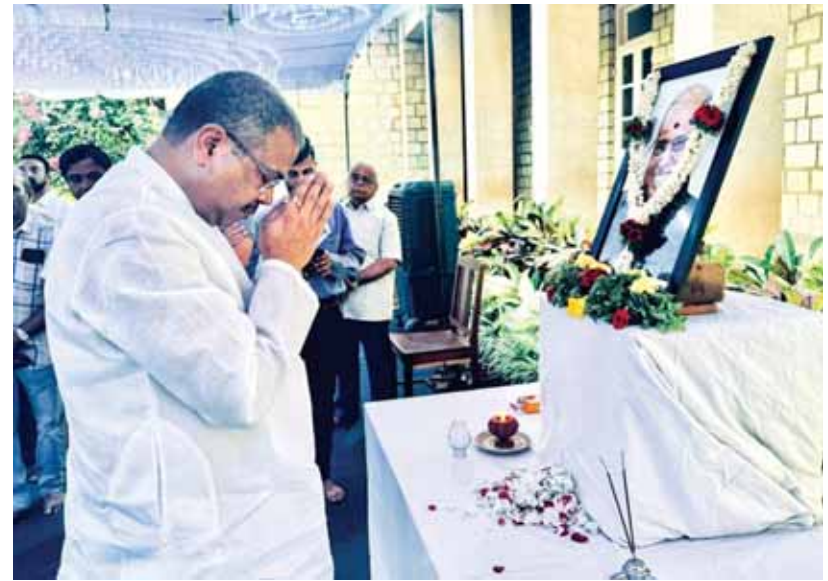
Union Education Minister Dharmendra Pradhan paying tribute to former ISRO chief K Kasturirangan at Raman Research Institute in Bengaluru