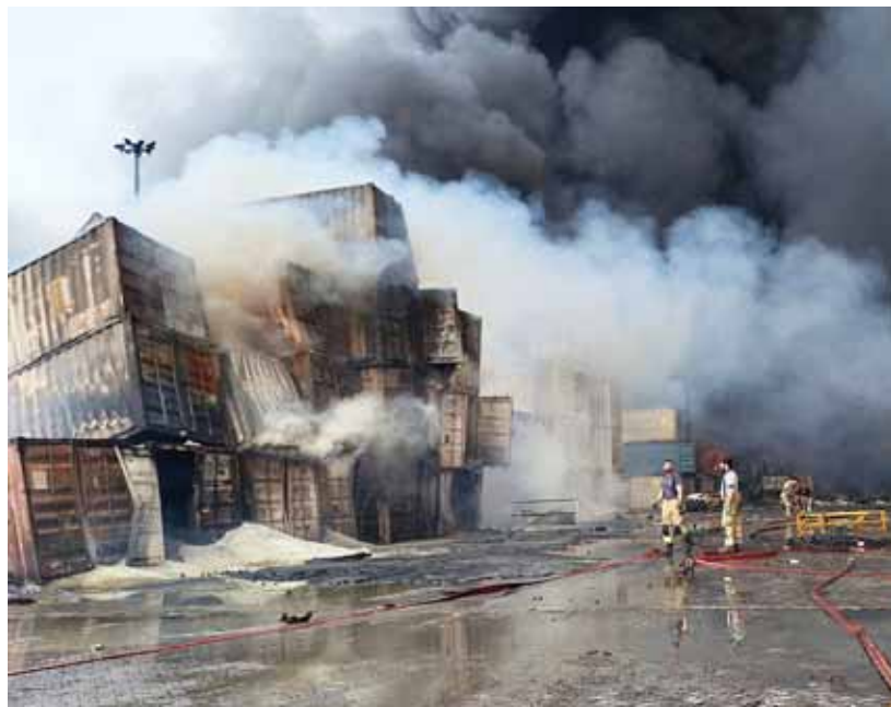
Firefighters work to extinguish the fire on Sunday, after a massive explosion and fire rocked a port near the southern port city of Bandar Abbas, Iran on Saturday

However, even Iranian Foreign Minister Abbas Araghchi, who led the talks, on Wednesday acknowledged that "our security services are on high alert given past instances of attempted sabotage and assassination operations designed to provoke a legitimate response."