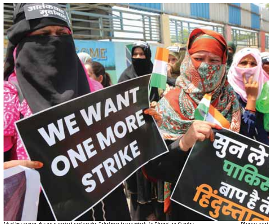
Muslim women during a protest against the Pahalagam terror attack, in Bhopal on Sunday.

Water and Land Management Institute (WALMI) had announced work on a more cost-efficient adaptation of the Miyawaki technique. Ironically, the WALMI campus itself was the venue of the Kaliyasot fire that gutted thousands of trees this week. The administration is yet to announce how it plans to compensate for the loss in green cover. Criticism aside, development does make some tree losses unavoidable. But delaying a creative, determined approach to rebuilding green cover comes with its own price. Every tree protected or successfully replaced will matter — not only for beauty or shade but for cooling a warming city, preserving its water, and ensuring that Bhopal remains a city that can sustain future generations.