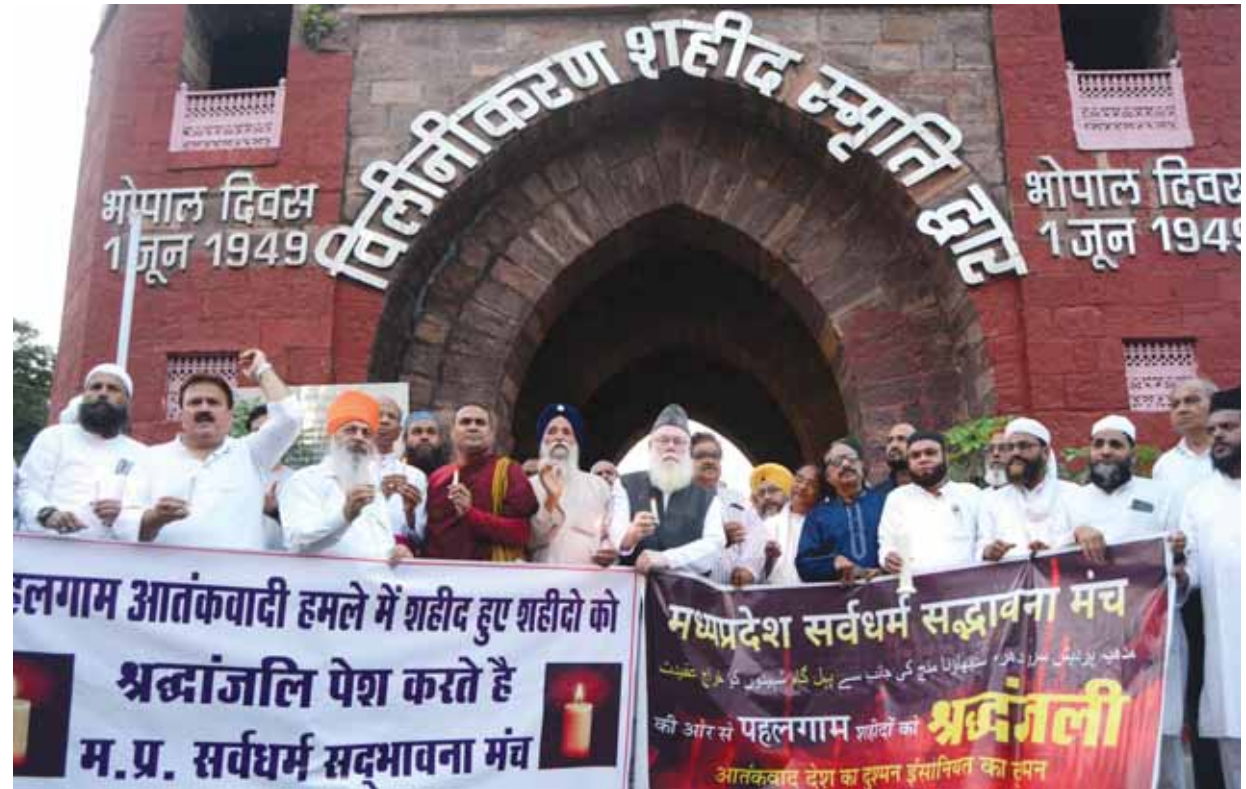
Priests from different religions under the banner of Madhya Pradesh Sadhbhavana March light candles to pay tributes to Pahalagam terror victims, at Shaheed Gate in Bhopal on Sunday.