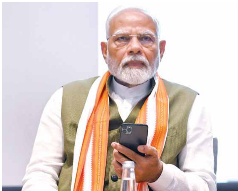
Prime Minister Narendra Modi FILE PHOTO

Moon. India has launched the Mars Orbiter Mission and we have reached pretty close to the Sun through the Aditya - L1 Mission," he said. Today, India is leading the most cost-effective but successful space programme in the entire world, he pointed out. Many countries of the world take help from ISRO for their satellites and space missions, Modi said. "When we see a satellite launch by ISRO, we are filled with