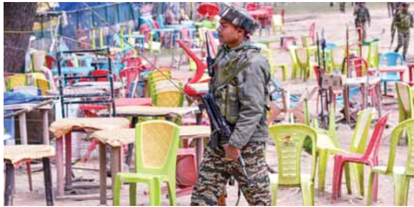
An Indian Army personnel at the site of the Pahalgam terror attack, in Anantnag district

very clear: to disrupt the narrative of returning peace and normalcy in Jammu and Kashmir. The region has recently witnessed record tourism and a democratic government assuming office.