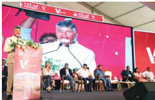
Chandrababu Naidu giving speech at inauguration ceremony

The Chief Minister, who had laid the foundation stone for the Central Block of VIT-AP in 2016, has graced the occasion as chief guest today and inaugurated the Mahatma Gandhi Academic Block — India's largest single academic block. Standing tall at 45 metres and spanning 7.68 lakh square feet, the block houses cutting-edge classrooms, lecture halls, collab-