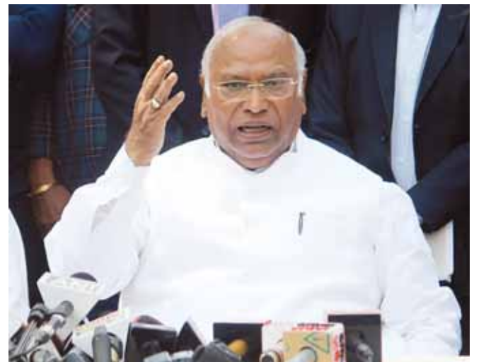
Congress chief Mallikarjun Kharge

"This is not an occasion for political debate, confrontations, people are worried, anguished, this is a traumatic event that took place in Pahalgam, it affected the entire country... An all-party meeting happened, but the PM didn't attend, he was campaigning in Bihar. We hope that the PM will agree, attend, and take Parliament into confidence. After all, this is 'Team