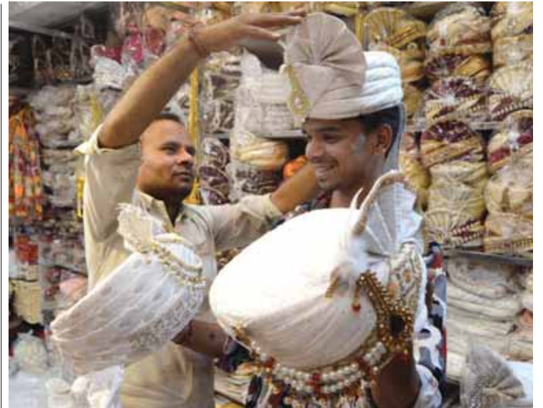
A group to select headgears at a shop on the eve of Akshaya Tritiya festival in Bhopal on Tuesday. Akshaya Tritiya is considered one of the most auspicious days of the Hindu calendar for marriages.

advisories for various groups: Farmers are urged to protect standing crops from potential hail damage. Residents in lightning-prone areas are advised to stay indoors and avoid open fields and tall structures during thunderstorms. Travelers should remain cautious due to potential water-logging and reduced visibility. The general public is encouraged to stay updated with the latest weather bulletins. The Meteorological Department emphasized the need for continued vigilance as dynamic weather patterns and the approaching Western Disturbance may cause further changes in the forecast beyond May 2. All concerned agencies have been placed on alert to swiftly respond to any weather-related emergencies during this period.