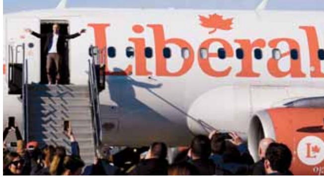
Liberal Leader Mark Carney arrives in Ottawa in Canada

The Liberals were leading or elected in 168 seats when the counting was paused, four short of a majority. Elections Canada estimated that the uncounted votes could affect the result in about a dozen districts.