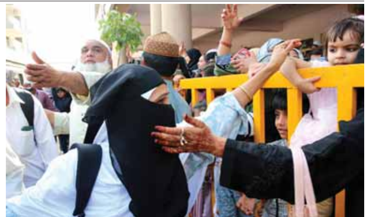
Hajj pilgrims being given a warm send off by their relatives and family members before they leave for an annual Hajj journey to Mecca shrine, at State Hajj House in Bhopal on Tuesday.