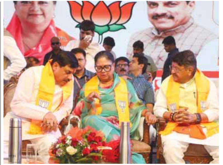
Madhya Pradesh Chief Minister Mohan Yadav, Senior BJP leader and Rajasthan former Chief Minister Vasundhara Raje Scindia and Minister for Housing and Urban Development Kailash Vijaywargiya at a seminar organized under Bharat Ratna Baba Saheb Dr. Bhimrao Ambedkar Samman Abhiyan at Ravindra Nalagruha, Indore, Madhya Pradesh on Tuesday.