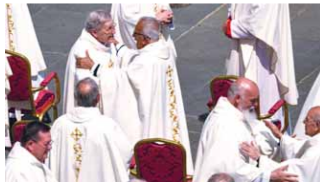
Cardinals hug and shake hands at the end of a mass for mourning late Pope Francis

Perhaps the most dramatic of Francis' encounters with the Indigenous commu-