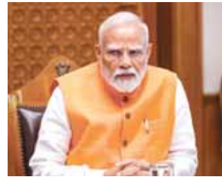
Prime Minister Narendra Modi chairs a meeting with Defence Minister Rajnath Singh, NSA Ajit Doval and armed forces chiefs in New Delhi

Chief of Defence Staff General Anil Chauhan was also part of the meeting, which was held amid India weighing its options for countermeasures following the