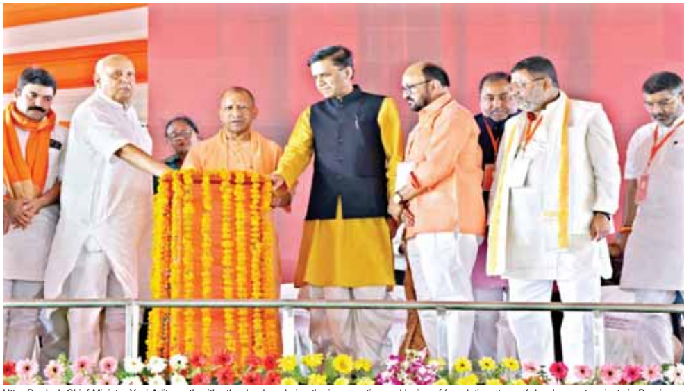
Uttar Pradesh Chief Minister Yogi Adityanath with other leaders during the inauguration and laying of foundation stone of development projects in Deoria district on Tuesday

The then government, he said, was only concerned about the welfare of its own