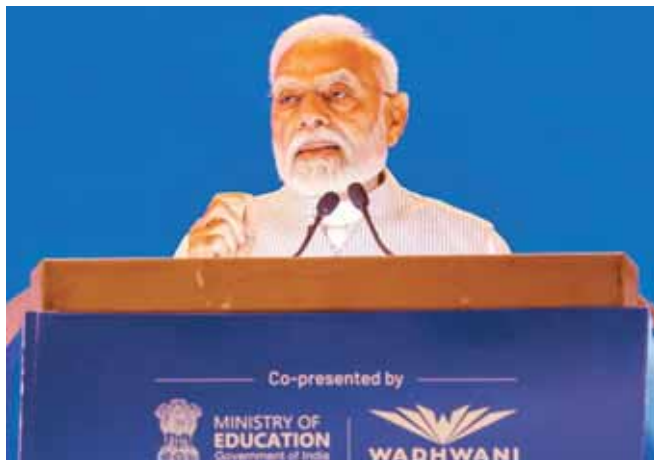
Prime Minister Narendra Modi

He stressed that reducing the distance from lab to market ensures faster delivery of research outcomes to the people, moti-