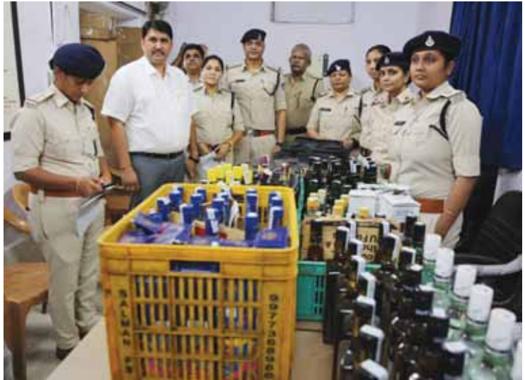
Excise department officials seize illegal foreign liquor from Chhola Ganesh Mandir locality in Bhopal on Tuesday.