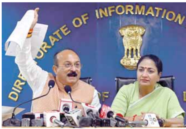
Delhi Chief Minister Rekha Gupta with Delhi Education Minister Ashish Sood addresses a press conference in New Delhi on Tuesday

Termining it a bold and holistic step by approving the draft of the Delhi School Education Transparency in Fixation and Regulation of Fees Bill, 2025 at the Cabinet meeting, Chief Minister Rekha Gupta said that schools