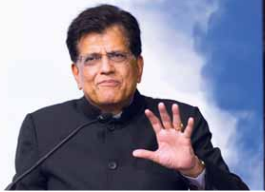
Union Minister Piyush Goyal speaks during the India-UK Business Roundtable

On Tuesday, the minister will meet UK Chancellor Rachel Reeves, among other senior officials. All eyes are on the FTA negotiations, which were re-launched in February following a pause for general elections last year. They are aimed at clinching a deal that is expected to significantly enhance the estimated GBP 41 billion a year India-UK trade partnership.