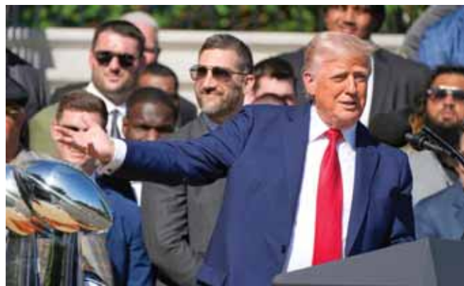
President Donald Trump speaks as he welcomes the Super Bowl champion Philadelphia Eagles

US expansionism, refusing to rule out military intervention in Greenland and Panama, suggesting that American developers could help convert the war-torn Gaza Strip into a Riviera-like resort and even suggesting annexation of Canada.