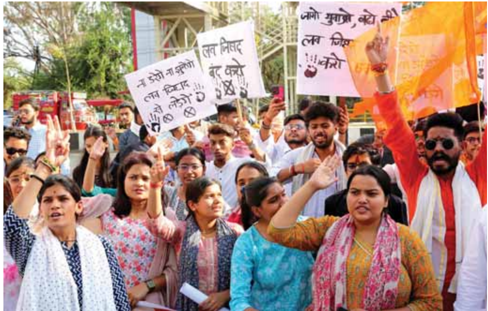
Akhil Bharatiya Vidyarthi Parishad activists stage a protest against incidents of love jihad in colleges, in Bhopal on Tuesday. A group of girls, including a minor, were allegedly targeted by a group of youths, students at their college, and forced to consume drugs before being sexually assaulted, revealed the police during investigation.

for victims and witnesses to ensure their safety. According to the investigation, the accused allegedly operated a coordinated racket, using fake identities to lure Hindu female students. Victims were reportedly drugged with marijuana or alcohol, sexually assaulted, and blackmailed using recorded footage. Some victims also reported being coerced into converting to Islam and pressured to engage in practices contrary to their religious beliefs, including the consumption of meat. A Special Investigation Team (SIT) has been constituted to handle the case, invoking stringent legal provisions under the Protection of Children from Sexual Offences (POCSO) Act, the Information Technology (IT) Act, and the Madhya Pradesh Freedom of Religion Act.