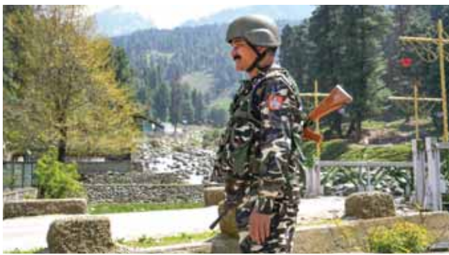
A security personnel stands guard a day after a terrorist attack in Pahalgam

Global leaders, including US President Donald Trump, US Vice President JD Vance, Russian President Vladimir Putin, UK Prime Minister Keir Starmer, Italian Prime Minister Giorgia Meloni, French President Emmanuel Macron, Israeli Prime Minister Benjamin Netanyahu and UN Secretary General Antonio Guterres condemned the Pahalgam terror attack and expressed their condolences and solidarity with India. Last week, the 15-nation UN Security Council issued a Press Statement condemning "in the strongest terms" the terrorist attack in Jammu and Kashmir,