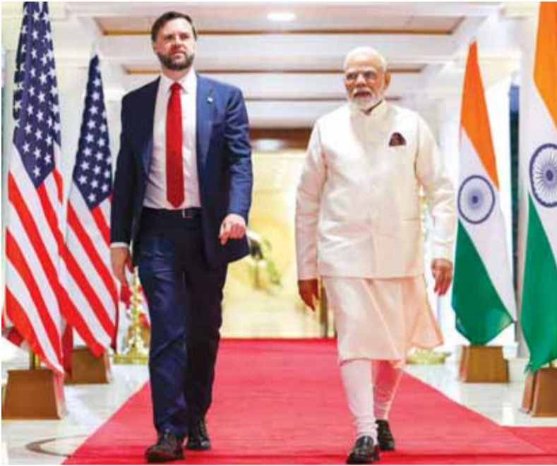
Prime Minister Narendra Modi during a meeting with US Vice President JD Vance

Prime Minister Modi fondly recalled his visit to Washington D.C. in January and his fruitful discussions with President Trump, which laid down the roadmap for