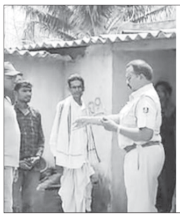
Chandahandi police station. Acting on the complaint, a police team reached the spot and broke open the locked

PNS ■ Nabarangpur In a gruesome incident, a man allegedly killed his wife at Haladi village under the Chandahandi police station in Nabarangpur district, concealed her body in a box cot and absconded from the village.