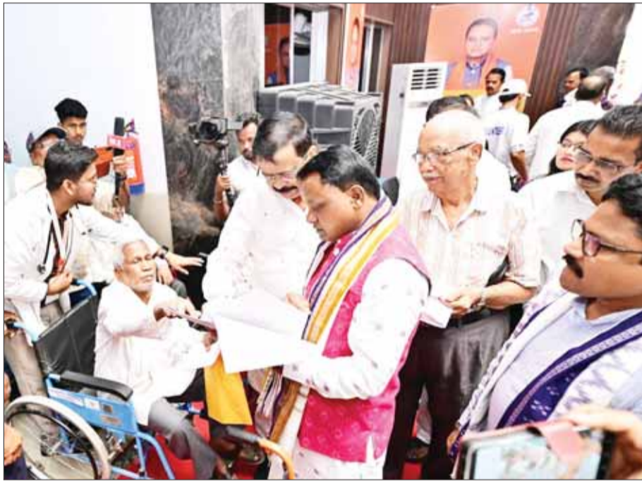
tal, underscoring his government's commitment to

This was the 10th edition of the State Government's grievance redressal programme, previously held only in Bhubaneswar. For the first time, the Chief Minister took the initiative out of the capi-