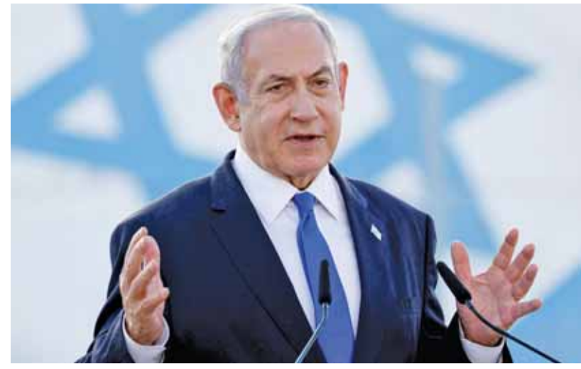
Minister Narendra Modi to Washington in February, US President Donald Trump said he agreed with the Indian leader to enhance the scope of the project, linking it right up to America. Singh emphasised the strategic partnership between India and Israel, noting that they had stood by each other in the hour of crisis.

moving towards peace and inclusion, connectivity and of course enhancing the incredible relations between our people". Touching upon areas of cooperation between the two countries, Herzog described the IMEC as the "future of the world", which has the potential to change the entire geostrategic situation of the globe.