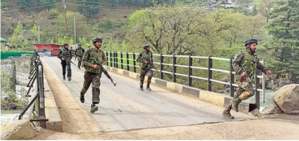
Security personnel rushing to the spot after terrorists attacked a group of tourists at Pahalgam, in Anantnag district of Jammu and Kashmir on Tuesday, April 22 (left); Injured being shifted to a hospital in Anantnag district (right)

According to eyewitness reports, the 'grooming' attack took place around 1430hrs when a large number of tourists, after taking horse rides and absorbing themselves in the pristine beauty of Kashmir valley, were relaxing and breaking bread with their loved ones in the pic-