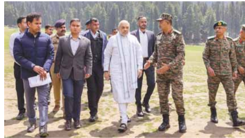
Union Home Minister Amit Shah visiting the site of the Pahalgam terror attack in Anantnag district, Jammu and Kashmir.

Across the Valley, political, religious, social and professional organisations condemned the killing of tourists at the famous Baisaran meadow of Pahalgam. Protests were held in several parts of