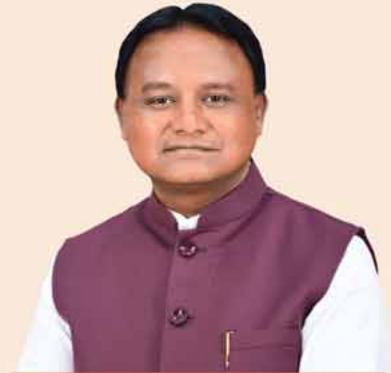
ଶ୍ରୀ ମୋହନ ଚରଣ ମାଝୀ ମୁଖ୍ୟମନ୍ତ୍ରୀ, ଓଡ଼ିଶା