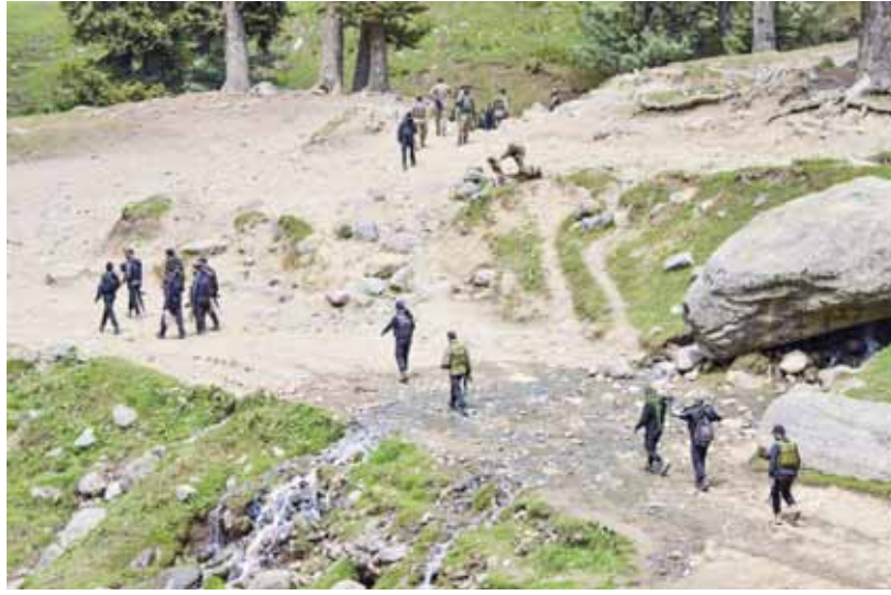
Security personnel near the site of the Pahalgam terror attack in Anantnag district, Jammu and Kashmir on Wednesday. At least 26 people were killed in the terrorist attack on Tuesday.

"All arrangements are being put up by our administration at Delhi Airport to help