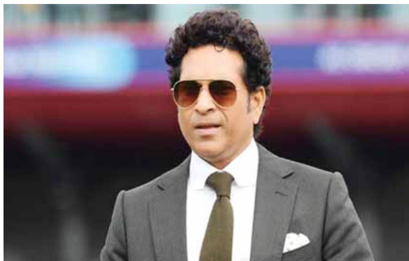
The affected families must be going through an unimaginable ordeal — India and the world stand united with them at this dark hour — SACHIN TENDULKAR, CRICKETER

"To target and kill innocent civilians in the name of religion is pure evil... No cause, no belief, no ideology can ever justify such a monstrous act. Yeh kaisi ladai hai... Jahaan insaan ki jaan ki koi keemat hi nahi (what