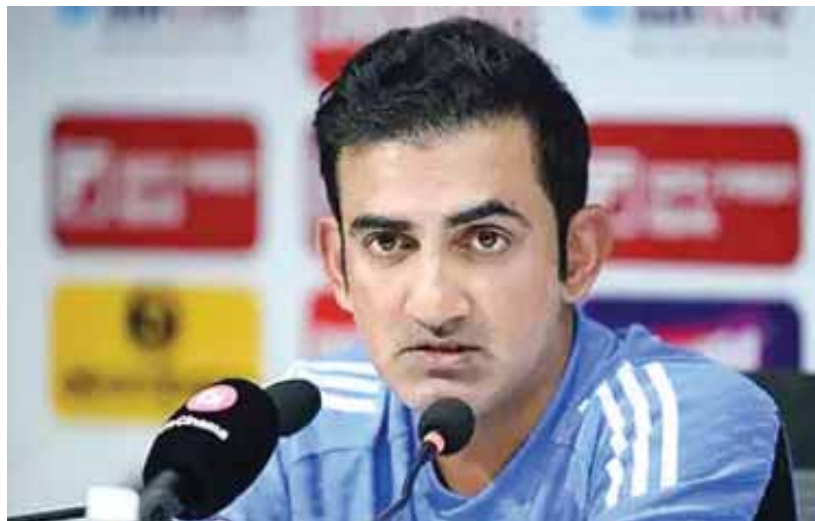
Praying for the families of the deceased. Those responsible for this will pay. India will strike — GAUTAM GAMBHIR, INDIAN CRICKET TEAM HEAD COACH