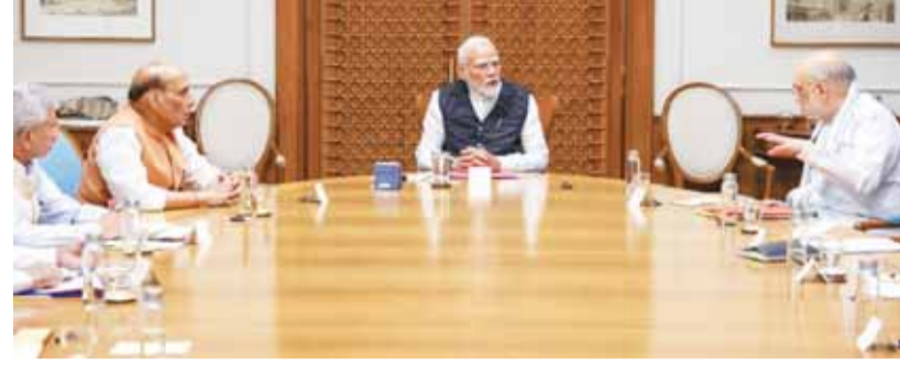
Prime Minister Narendra Modi chairing a meeting of the Cabinet Committee on Security (CCS) on Wednesday. At least 26 people were killed in a terror attack in Pahalgam of Jammu and Kashmir

While vowing a befitting reply, he also said India will not only hunt down the people who perpetrated the attack but will also