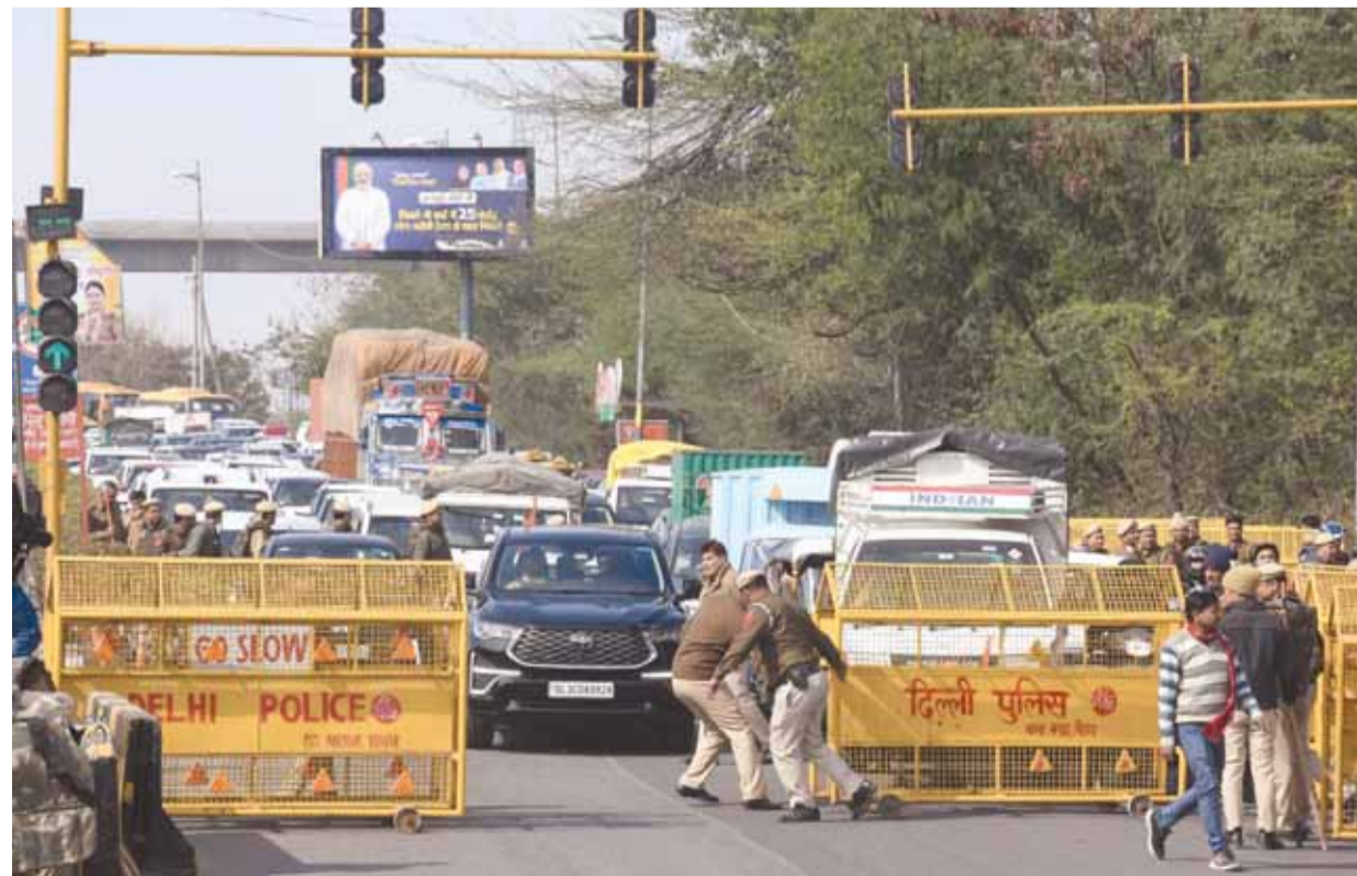
Delhi Noida border

The CAQM said commercial vehicles, especially older diesel ones, significantly contribute to Delhi-NCR's air pollution, particularly during winter. The decision is aligned with the Graded Response Action Plan (GRAP), which already restricts entry of polluting vehicles during high-pollution days. The commission has directed the transport departments and traffic police in Delhi and neighbouring states to ensure strict enforcement of this order at all 126 border entry points and 52 toll plazas equipped with