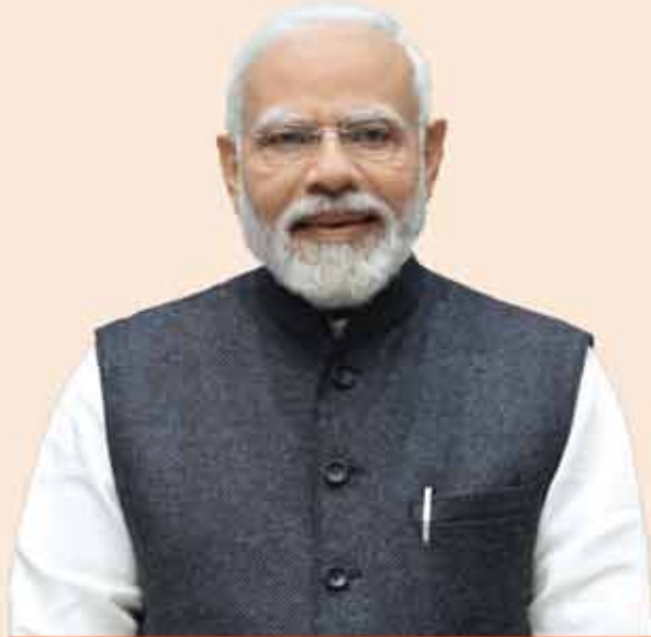
ଶ୍ରୀ ନରେନ୍ଦ୍ର ମୋଦୀ ପ୍ରଧାନମନ୍ତ୍ରୀ