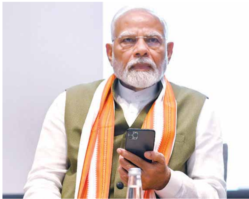
Prime Minister Narendra Modi FILE PHOTO

Moon. India has launched the Mars Orbiter Mission and we have reached pretty close to the Sun through the Aditya - L1 Mission," he said. Today, India is leading the most cost-effective but successful space programme in the entire world, he pointed out. Many countries of the world take help from ISRO for their satellites and space missions, Modi said. "When we see a satellite launch by ISRO, we are filled with