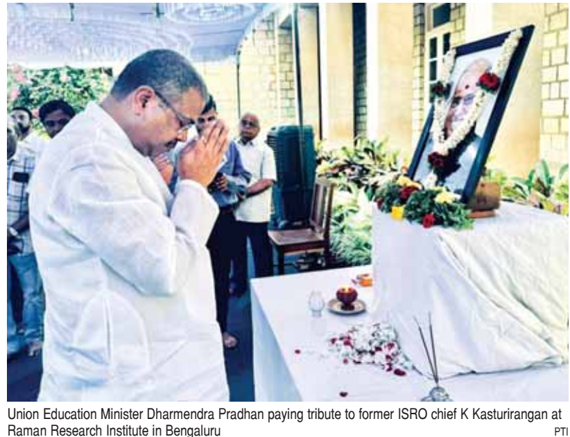
Union Education Minister Dharmendra Pradhan paying tribute to former ISRO chief K Kasturirangan at Raman Research Institute in Bengaluru P11