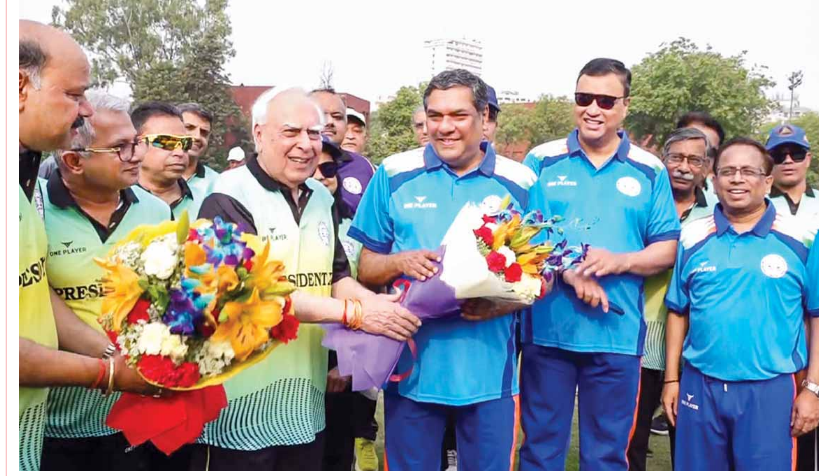
Chief Justice of India Sanjiv Khanna being greeted by Supreme Court Bar Association President Kapil Sibal before the start of a friendly cricket match between CJI XI and SCBA-XI at Modern School Cricket Ground in New Delhi on Sunday P11