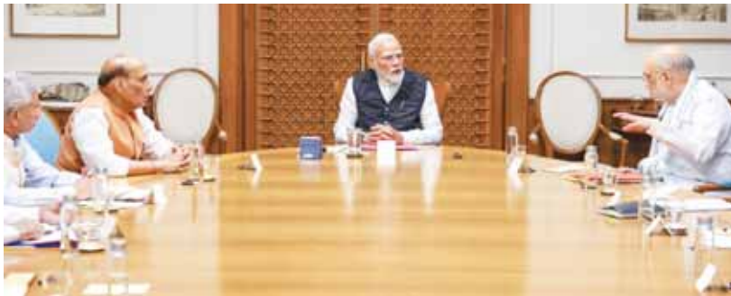
Prime Minister Narendra Modi chairing a meeting of the Cabinet Committee on Security (CCS) on Wednesday. At least 26 people were killed in a terror attack in Pahalgam of Jammu and Kashmir

While vowing a befitting reply, he also said India will not only hunt down the people who perpetrated the attack but will also