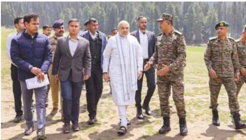
Union Home Minister Amit Shah visiting the site of the Pahalgam terror attack in Anantnag district, Jammu and Kashmir.

Jammu city, with many protesters raising anti-Pakistan slogans and demanding surgical strikes to destroy terror bases in the neighbouring country.