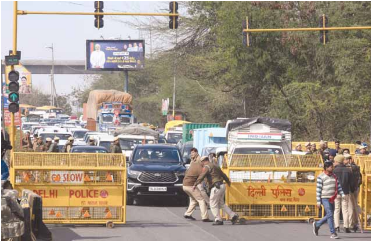
Delhi Noida border

The CAQM said commercial vehicles, especially older diesel ones, significantly contribute to Delhi-NCR's air pollution, particularly during winter. The decision is aligned with the Graded Response Action Plan (GRAP), which already restricts entry of polluting vehicles during high-pollution days. The commission has directed the transport departments and traffic police in Delhi and neighbouring states to ensure strict enforcement of this order at all 126 border entry points and 52 toll plazas equipped with