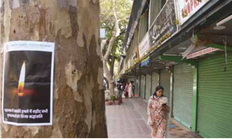
A poster put up in Janpath, Delhi, paying tributes to victims of the Pahalgam terror attack during a bandh called by city traders against the attack