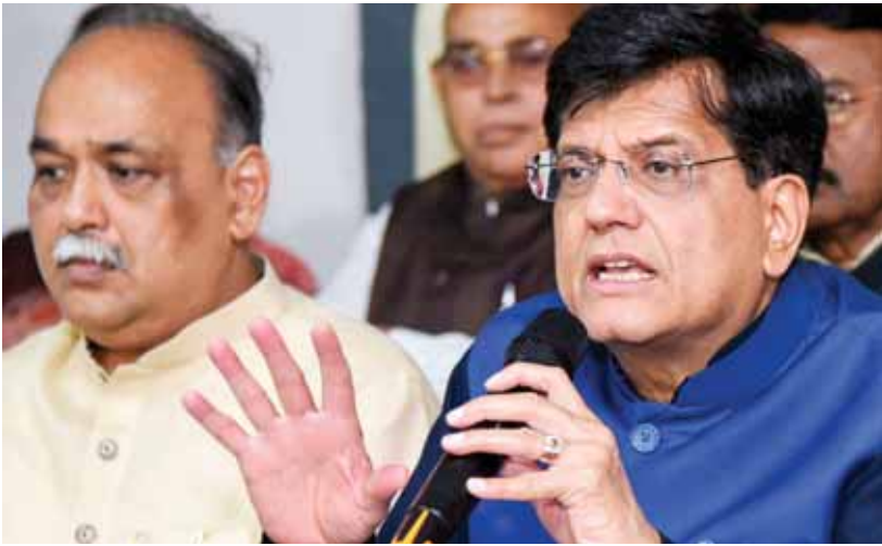
Union Minister Piyush Goyal

Union Minister Piyush Goyal on Friday said the target of achieving 500 million tonnes (MT) of steel production is a 'sub-optimal' one and the industry should aim for a higher target amid increasing per capita consumption of the metal in the country. The minister was delivering his keynote address at the 6th edition of Steel India 2025 event, hosted jointly by the Ministry of Steel and the Federation of Indian Chambers of Commerce and Industry (Ficci), which started on Thursday. 'Clearly 500 million tonnes (of steel production) is a sub-optimal target. We should, I think aspire at least to go up to the level of our nearest competitor. And why can we not aspire to be the world's largest manufacturer of steel by 2047,' Goyal exhorted the industry.