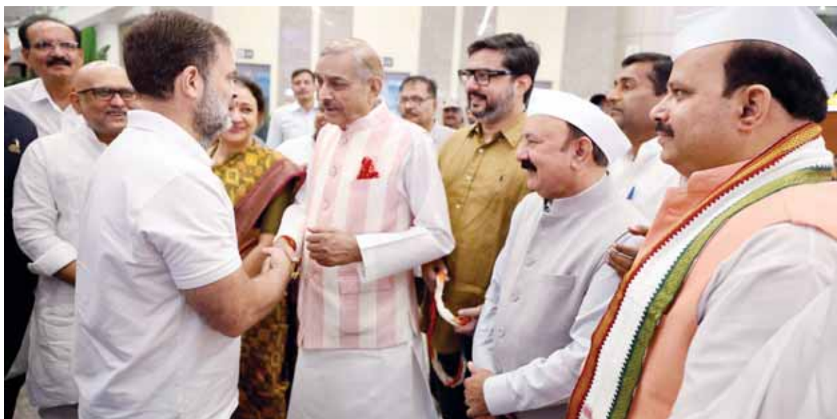
Opposition Leader Rahul Gandhi being received by Congress leaders Pramod Tiwari, Kishori Lal Sharma and others upon his arrival in Lucknow