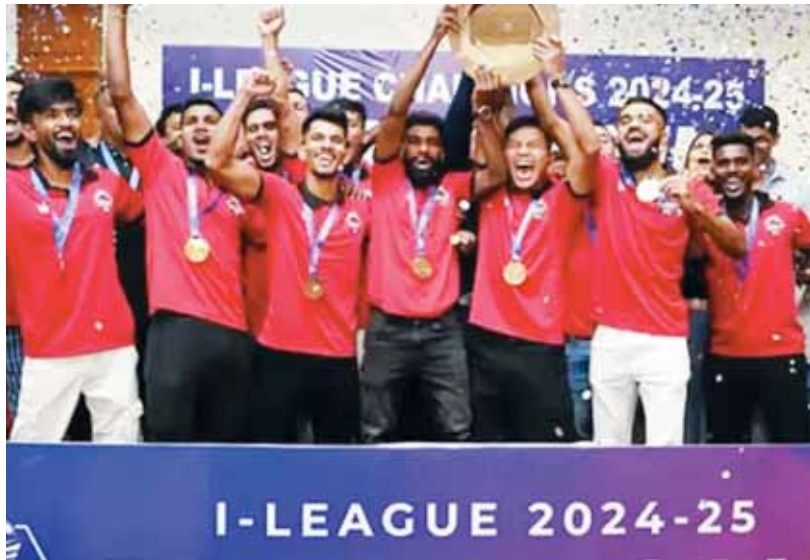
League trophy presentation after he was initially invited for the formal ceremony on Sunday. He said by doing so, the AIFF has shown "unacceptable level of mistreatment towards the GFA."