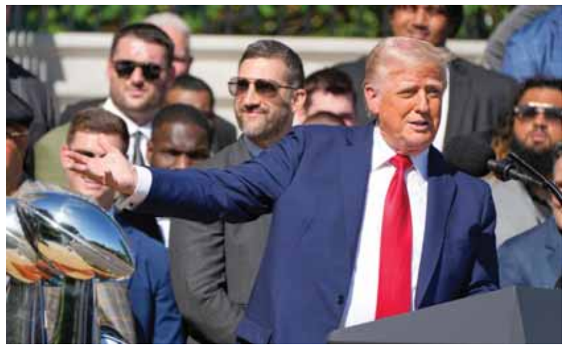
President Donald Trump speaks as he welcomes the Super Bowl champion Philadelphia Eagles

US expansionism, refusing to rule out military intervention in Greenland and Panama, suggesting that American developers could help convert the war-torn Gaza Strip into a Riviera-like resort and even suggesting annexation of Canada.