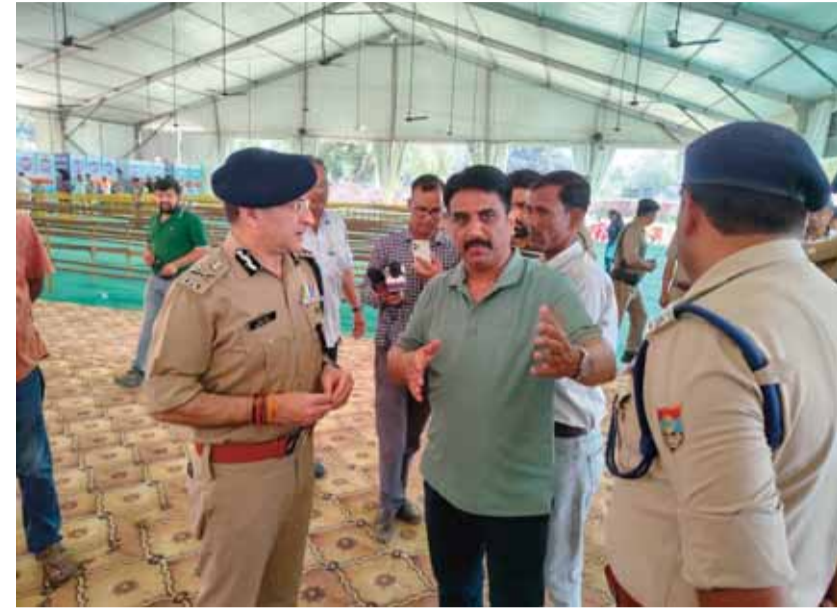
of the police personnel posted on Char Dham Yatra duty will be taken care of by the department. Special focus will be laid on providing water and other aids to the personnel to help them avoid the negative

impacts of heat. The police have made a special traffic plan combining Haridwar and Rishikesh along with a plan B to handle any eventuality, so that the traffic can be managed efficiently.