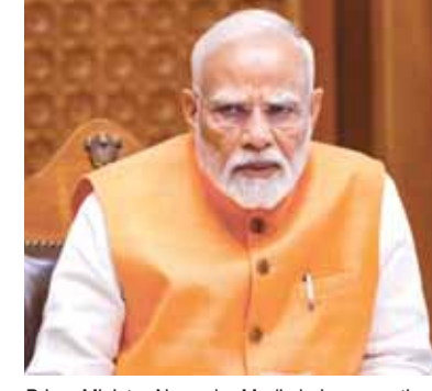
Prime Minister Narendra Modi chairs a meeting with Defence Minister Rajnath Singh, NSA Ajit Doval and armed forces chiefs in New Delhi

Prime Minister Narendra Modi asserted on Tuesday that the armed forces have 'complete operational freedom' to decide on the mode, targets and timing of India's response to the Pahalgam terror attack, as he chaired a meeting with the top defence establishment. During the high-level meeting, which was attended by Defence Minister Rajnath Singh, National Security Advisor Ajit Doval and the chiefs of three services, Modi affirmed that it is the national resolve to deal a crushing blow to terrorism, government sources said. Modi expressed complete faith and confidence in the professional abilities of the armed forces. Chief of Defence Staff General Anil Chauhan was also part of the meeting, which was held amid India weighing its options for countermeasures following the Pahalgam terror attack which left at least