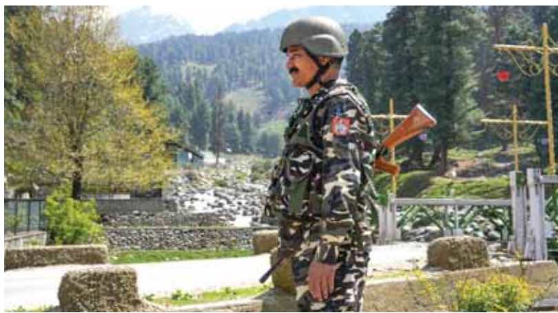
A security personnel stands guard a day after a terrorist attack in Pahalgam

Global leaders, including US President Donald Trump, US Vice President J D Vance, Russian President Vladimir Putin, UK Prime Minister Keir Starmer, Italian Prime Minister Giorgia Meloni, French President Emmanuel Macron, Israeli Prime Minister Benjamin Netanyahu and UN Secretary General Antonio Guterres condemned the Pahalgam terror attack and expressed their condolences and solidarity with India. Last week, the 15-nation UN Security Council issued a Press Statement condemning "in the strongest terms" the terrorist attack in Jammu and Kashmir,