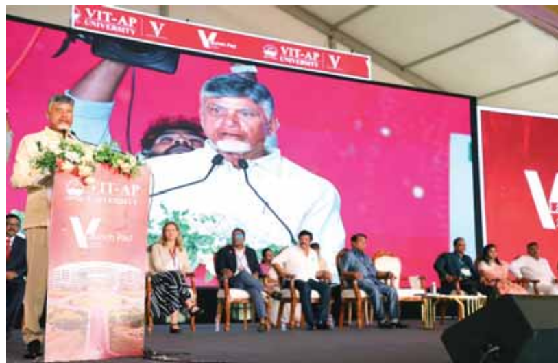
Chandrababu Naidu giving speech at inauguration ceremony

The Chief Minister, who had laid the foundation stone for the Central Block of VIT-AP in 2016, has graced the occasion as chief guest today and inaugurated the Mahatma Gandhi Academic Block — India's largest single academic block. Standing tall at 45 metres and spanning 7.68 lakh square feet, the block houses cutting-edge classrooms, lecture halls, collab-