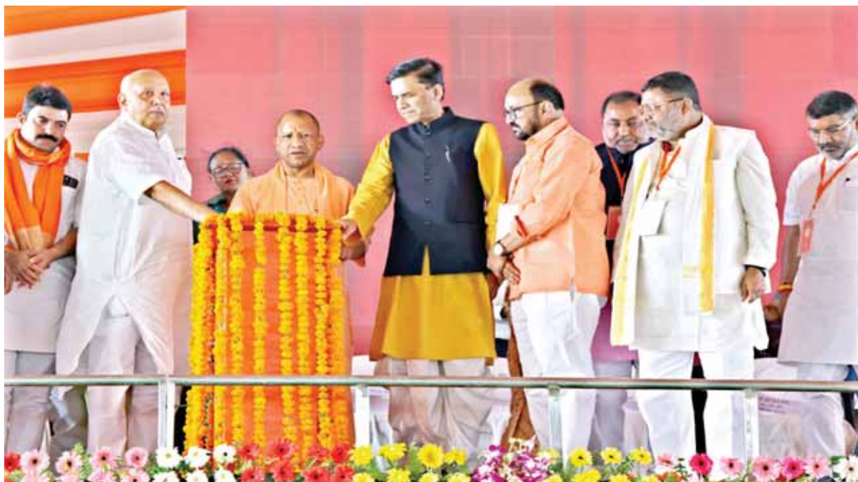
Uttar Pradesh Chief Minister Yogi Adityanath with other leaders during the inauguration and laying of foundation stone of development projects in Deoria district on Tuesday

The then government, he said, was only concerned about the welfare of its own