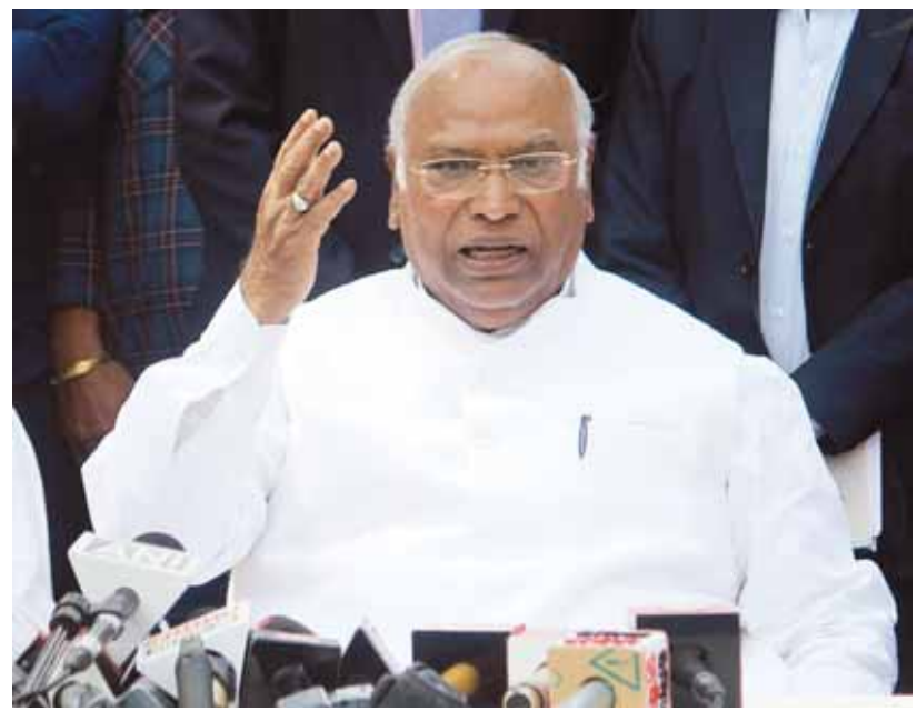
Congress chief Mallikarjun Kharge

"This is not an occasion for political debate, confrontations, people are worried, anguished, this is a traumatic event that took place in Pahalgalam, it affected the entire country... An all-party meeting happened, but the PM didn't attend, he was campaigning in Bihar. We hope that the PM will agree, attend, and take Parliament into confidence. After all, this is 'Team