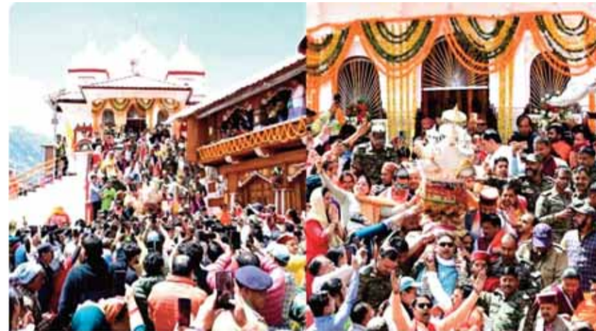
Devotees in Mukhwa depart for Gangotri with the Utsav Doli of Goddess Ganga on Tuesday

impacts of heat. The police have made a special traffic plan combining Haridwar and Rishikesh along with a plan B to handle any eventuality, so that the traffic can be managed efficiently.