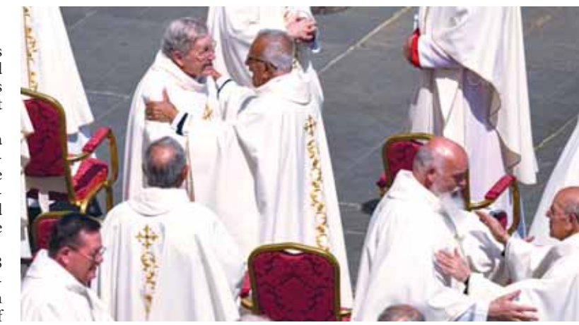
Cardinals hug and shake hands at the end of a mass for mourning late Pope Francis

Perhaps the most dramatic of Francis' encounters with the Indigenous commu-