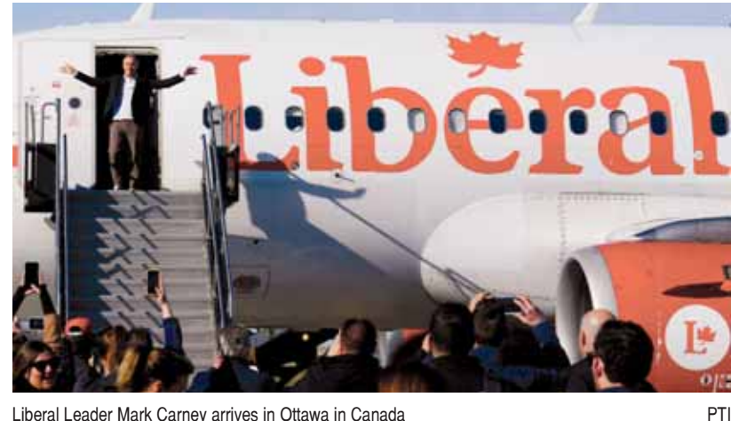
Liberal Leader Mark Carney arrives in Ottawa in Canada

voters and upending the election. Poilievre, a career politician, campaigned with Trump-like bravado, taking a page from the 'America First' president by adopting the slogan 'Canada First'. But his similarities to Trump may have ultimately cost him and his party. The Liberals were projected to win more of Parliament's 343 seats than the Conservatives. It wasn't immediately clear if they would win an outright majority — at least 172 — or would need to rely on a smaller party to pass legislation and remain in power. Elections Canada said it has decided to pause counting of special ballots — cast by voters who are away from their districts during the election — until later on Tuesday morning. The Liberals were leading or elected in 168 seats when the counting was paused, four short of a majority. Elections Canada estimated that the uncounted votes could affect the result in about a dozen districts.