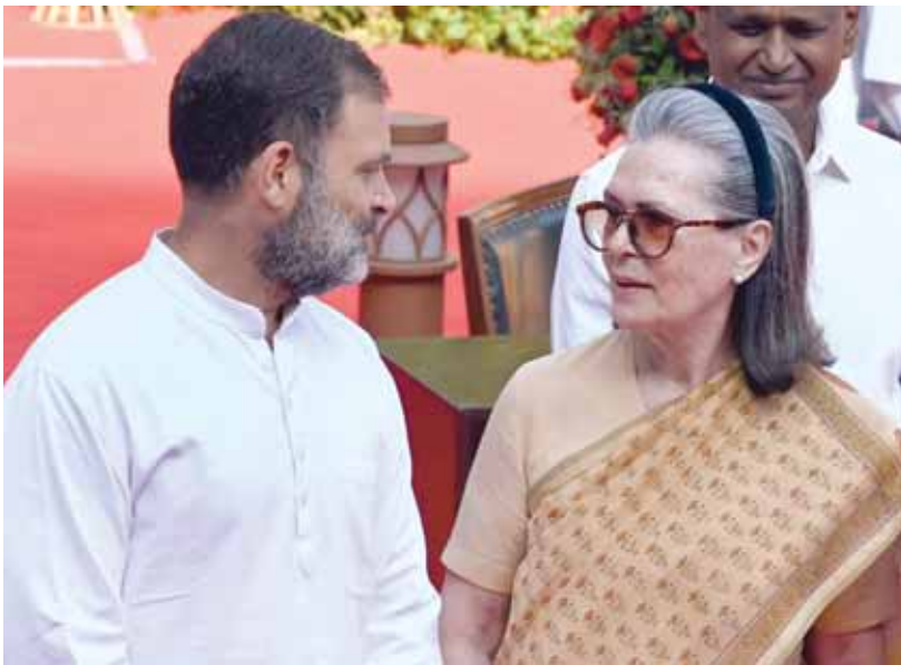
Congress leader Rahul Gandhi and his mother Sonia Gandhi