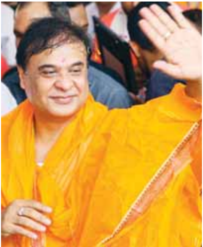
Assam Chief Minister Himanta Biswa Sarma attends Sri Sri Vishnu Hajanta at Barnadi in Nalbari district on Tuesday

"We don't need any conflict. The brotherhood should be maintained for the progress of Assam. That's why we should