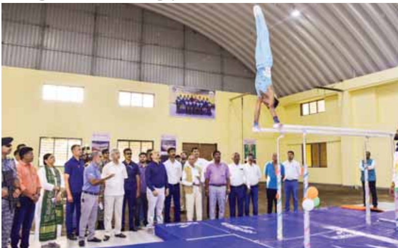
External Affairs Minister inaugurating a gymnastic hall at Rajpipla in Narmada district of Gujarat

"When I became a minister six years ago and visited Narmada district for the first time, people demanded a passport centre.