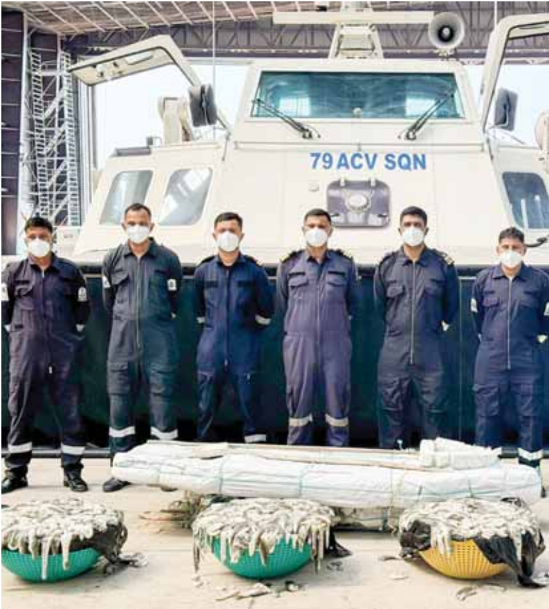
145 kg of illegal sea cucumbers seized by Indian Coast Guard during an anti-poaching operation

The coast guard and ATS had carried out a joint operation near the International Maritime Boundary Line in the Arabian Sea off Gujarat on the intervening night of April 12 and 13, the statement said.