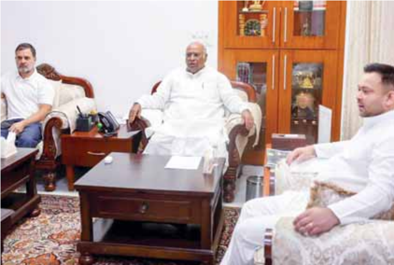
Congress President Mallikarjun Kharge with LoP in the Lok Sabha and party leader Rahul Gandhi and RJD leader Tejashwi Yadav during a meeting in New Delhi

20 years in Bihar and PM Modi is at the helm for 11 years... Amid all this, Bihar has been given step-motherly treatment. Bihar is the most economically backward (state), with the lowest per capita income, lowest