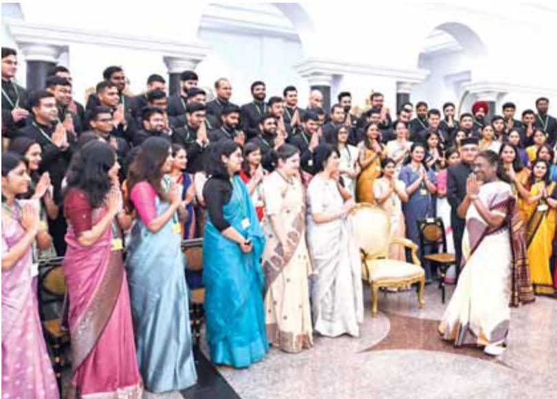
President Droupadi Murmu during an interaction with a group of IAS officers from the 2023 batch at the Rashtrapati Bhavan Cultural Centre in New Delhi

Their area of service and authority are so vast that they can make the lives of many fellow citizens better in their first