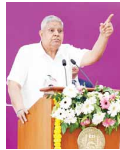
everything the Supreme court said was consistent with the country's constitutional values and guided by national interest.

This is the third of its kind remarks in recent times questioning the role and supremacy of judiciary and legislative which includes twice by the Presiding officer of Rajya Sabha and certain BJP leaders including vocal Lok Sabha MP Nishikant Dubey. All faced severe criticism by the Opposition parties while BJP chief J P Nadda distancing itself over the controversial remarks by party members which also led slamming by the legal experts. In a related development, Rajya Sabha MP Kapil Sibal on Tuesday said