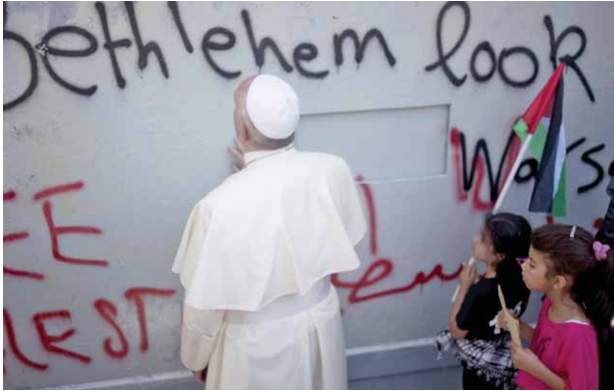
Pope Francis prays at Israel's separation barrier on his way to mass in Manger Square next to the Church of the Nativity, traditionally believed to be the birthplace of Jesus Christ in the West Bank of Bethlehem