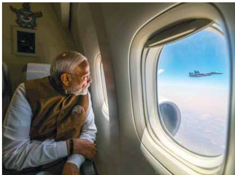
Prime Minister Narendra Modi looks at the fighter jets of Royal Saudi Air Force escorting his aircraft as it arrives in Jeddah

He said he is also eager to connect with the "vibrant" Indian community in Saudi Arabia that continues to serve as the living bridge between the two nations and makes an immense contribution to