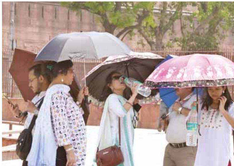
People shield themselves from scorching sun in New Delhi on Tuesday

Residents of the national capital are finding no relief even after sunset, with night-time temperatures is still above the normal. Experts believe the intensity of heat during the night is proving more harmful than high daytime temperatures. This April