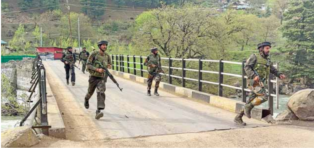
Security personnel rushing to the spot after terrorists attacked a group of tourists at Pahalgam, in Anantnag district of Jammu and Kashmir on Tuesday, April 22 (left); Injured being shifted to a hospital in Anantnag district (right)

According to eyewitness reports, the 'gruesome' attack took place around 1430hrs when a large number of tourists, after taking horse rides and absorbing themselves in the pristine beauty of Kashmir valley, were relaxing and breaking bread with their loved ones in the pic-