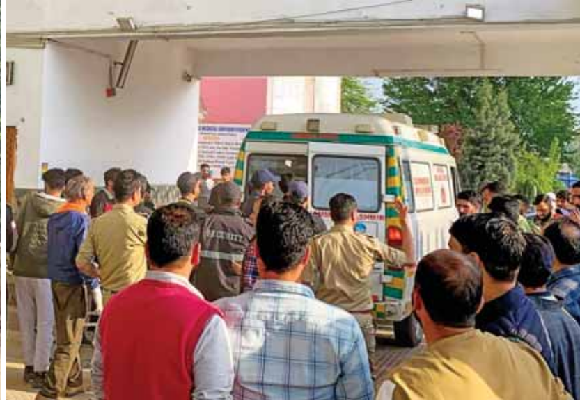
Injured being shifted to a hospital in Anantnag district (right)

turesque Baisaran meadow, half-an-hour trek from Pahalgam. In a viral video, one of the attack survivors claimed that while they were having snacks, an armed man, dressed in a combat uniform, arrived and sprayed bullets at them after verifying the religious identities of the tourists present. Tourists, with their heads punctured with bullets, were also seen writhing in pain in the picturesque meadow of Baisaran.