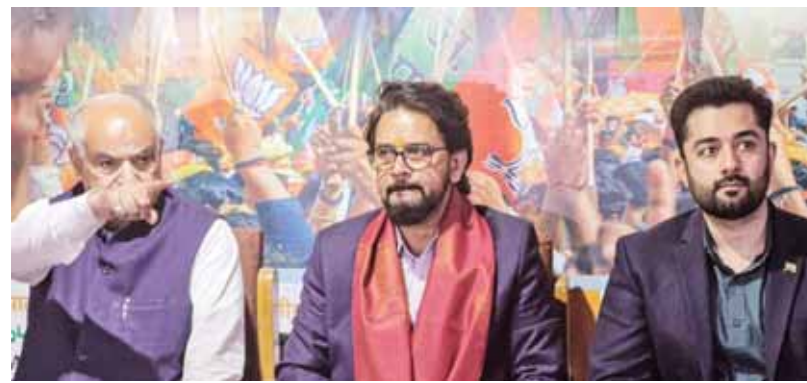
BJP MP Anurag Thakur along with senior BJP leaders during an event on the ‘One Nation One Election’, at the party headquarters in Srinagar on Tuesday

“If it (ONOE) matures up for 2029, elec-