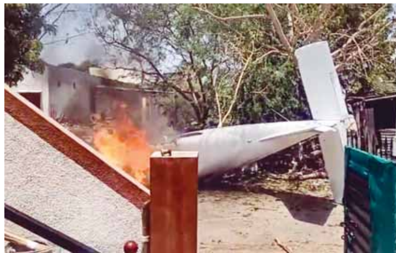
Flame and smoke rise up after a private company plane crashed in Amreli, Gujarat on Tuesday

He said a Delhi-based aviation academy provides pilot training from the