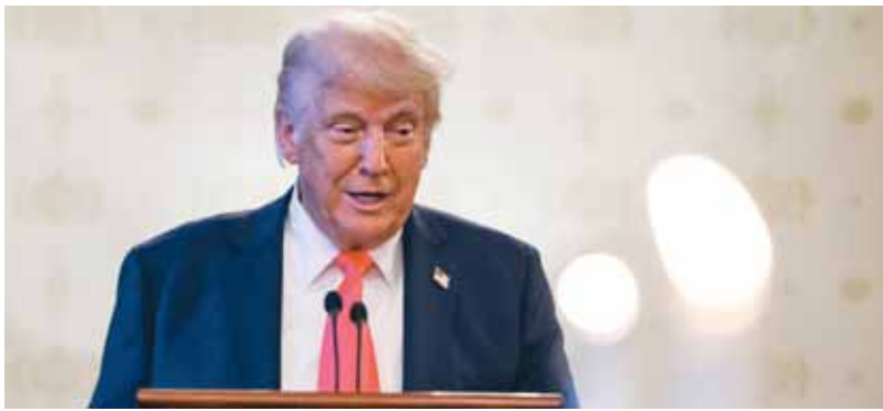
President Barack Obama was in office, years before the full-scale invasion that began in 2022. "They've had their submarines there for long before any period that we're talking about, for many years. The people speak largely Russian in Crimea," Trump said.

US President Donald Trump said in an interview published on Friday that "Crimea will stay with Russia," the latest example of the US leader pressuring Ukraine to make concessions to end the war while it remains under siege. "Zelenskyy understands that," Trump said, referring to Ukrainian President Volodymyr Zelenskyy, "and everybody understands that it's been with them for a long time." The US president made the comments in a Time magazine interview conducted on Tuesday. Trump has been accusing Zelenskyy of prolonging the war by resisting negotiations with Russian President Vladimir Putin. Crimea is a strategic peninsula along the Black Sea in southern Ukraine. It was seized by Russia in 2014, while US