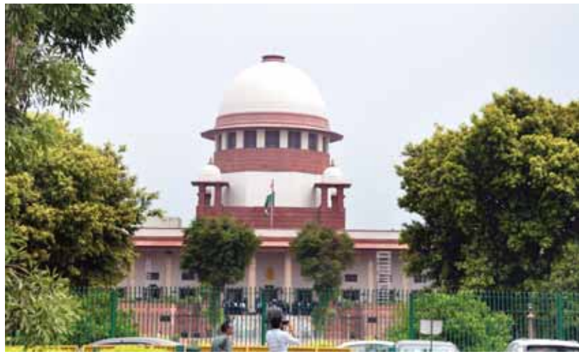
Supreme Court of India