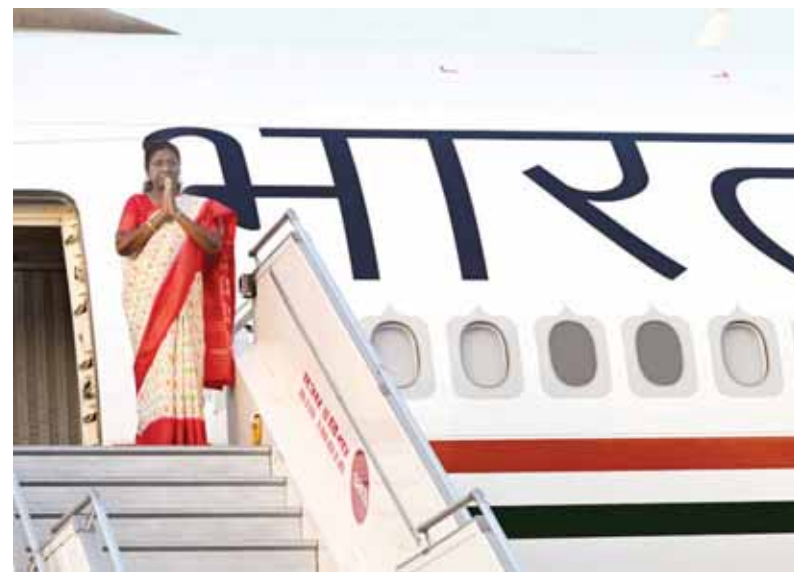
President Droupadi Murmu departs for Vatican City to attend the State Funeral of Pope Francis

The complainant has accused Gandhi of intentionally insulting Savarkar during the rally and said his remarks were part of a "well-planned conspiracy" to defame Savarkar.