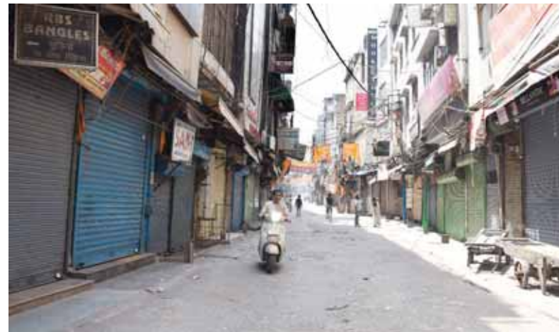
(Left to right) Janpath Market, Chandni Chowk and Sadar Bazaar shops closed amid a shutdown called by traders in protest against the Pahalgam terror attack