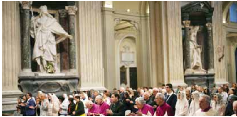
Faithful gather for a prayer for Pope Francis at the St John Lateran Basilica in Rome

Heads of state and royalty will start converging on Rome on Friday for the funeral of Pope Francis in the Vatican's St Peter's Square, but the group of poor people who will meet his casket in a small crosstown basilica are more in keeping with Francis' humble persona and disdain for pomp. US President Donald Trump and Argentine President Javier Milei are among the leaders arriving Friday, the last day Argentine pope will lie in state in St Peter's Basilica before his coffin is sealed in the evening in preparation for his funeral Saturday. The Vatican said 130 delegations are confirmed, including 50 heads of state and 10 reigning sovereigns.