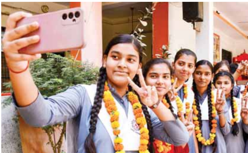
Students taking selfie in Prayagraj after the Uttar Pradesh Board declared class 12 result

In a historic achievement for the Uttar Pradesh Madhyamik Shiksha Parishad (UPMSP), the results for the 2025 High School and Intermediate board examinations were declared on Friday — just 43 days after the final paper was conducted. This swift declaration marks one of the fastest result turn-arounds in the state's educational history. The overall pass percentage for High School students stood at 90.11 per cent, while Intermediate students registered a pass rate of 81.15 per cent. Once again, girls have outperformed boys in both categories, continuing a consistent trend over recent years. In High School, girls surpassed boys by a margin of 7.21 per cent, and in Intermediate, the gap widened to 9.77 per cent. In terms of individual performance, Yash Pratap Singh of Late Raskendri Devi Inter College, Umri (Jalaun district), topped the High School exam with an impressive 97.83 per cent score. In Intermediate, the top position was secured by Mehak Jaiswal of Bacha Ram Yadav Inter College, Bhulai Ka Pura (Prayagraj district), who scored 97.20 per cent. Chief Minister Yogi Adityanath congratulated all successful students and lauded