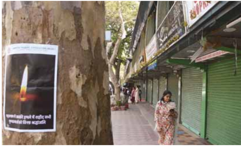
A poster put up in Janpath, Delhi, paying tributes to victims of the Pahalgam terror attack during a bandh called by city traders against the attack