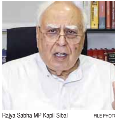
Rajya Sabha MP Kapil Sibal

"In 1972, Zulfikar Ali Bhutto had said, 'we will bleed India with a thousand cuts'. Following that, terror attacks have taken place in Parliament in 2001, Kaluchak massacre in 2002, Indian Institute of Science was attacked in 2005, Mumbai train bombings in July 2006, Mumbai attack in 2008, Pathankot airstrike in 2016, Uri terror strike in 2016 and Pulwama suicide bombings in 2019, this continues," he said. "In context, I want to suggest to the PM to convene a special session of Parliament and hold discussion over this, because the coun-