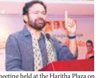
meeting held at the Haritha Plaza on Friday, Kishan warned that there is a danger of Razakar days coming back if the people of Telangana fail to act logically, as the Congress and the BRS are supporting the AIMIM. He asked the Congress and the

Hyderabad is attracting leading companies due to the efforts of Prime Minister Narendra Modi, Telangana BJP President and Union Minister of Coal and Mines, G. Kishan Reddy said. He said that Hyderabad doesn't mean High-Tech City alone, but also Amberpet, Nampally, Khairathad and other places. However, the BRS government developed only areas where real estate business existed, Kishan said. Addressing the Hyderabad Local Body MLC elections preparatory