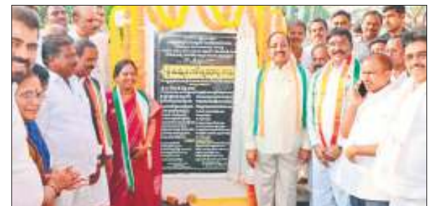
Agriculture Minister Tummala Nageswara Rao laying the foundation stone for the CC road in the 16th Division in Khammam on Friday