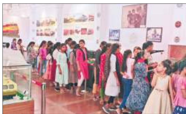
Children at the Rail Museum in Kacheguda on Friday to witness World Heritage Day celebrations

Built in 1916, the Kacheguda Railway Station has also received the Platinum rating from the Indian Green