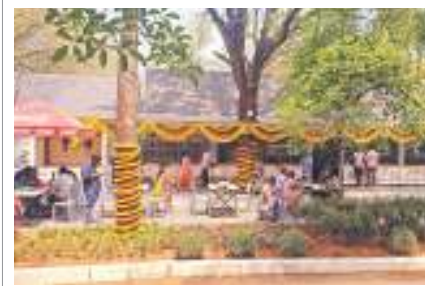
Rhino Food Court