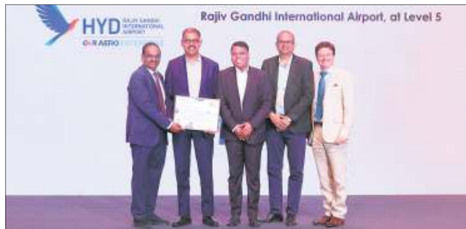
Representatives from Rajiv Gandhi International Airport receiving the Level 5 Accreditation in Hyderabad on Friday

The airport has already achieved net zero emissions for Scope 1 and 2 and is working towards net zero