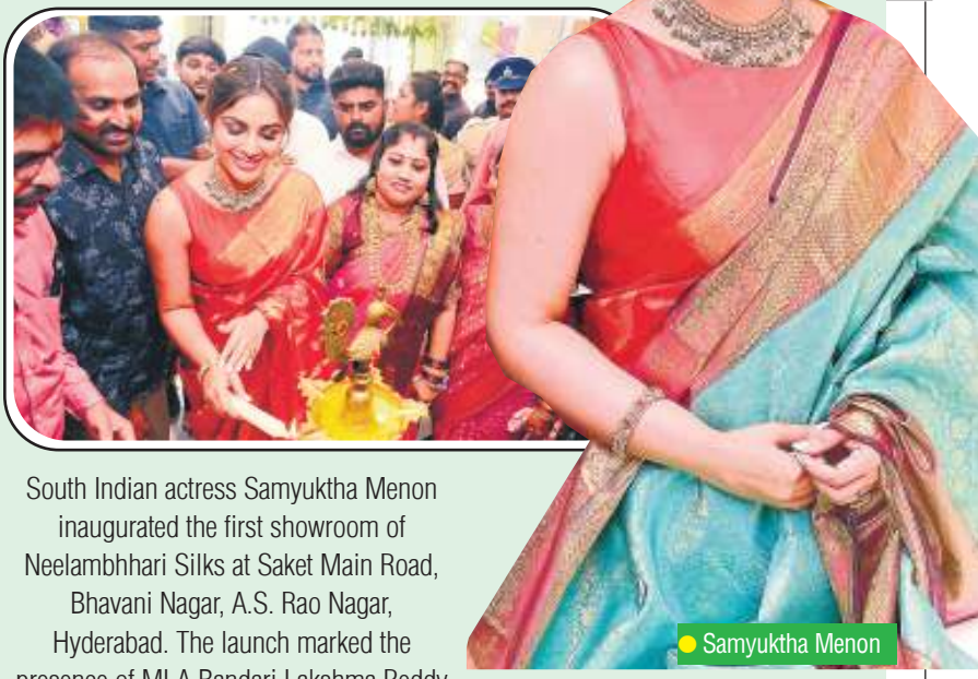
● Samyuktha Menon