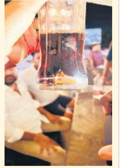
A soft drink bottle in a lizard tail is found at Peddapur in Sangareddy district on Friday

The sun is blazing mercilessly outside. With the heat beating down, people are drenched in sweat. When it is so hot and harsh outside, many crave a soft drink to refresh themselves. People often grab their favourite soft drink and gulp it down eagerly. A group of friends who visited a restaurant near Peddapur in the Sangareddy district, beside NH65, had an unpleasant experience. As the weather was unbearably hot, they decided to head inside and gulp down a cool drink. Everyone picked their favourite cool beverages. They opened the bottles and started drinking eagerly. Most had finished nearly half of their drinks when one young man noticed something odd in his bottle. As he looked closely, what he saw left him completely shocked—a sight that made his head spin. Inside the bottle of a well-known brand of cool drink, he noticed some unusual particles. On closer inspection, he realised, to his horror, that it was the tail of a lizard. Panic erupted at the restaurant once the tail of a lizard in the cool drink came to light. The customer, who had already consumed half of the drink before noticing it, along with his friends, expressed outrage. The young man, who began feeling unwell, was immediately taken to the hospital by his