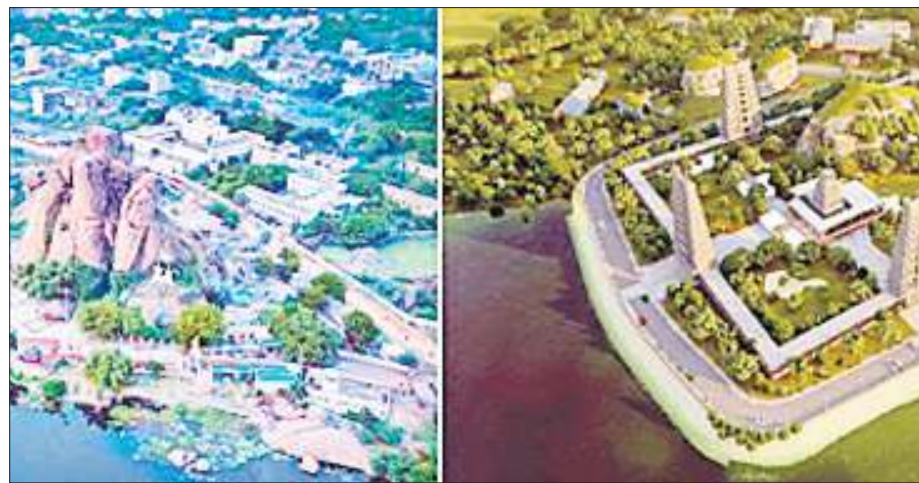
Aerial view of Bhadrakali Temple alongside the proposed design for the Bhadrakali temple in Warangal

Bhadrakali temple set for major facelift on line Madurai Meenakshi The Bhadrakali Temple in Warangal is set to witness a grand transformation. Development works have begun with a budget of Rs 54 crore as per the directions of Chief Minister A Revanth Reddy. The temple is being developed based on the model of the Meenakshi Amman Temple in Madurai, Tamil Nadu. The Orugallu Bhadrakali Temple in Uttara Telangana (North Telangana), is a prominent and ancient shrine dedicated to the goddess Bhadrakali. The temple features a striking idol of the goddess, which stands 9 feet tall and 9 feet wide, carved from a single large block of stone in a monolithic style. Nestled on the banks of Bhadrakali Lake, the temple boasts a scenic setting between Hanamkonda and Warangal, just 1.5 kilometres from the national highway. Inscribed on the temple walls is a historical note indicating that King Pulakesi II of the Chalukya Dynasty commissioned its construction around 625 AD to commemorate his victory over the Vengi Chalukyas in the Andhra region. This is evident in the temple's architecture, where the square pillars differ from the circular pillars typically used by the Kakatiyas. The