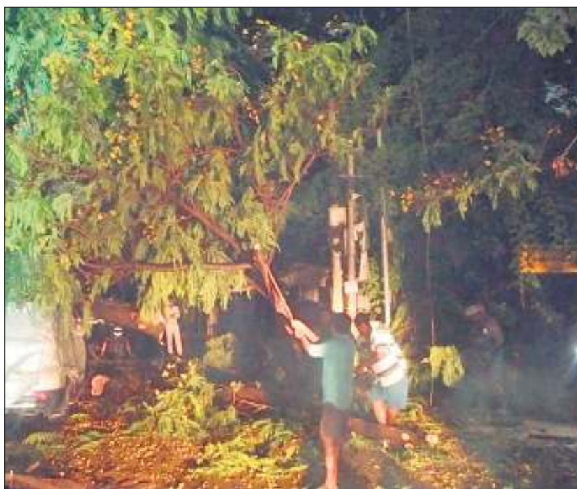
A large tree crashed at Saroonagar Police Station

The Greater Hyderabad Municipal Corporation (GHMC) and DRF teams also reached waterlogged areas to take quick action and prevent further inconvenience. Measures such as removing fallen trees,