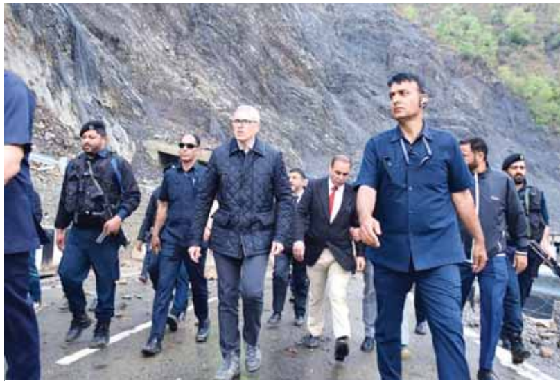
Chief Minister Omar Abdullah visited Maroog in Ramban district to take stock of the devastation caused by the recent flash floods and landslides.

Meanwhile, to clear the rush of stranded vehicles, the authorities threw open the Mughal road connecting the twin border districts of Rajouri and Poonch in Jammu to south Kashmir's Shopian district. Chief Minister Omar Abdullah also visited Ramban on Monday to assess the ground situation. Three people, including two minor siblings, were killed and more than 100 people were rescued after cloudburst-induced floods and landslides on Sunday caused massive damage to infrastructure, including roads and residential buildings. Bad weather prevented the Chief Minister from reaching out to the affected families. Earlier in the day, Divisional Commissioner Jammu Ramesh Kumar and Inspector General of Police Bhim Sen Tuti visited flood-affected and landslide-hit areas of Ramban district to assess the damage. Accompanied by Deputy Commissioner Ramban Baseer-Ul-Haq Chaudhary, SSP Ramban Kulbir Singh, SSP