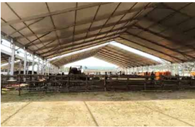
The stage is being prepared at the CSA ground for Prime Minister Narendra Modi's public meeting.

Earlier on Sunday Chief Minister Yogi Adityanath inspected the rally venue. The prime minister will land at the CSA helipad and address the public at the rally and inaugurate as well as lay foundation stones for several development projects. Modi will inaugurate and lay the foundation stones of 11 projects worth