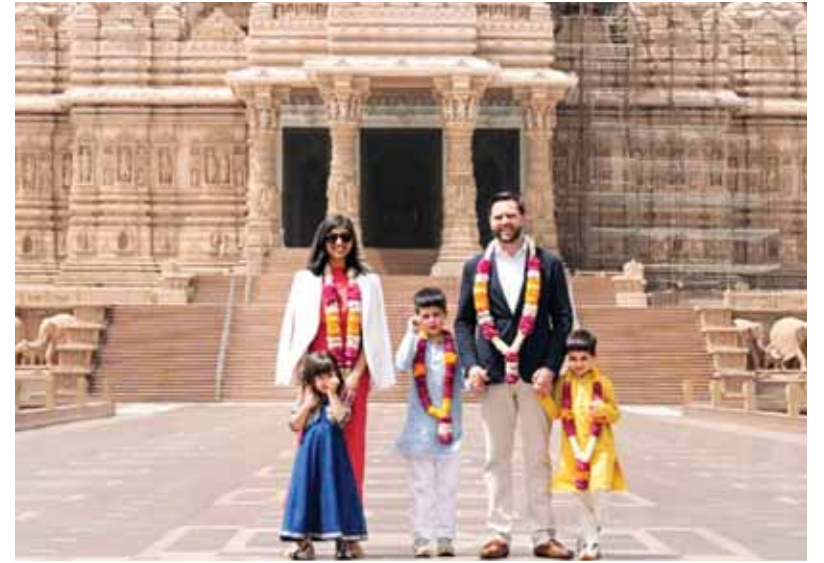
US Vice President JD Vance with Second Lady Usha Vance and their children visits Akshardham temple in New Delhi

The Vance family visited the Akshardham temple where they posed for camera crews outside the shrine's imposing facade. Vance and his family will travel to Jaipur and Agra during their four-