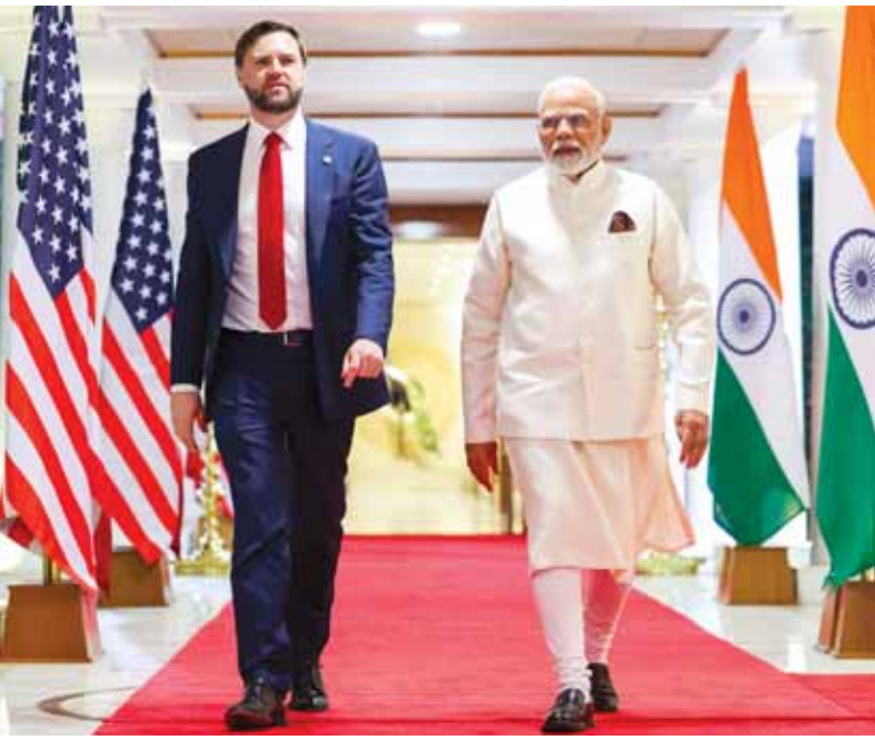
Prime Minister Narendra Modi during a meeting with US Vice President JD Vance

Prime Minister Modi fondly recalled his visit to Washington D.C. in January and his fruitful discussions with President Trump, which laid down the roadmap for close cooperation between India and the