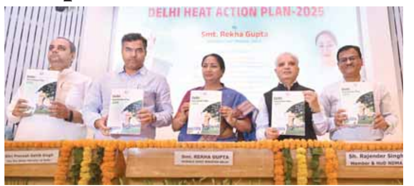
Delhi Chief Minister Rekha Gupta with Health Minister Pankaj Kumar Singh, Water Minister Parvesh Verma and Rajendra Singh, member & HOD, National Disaster Management Authority (NDMA) during the launch of the Heat Action Plan 2025 of the Delhi government

In addition to an early warning system for heat waves, green roofs at bus stops and special wards for heatstroke patients at all hospitals, the plan proposes deploying 1,800 National and Delhi Disaster Response volunteers — known as 'Aapda Mitras' — the plan includes the establishment of shaded cooling shelters and the installation of 3,000-4,000 large RO water units attached to the boundary walls of Delhi government schools and office