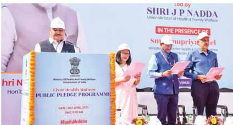
Union Health Minister JP Nadda leads the 'Liver Health Pledge Ceremony' at the Health Camp organised by Ministry of Health in observance of World Liver Day 2025 in New Delhi

He stressed that accountability and coordination across all administrative