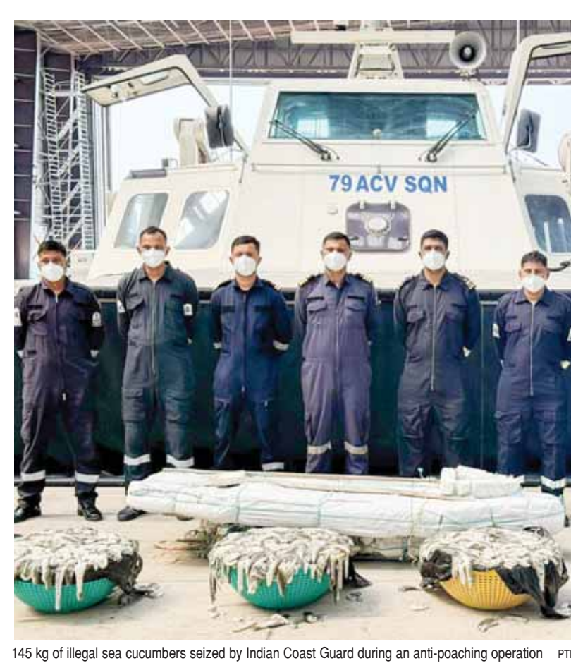
145 kg of illegal sea cucumbers seized by Indian Coast Guard during an anti-poaching operation

The Indian Coast Guard (ICG) on Tuesday said it has seized 145 kilograms of sea cucumbers worth ₹58 lakh during an anti-poaching operation at Ramanathapuram in Tamil Nadu.