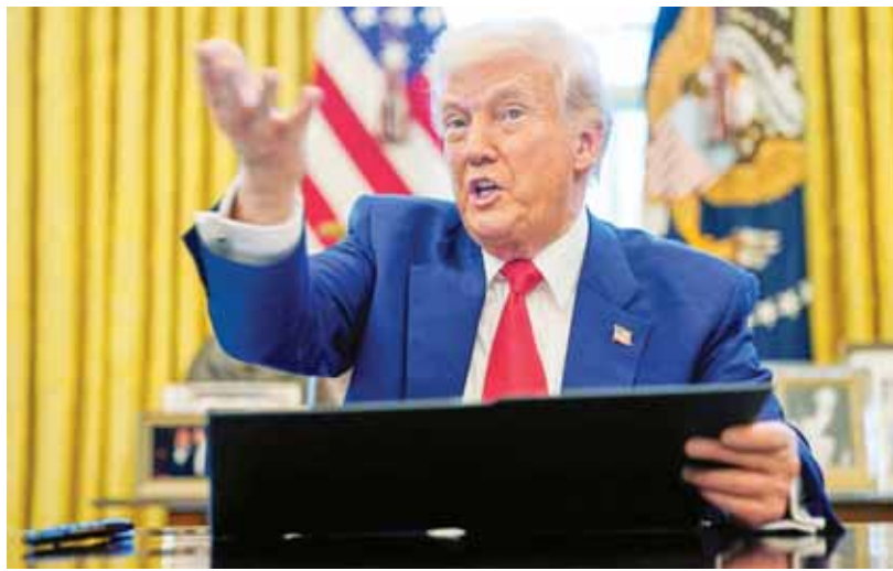
“sector specific” tariffs. “And those are not available for negotiation,” Lutnick said. “They are just going to be part of making sure we reshape the

Section 232 of the Trade Expansion Act of 1962 permits the president to order tariffs for the sake of national security. The probe includes assessing the potential for US domestic production of computer chips to meet US demand and the role of foreign manufacturing and assembly, testing and packaging in meeting those needs.