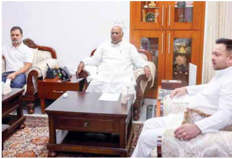
Congress President Mallikarjun Kharge with LoP in the Lok Sabha and party leader Rahul Gandhi and RJD leader Tejashwi Yadav during a meeting in New Delhi

the ground. The meeting also comes weeks after Congress firmed up its strategy for the upcoming Bihar assembly polls at a meeting. Last month, the Congress said it would contest the elections as part of the INDIA bloc and asserted that the alliance partners would take a "collective decision" on the chief ministerial face. The RJD-led Mahagathbandhan is looking to wrest power from the National Democratic Alliance (NDA) in the Assembly polls, which are due later this year.