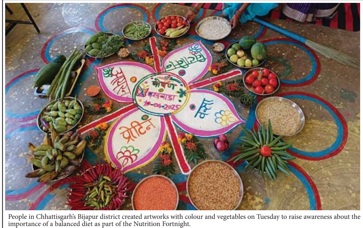
People in Chhattisgarh's Bijapur district created artworks with colour and vegetables on Tuesday to raise awareness about the importance of a balanced diet as part of the Nutrition Fortnight.