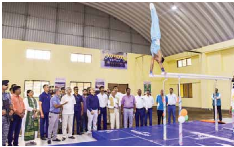
External Affairs Minister inaugurating a gymnastic hall at Rajpipla in Narmada district of Gujarat

External Affairs Minister S Jaishankar, a Rajya Sabha MP from Gujarat, on Tuesday inaugurated a new gymnastic hall upgraded with modern equipment, as well as a smart classroom and an anganwadi built with MPLAD funds in Narmada district.