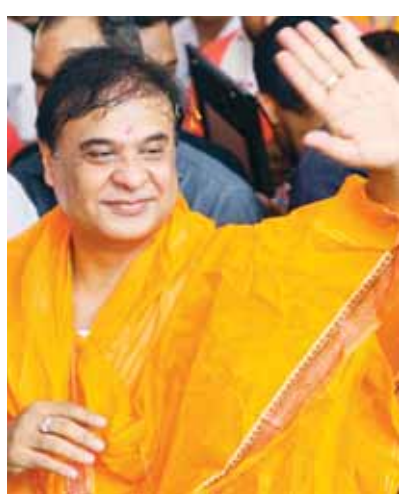
Assam Chief Minister Himanta Biswa Sarma attends Sri Sri Vishnu Hajanta at Barnadi in Nalbari district on Tuesday

Assam Chief Minister Himanta Biswa Sarma on Tuesday said no protest against the Waqf (Amendment) Act, 2025 will be allowed in the state and suggested that the agitators present their side before the Supreme Court.