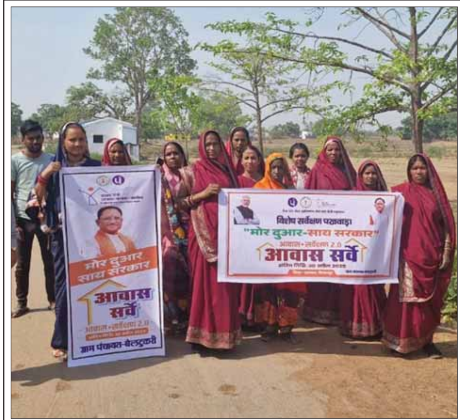
A glimpse of the mega survey campaign for Pradhan Mantri Awas Yojana (rural) in Chhattisgarh's Bilaspur district on Monday. More than one lakh families in the district have been surveyed so far.