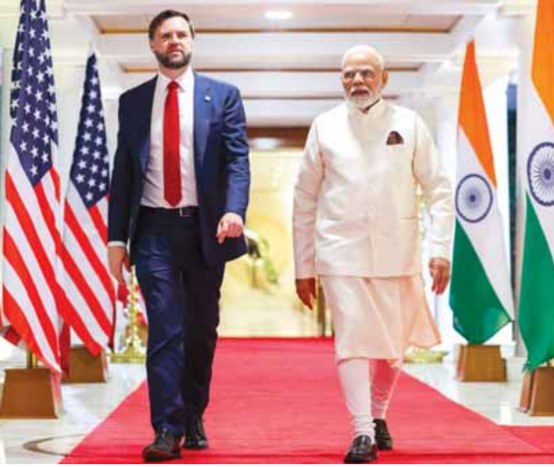
Prime Minister Narendra Modi during a meeting with US Vice President JD Vance

Prime Minister Modi fondly recalled his visit to Washington D.C. in January and his fruitful discussions with President Trump, which laid down the roadmap for close cooperation between India and the