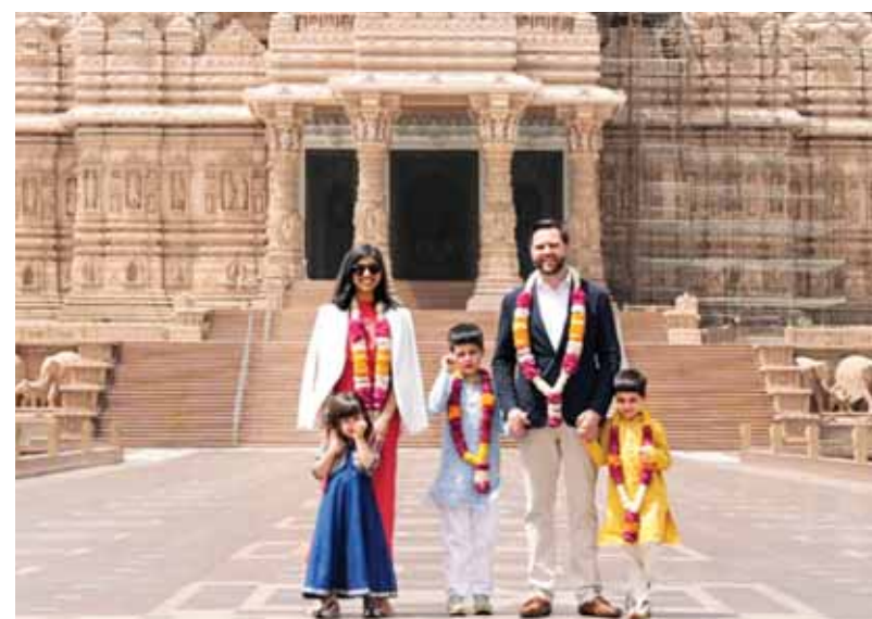
US Vice President JD Vance with Second Lady Usha Vance and their children visits Akshardham temple in New Delhi