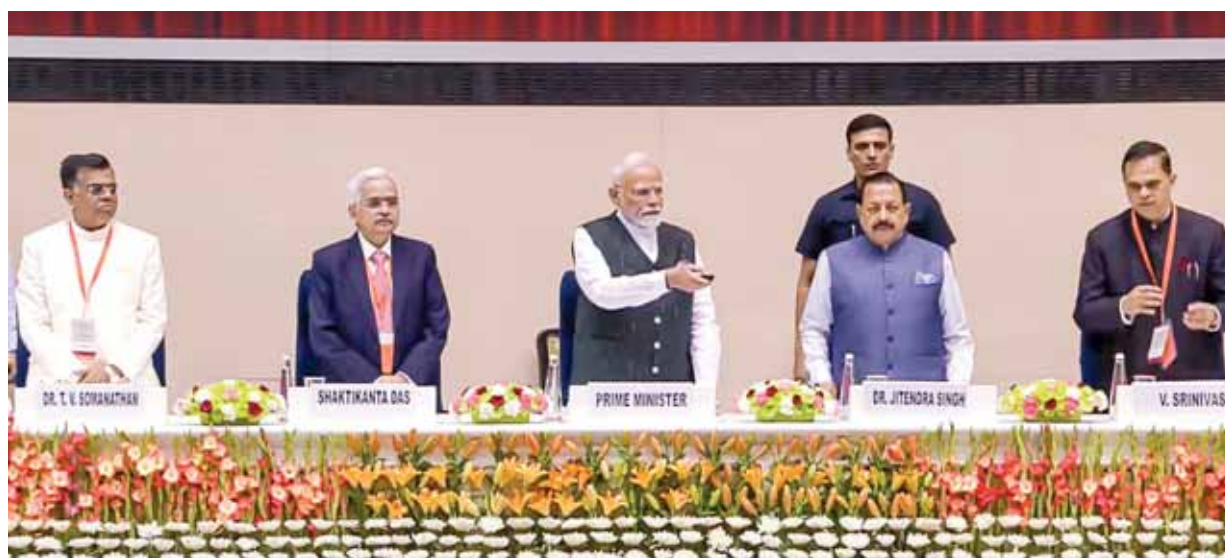
Prime Minister Narendra Modi speaks during the 17th Civil Services Day programme in New Delhi

shape the future of the next thousand years", Modi said. Underscoring the importance of collective effort and determination in achieving the goal of a developed India, the prime minister urged everyone to work tirelessly, every day and every moment, towards this shared vision. Mentioning the rapid changes occurring globally, noting how even within families, interactions with younger generations can make one feel outdated due to the fast pace of change, Modi highlighted the swift evolution of gadgets every two to three years and how children are growing up amidst these transformations. "India's bureaucracy, work processes, and policymaking cannot operate on outdated frameworks," he said, during the function being attended by a large number of civil services officers. Modi said the aspirations of India's society, youth, farmers and women, and their dreams have reached unprecedented heights and stressed the need for extraordinary speed to fulfil these extraordinary aspirations. The prime minister outlined India's ambitious goals for the coming years, including energy security, clean energy, advancements in sports, and achievements in space exploration, emphasising the importance of raising India's flag high