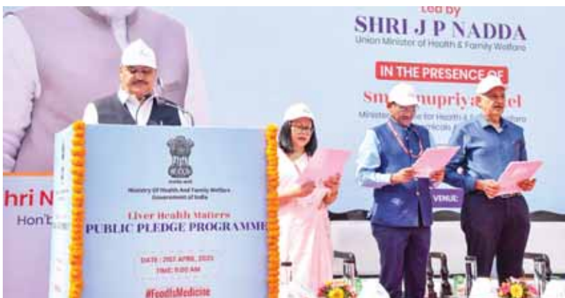
Union Health Minister JP Nadda leads the 'Liver Health Pledge Ceremony' at the Health Camp organised by Ministry of Health in observance of World Liver Day 2025 in New Delhi

Union Health Minister J P Nadda on Monday expressed strong concern over the underutilisation of allocated health funds by states and asked them to focus on improving healthcare infrastructure. Chairing a session at the 17th Civil Services Day celebrations here, Nadda said, "I will not allow this narrative to continue that there's no money or capacity to spend it. Utilisation certificates are not even submitted for funds already given." He recounted a recent visit to a state where allocated funds remained unspent for three years due to repeated tendering and delay in equipment procurement. "Models have changed, new versions have come, but the tender process hasn't even begun," he said. Calling implementation the crux of the problem, Nadda said, "We can aim for the world's largest health coverage program, we will not let it go down the drain." He stressed that accountability and coordination across all administrative