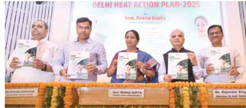
Delhi Chief Minister Rekha Gupta with Health Minister Pankaj Kumar Singh, Water Minister Parvesh Verma and Rajendra Singh, member & HoD, National Disaster Management Authority (NDMA) during the launch of the Heat Action Plan 2025 of the Delhi government

In addition to an early warning system for heat waves, green roofs at bus stops and special wards for heatstroke patients at all hospitals, the plan proposes deploying 1,800 National and Delhi Disaster Response volunteers — known as 'Aapda Mitra's' — the plan includes the establishment of shaded cooling shelters and the installation of 3,000-4,000 large RO water units attached to the boundary walls of Delhi government schools and office