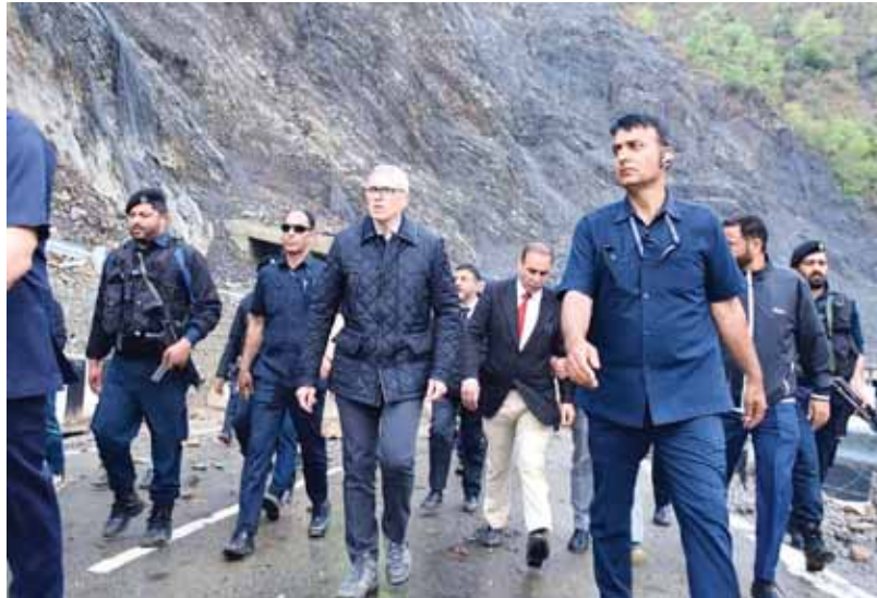
Chief Minister Omar Abdullah visited Maroog in Ramban district to take stock of the devastation caused by the recent flash floods and landslides

Meanwhile, to clear the rush of stranded vehicles, the authorities threw open the Mughal road connecting the twin border districts of Rajouri and Poonch in Jammu to south Kashmir's Shopian district. Chief Minister Omar Abdullah also visited Ramban on Monday to assess the ground situation. Three people, including two minor siblings, were killed and more than 100 people were rescued after cloudburst-induced floods and landslides on Sunday caused massive damage to infrastructure, including roads and residential buildings. Bad weather prevented the Chief Minister from reaching out to the affected families. Earlier in the day, Divisional Commissioner Jammu Ramesh Kumar and Inspector General of Police Bhim Sen Tuti visited flood-affected and landslide-hit areas of Ramban district to assess the damage. Accompanied by Deputy Commissioner Ramban Baseer-Ul-Haq Chaudhary, SSP Ramban Kulbir Singh, SSP