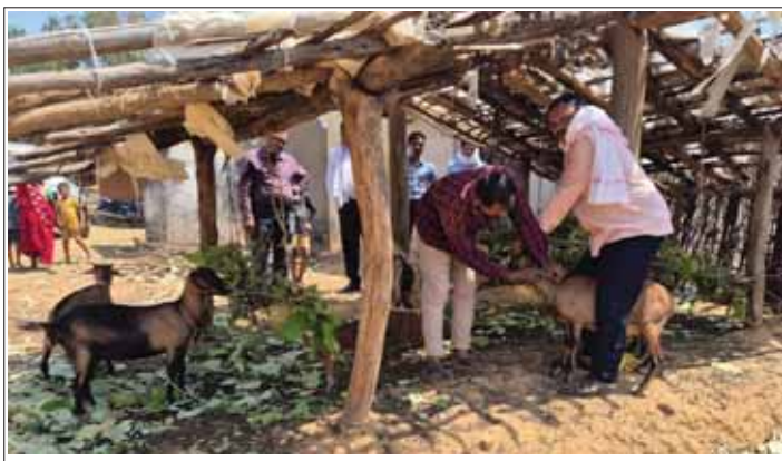
At the demand of the locals, a veterinary camp to vaccinate livestock was held for the first time in the remote Ghaton village in Chhattisgarh's Surguja district on Tuesday.

Excitige Engineer Hasdeo Barrage W/M Division Rampur/Korba (C.G.) G-252600517/5