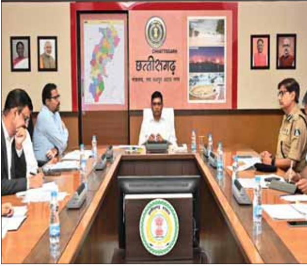
Intendents of police to compulsorily hold periodic meetings of the District Coordination Committee to review the progress of implementation.

He also directed collectors and superintendents of police to compulsorily hold periodic meetings of the District Coordination Committee to review the progress of implementation.