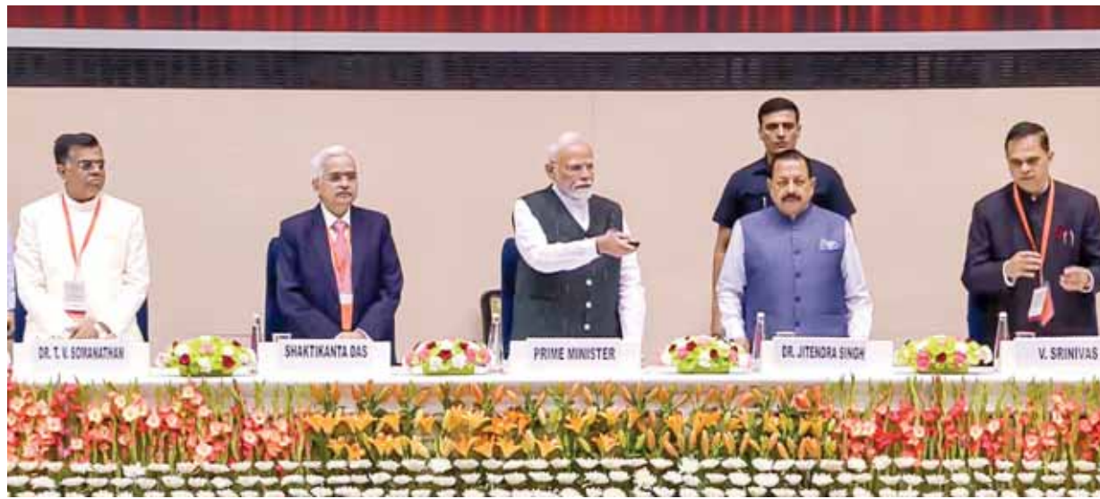
Prime Minister Narendra Modi speaks during the 17th Civil Services Day programme in New Delhi

The prime minister outlined India's ambitious goals for the coming years, including energy security, clean energy, advancements in sports, and achievements in space exploration, emphasising the importance of raising India's flag high