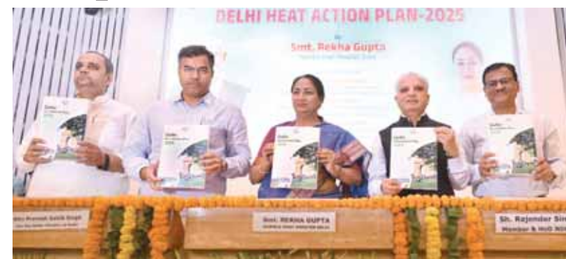
Delhi Chief Minister Rekha Gupta with Health Minister Pankaj Kumar Singh, Water Minister Parvish Verma and Rajendra Singh, member & HoD, National Disaster Management Authority (NDMA) during the launch of the Heat Action Plan 2025 of the Delhi government

In addition to an early warning system for heat waves, green roofs at bus stops and special wards for heatstroke patients at all hospitals, the plan proposes deploying 1,800 National and Delhi Disaster Response volunteers — known as 'Aapda Mitra' — the plan includes the establishment of shaded cooling shelters and the installation of 3,000-4,000 large RO water units attached to the boundary walls of Delhi government schools and office