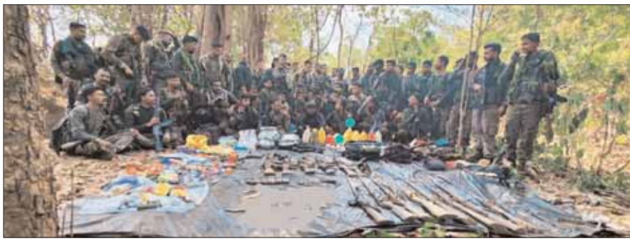
Security personnel with seized arms and ammunition pose for a picture in Bokaro on Monday.

State police informed that the operation was launched based on precise intelligence