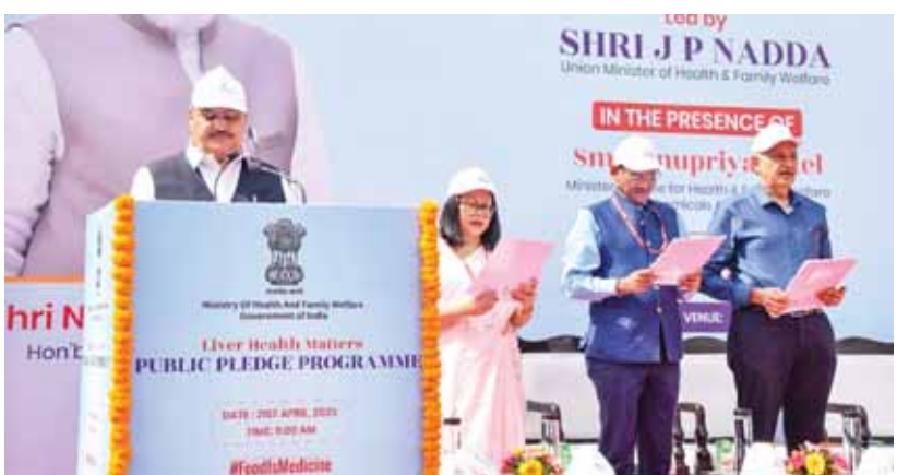
Union Health Minister JP Nadda leads the 'Liver Health Pledge Ceremony' at the Health Camp organised by Ministry of Health in observance of World Liver Day 2025 in New Delhi

Calling implementation the crux of the problem, Nadda said, "We can aim for the world's largest health coverage program, we will not let it go down the drain."