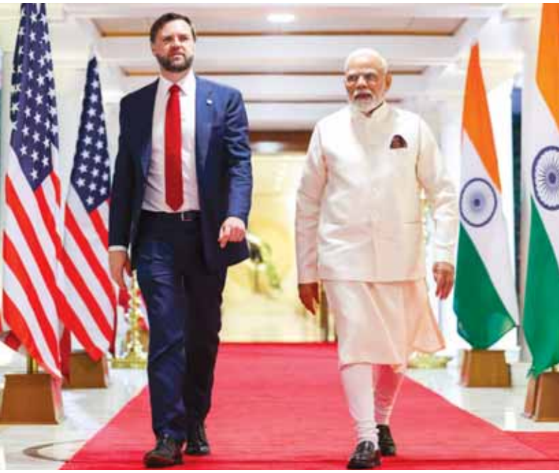
Prime Minister Narendra Modi during a meeting with US Vice President JD Vance

Prime Minister Modi fondly recalled his visit to Washington D.C. in January and his fruitful discussions with President Trump, which laid down the roadmap for