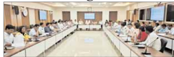
Transport Minister Deepak Biruwa holds a meeting with officials in Ranchi on Monday.

In the meeting, the updated status related to the Transport Department and Road Safety in the state was presented and the District Transport Officers were warned for not achieving the target and were directed to complete the target in the coming month. The Minister directed all the Districts and Departments to work in a