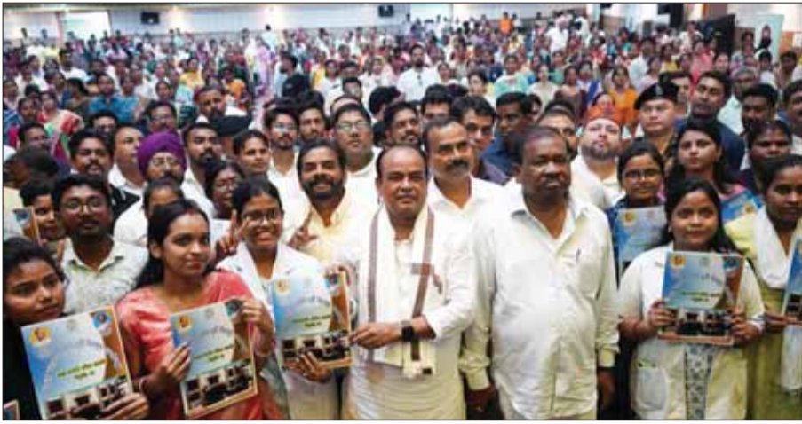
PNS : JAMSHEDPUR

In a significant push to strengthen healthcare delivery in rural areas, Health