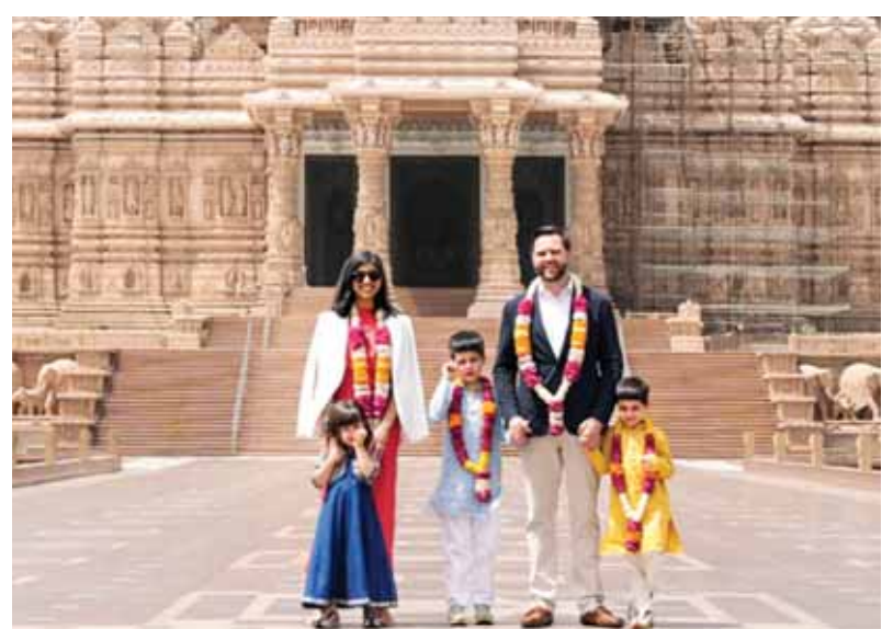
US Vice President JD Vance with Second Lady Usha Vance and their children visits Akshardham temple in New Delhi

The Vance family visited the Akshardham temple where they posed for camera crews outside the shrine's imposing facade. Vance and his family will travel to Jaipur and Agra during their four-