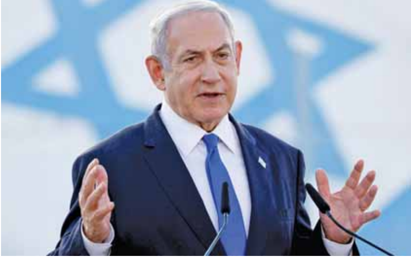
Minister Narendra Modi to Washington in February, US President Donald Trump said he agreed with the Indian leader to enhance the scope of the project, linking it right up to America. Singh emphasised the strategic partnership between India and Israel, noting that they had stood by each other in the hour of crisis.

moving towards peace and inclusion, connectivity and of course enhancing the incredible relations between our people". Touching upon areas of cooperation between the two countries, Herzog described the IMEC as the "future of the world", which has the potential to change the entire geostrategic situation of the globe.