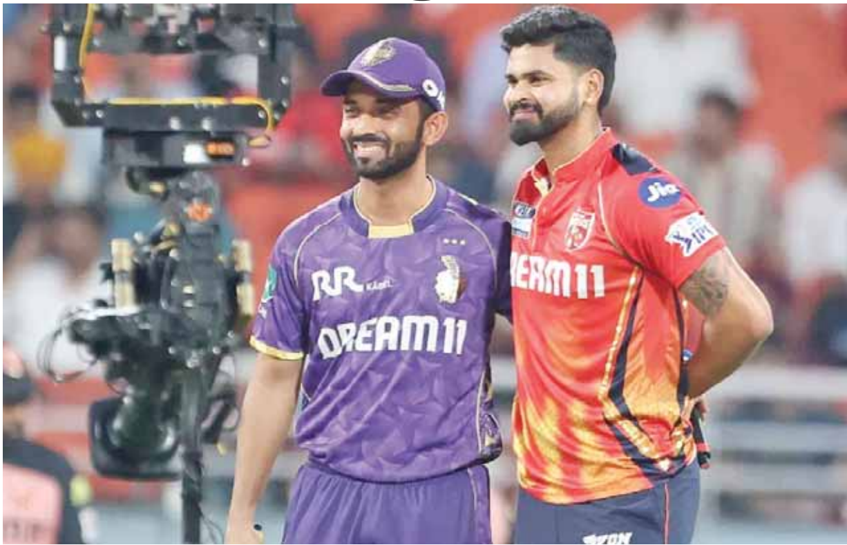
With five defeats in eight matches, another stumble could tighten their already narrow path to the playoffs. Their top-order remains unsettled, the

Iyer too could have a Rahul-like moment under the Eden lights. KKR, on the other hand, are in desperate need of momentum.