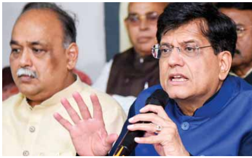
Union Minister Piyush Goyal

Steel is an essential component in nearly every sector of life, be it shipping, shipbuilding, railways, defence, automobiles, infrastructure across the country, it is there in every walk of life,' he said.