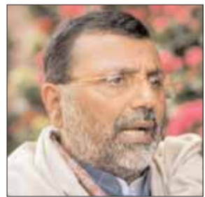
RANCHI

Cong taunts Dubey; says, he Doesn't trust Modi and Shah