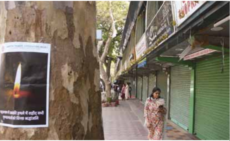
A poster put up in Janpath, Delhi, paying tributes to victims of the Pahalgam terror attack during a bandh called by city traders against the attack