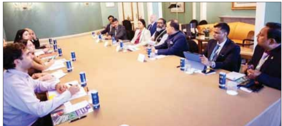
The High Level delegation from Jharkhand led by CM Hemant Soren had a one-to-one discussion with a Spanish delegation comprising the Ministry of Economy, Trade and Enterprise, Government of Spain, Spanish Chamber of Commerce and Spain India Council Foundation, at Madrid. The discussions focussed on deepening Indo-Spanish investments and trade through consistent dialogue, exchange of information and enhanced mutual visits. The CM welcomed the members of the Chamber of Commerce and Council to visit Jharkhand and explore investment opportunities in the State.

Many suggestions and demands were put forward by the honourable members for increasing passenger facilities such as regular train service from Ranchi to Ayodhya, Lucknow, Jaipur, Haridwar, Rishikesh, Dehradun, Katra, Indore, Siliguri etc., Ranchi-Kamakhyia should be operated two days a week as before, Hatia-Durg special train should be operated normally, request to speed up the construction work of Silli-Ilu (Bypass) railway line, initiative should be taken to reopen the closed railway ticket counter in