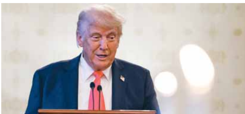
President Barack Obama was in office, years before the full-scale invasion that began in 2022.

Crimea is a strategic peninsula along the Black Sea in southern Ukraine. It was seized by Russia in 2014, while US