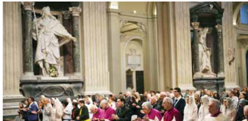
Faithful gather for a prayer for Pope Francis at the St John Lateran Basilica in Rome