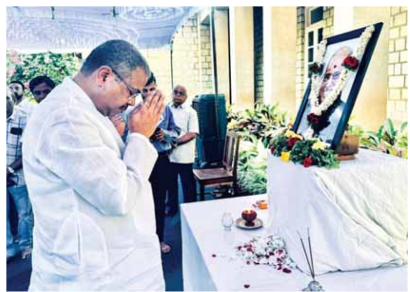
Union Education Minister Dharmendra Pradhan paying tribute to former ISRO chief K Kasturirangan at Raman Research Institute in Bengaluru

"During this one year, under this campaign, more than 140 crore trees have been planted in the name of the mother across the country. Observing this initiative of India, people outside the country have also planted trees in the name of their mother," he said. In his broadcast, Modi also lauded how in Wayanad, saffron is not being grown in any field or soil but with the help of aeroponics technique.