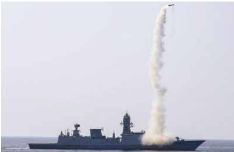
Indian Navy Ships undertook successful multiple anti-ship firings to revalidate and demonstrate readiness of platforms, systems and crew for long range precision offensive strike.

The visuals showed BrahMos anti-ship and anti-surface cruise missiles being launched from a fleet of warships, including Kolkata-class destroyers and