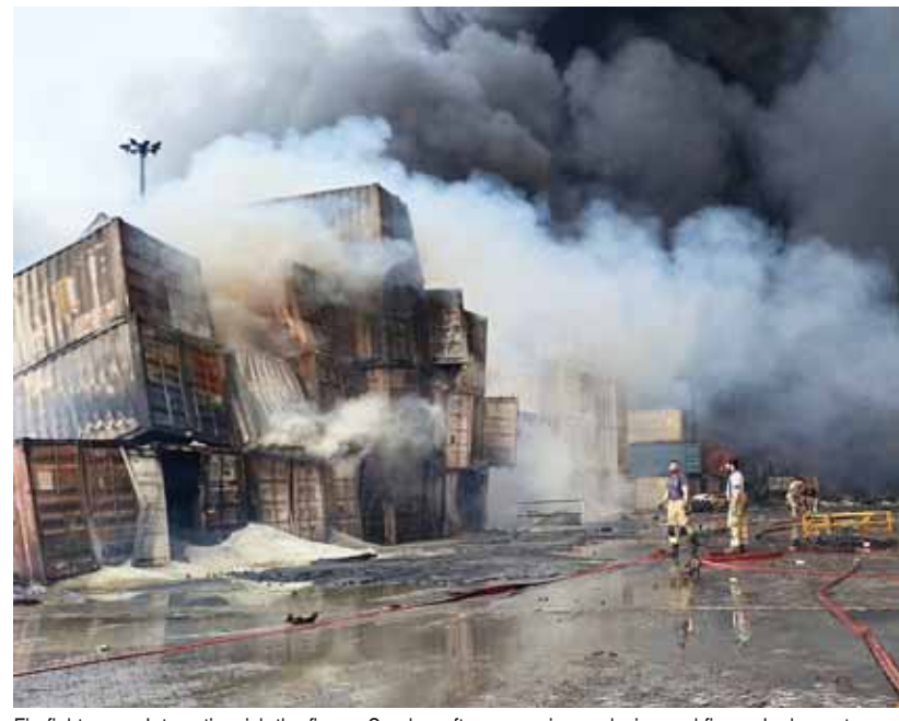
Firefighters work to extinguish the fire on Sunday, after a massive explosion and fire rocked a port near the southern port city of Bandar Abbas, Iran on Saturday

PRESS TRUST OF INDIA ■ Muscat A massive explosion and fire rocked a port on Saturday in southern Iran reportedly linked to a shipment of a chemical ingredient used to make missile propellant, killing 25 people and injuring around 800 others. Helicopters and aircraft dumped water from the air on the raging fire through the night into Sunday morning at the Shahid Rajaei port. The explosion occurred just as Iran and the United States met Saturday in Oman for the third round of negotiations over Tehran's rapidly advancing nuclear program. No one in Iran outright suggested that the explosion came from an attack. However, even Iranian Foreign Minister Abbas Araghchi, who led the talks, on Wednesday acknowledged that "our security services are on high alert given past instances of attempted sabotage and assassination operations designed to provoke a legitimate response."