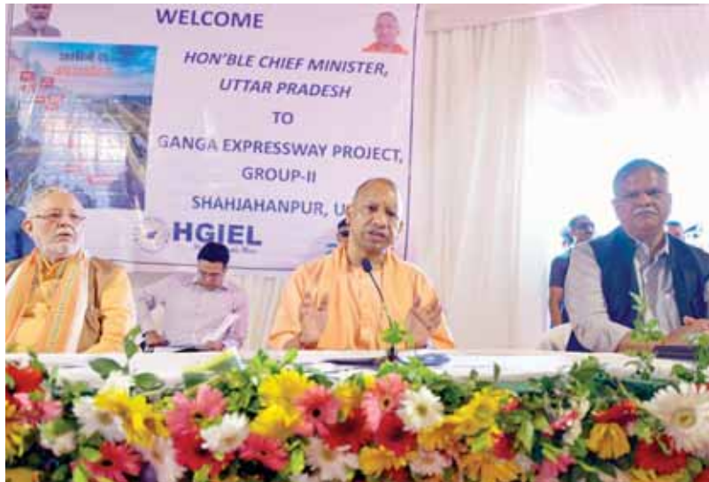
Uttar Pradesh Chief Minister Yogi Adityanath address during inspection of the Ganga Expressway construction in Jalalabad

After the inspection, the Chief Minister moved to a secure facility (safe room) where he held a detailed meeting with administrative officers, representatives from the Uttar Pradesh Expressways Industrial Development Authority (UPEI-