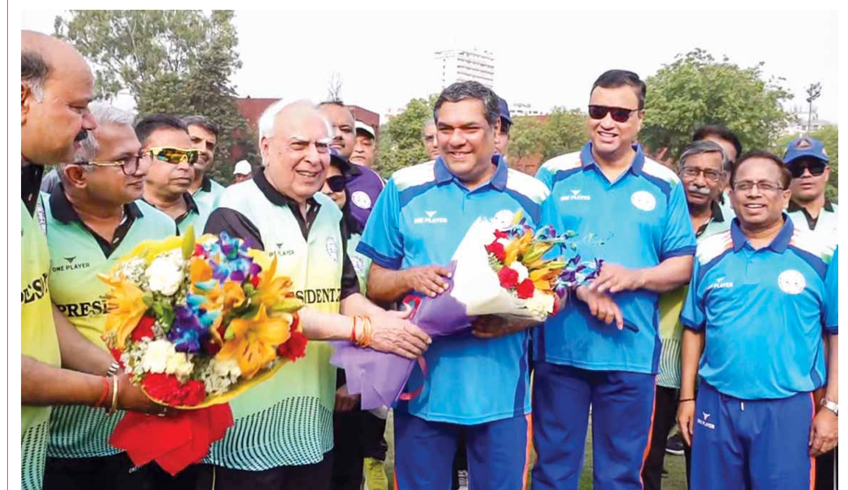
Chief Justice of India Sanjiv Khanna being greeted by Supreme Court Bar Association President Kapil Sibal before the start of a friendly cricket match between CJI XI and SCBA-XI at Modern School Cricket Ground in New Delhi on Sunday

"To me, he was far more than a mentor — he was a guiding light, a wellspring of wisdom, compassion, and quiet strength. I consider myself truly fortunate to have received his affection, blessings and guidance over the years," the minister wrote.