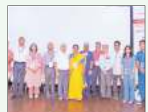
Doctors from India and Nepal gathered for a conference on Dermatotomy

Evolving Dermatotomy in Daily Practice: Precision, Passion, Excellence, and Progress, attracted more than 300 dermatologists from