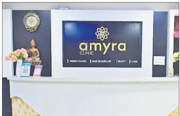
A high end clinic 'Amyra' at Hanamkonda (file photo)

A case has been registered, and an investigation is currently underway.